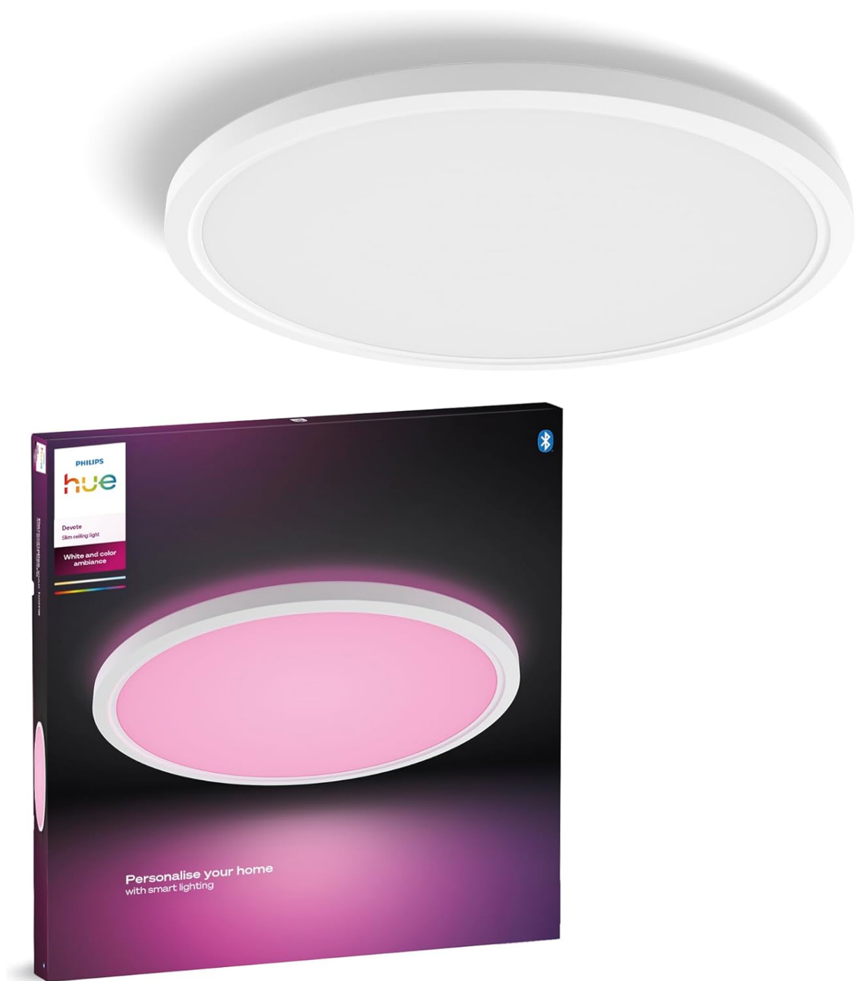
Image: The Philips Hue Devote Smart LED Panel shown with its product packaging, highlighting its design and smart lighting capabilities.