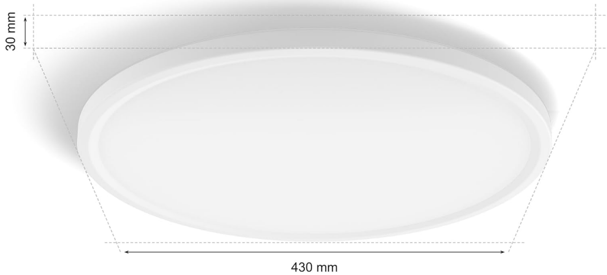
Image: A technical diagram illustrating the dimensions of the Philips Hue Devote Smart LED Panel, showing a diameter of 430 mm and a depth of 30 mm.