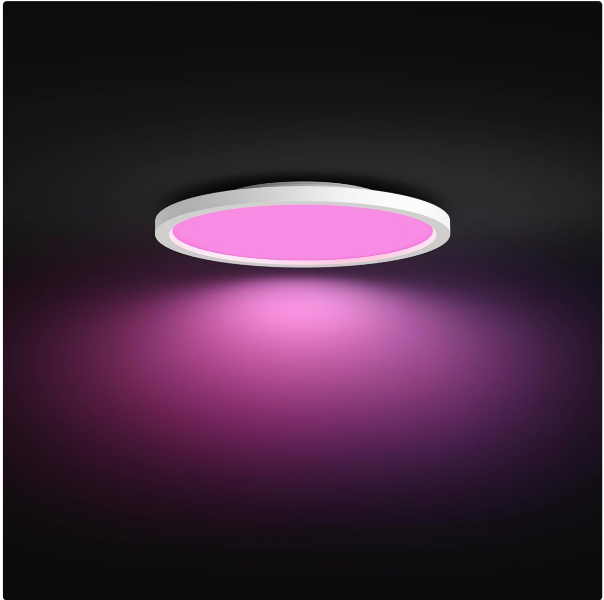
Image: The Philips Hue Devote Smart LED Panel illuminating a space with a distinct pink hue, demonstrating its color ambiance capabilities.