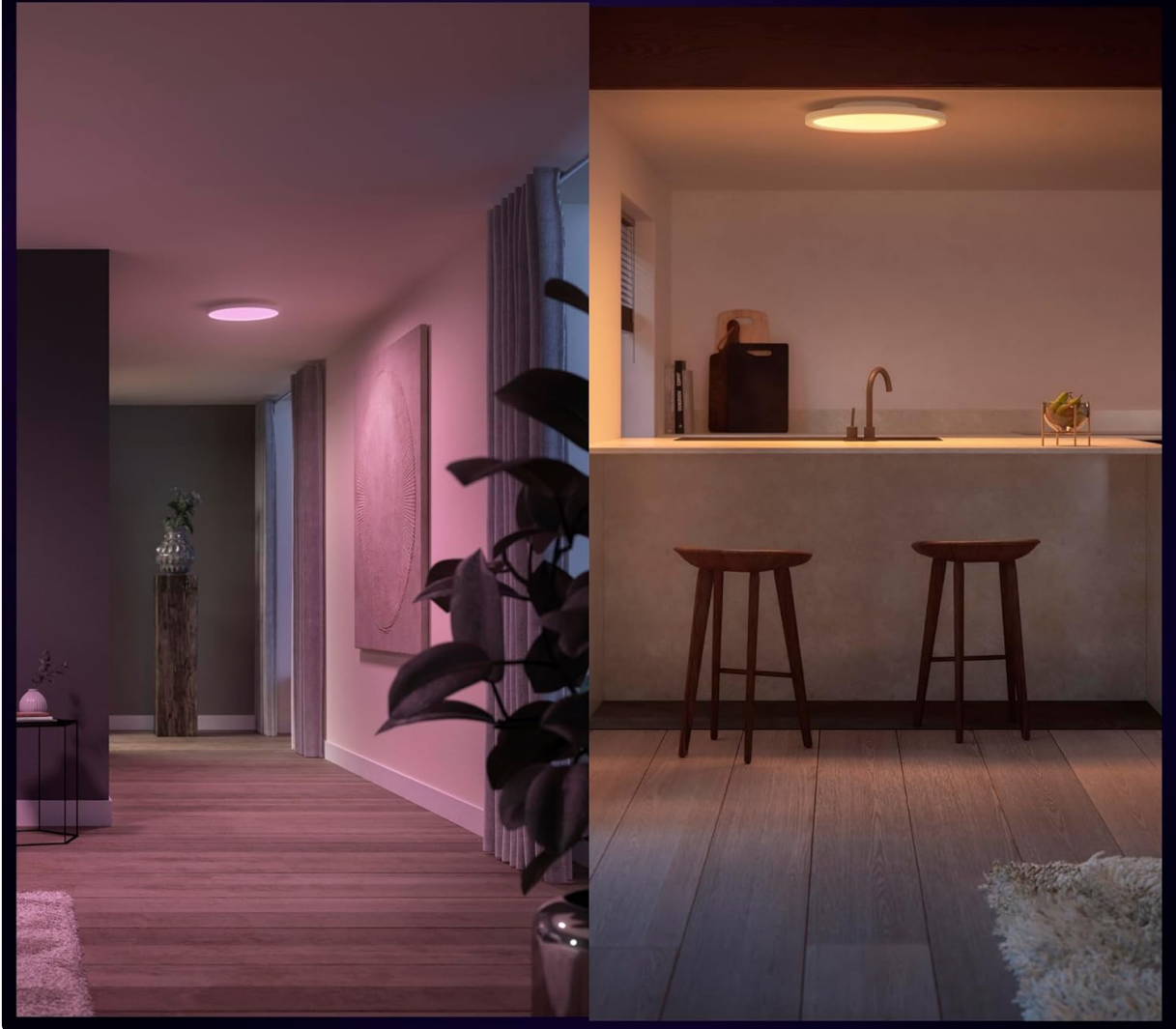
Image: A split view illustrating the Philips Hue Devote Panel's versatility, displaying a room lit with a soft pink light and another with a warm, inviting glow.

Choose from dozens of premade scenes in the Hue app (or make your own!)