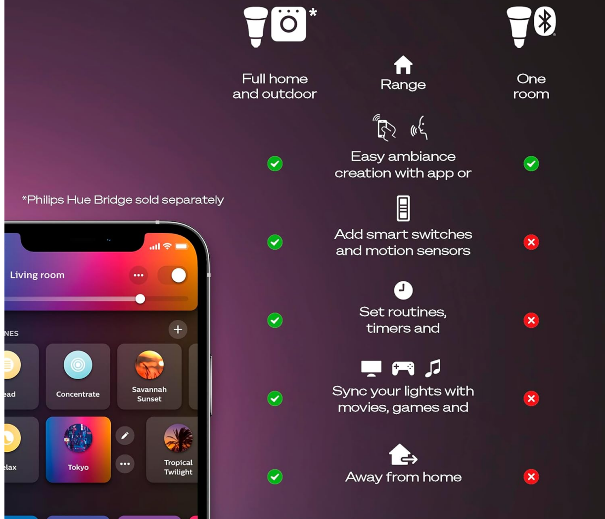
Image: A comparative chart outlining the features available when controlling Philips Hue lights via a Hue Bridge versus direct Bluetooth connection, indicating the expanded capabilities with the Bridge.