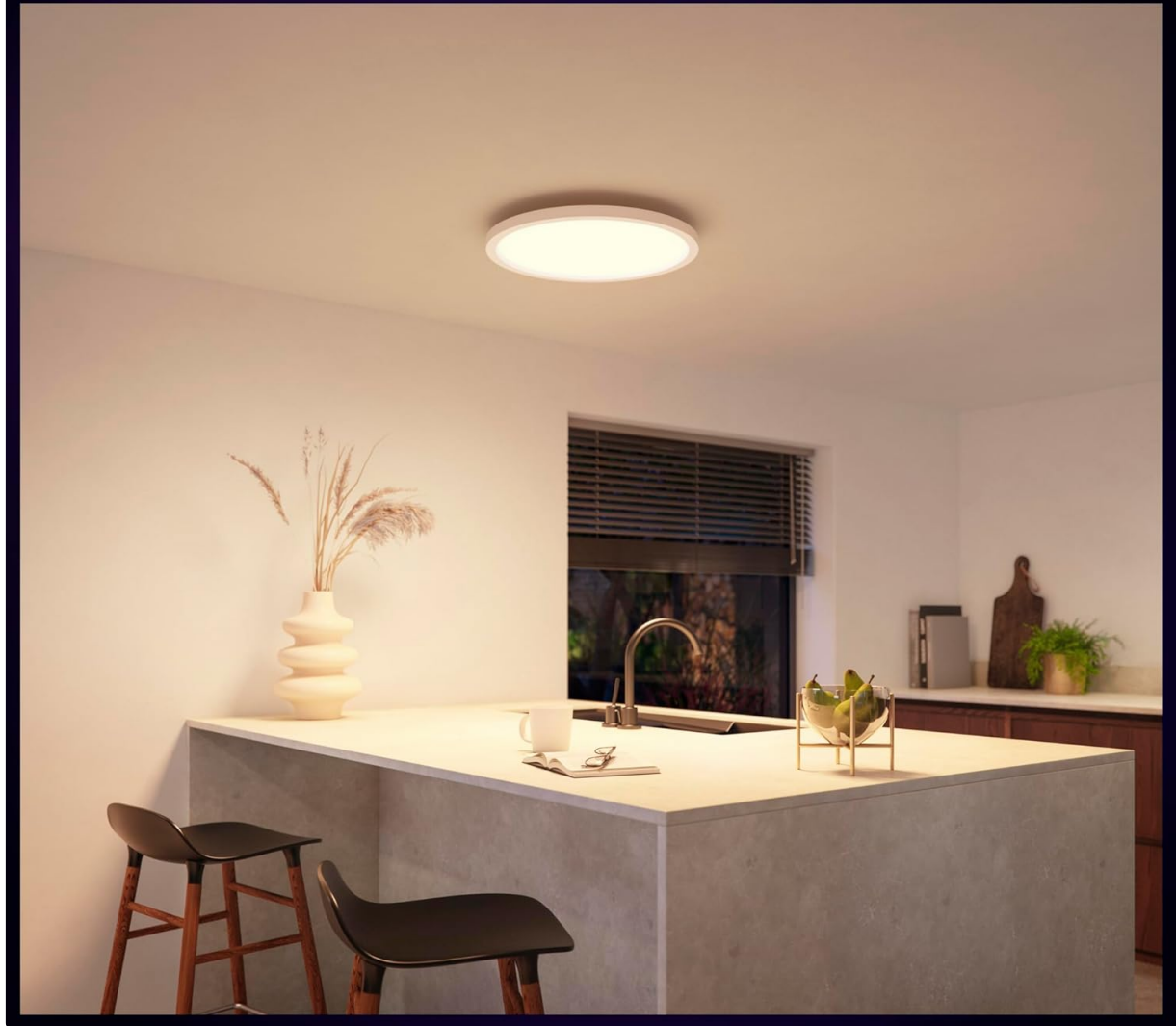
Image: The Philips Hue Devote Smart LED Panel seamlessly integrated into a modern kitchen ceiling, providing ambient lighting over a countertop.

Designed to fit seamlessly into your home decor