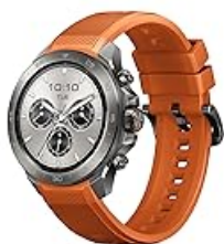
GS Explorer S Ti

To unlock the full potential of your Mibro GS Pro2, download the official Mibro Fit App from your smartphone's app store (compatible with iOS 13.0 and above, and Android 9.0 and above). Follow the in-app instructions to pair your watch via Bluetooth. This enables data synchronization, notification management, and personalized training plans.