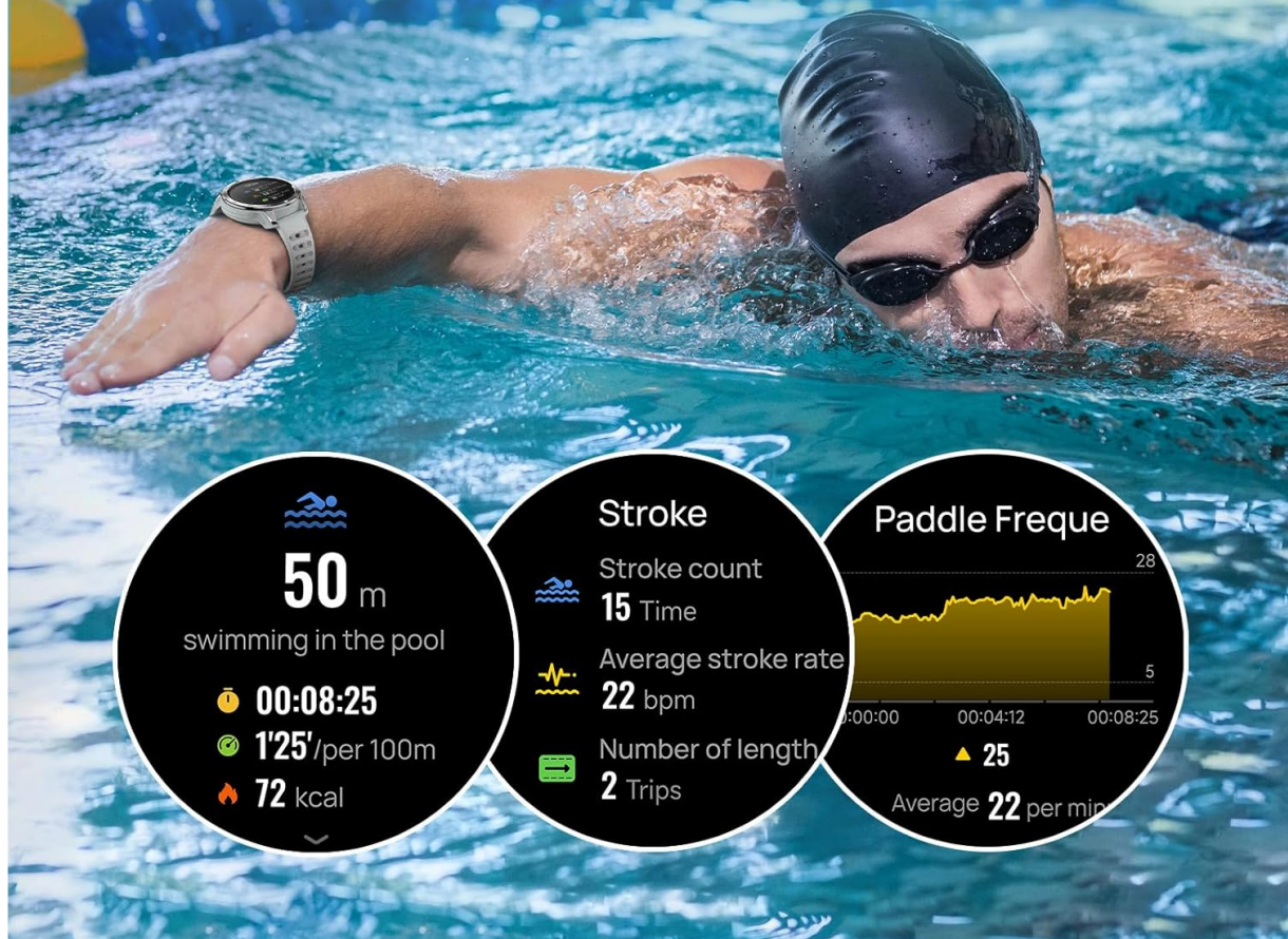
Image: A person swimming with the Mibro GS Pro2 Smart Watch, showing swimming metrics like distance, time, calories, stroke count, average stroke rate, and paddle frequency.

The watch is equipped with a dual-frequency GNSS chip (supporting L1+L5 bands and 5 satellite positioning systems) for advanced GPS accuracy. This ensures precise positioning and route tracking for outdoor activities. The trajectory navigation feature allows flexible adjustment of routes and stores up to 10 frequently used paths, even in signal-free areas. Exercise tracks can be automatically recorded and synced to Strava.