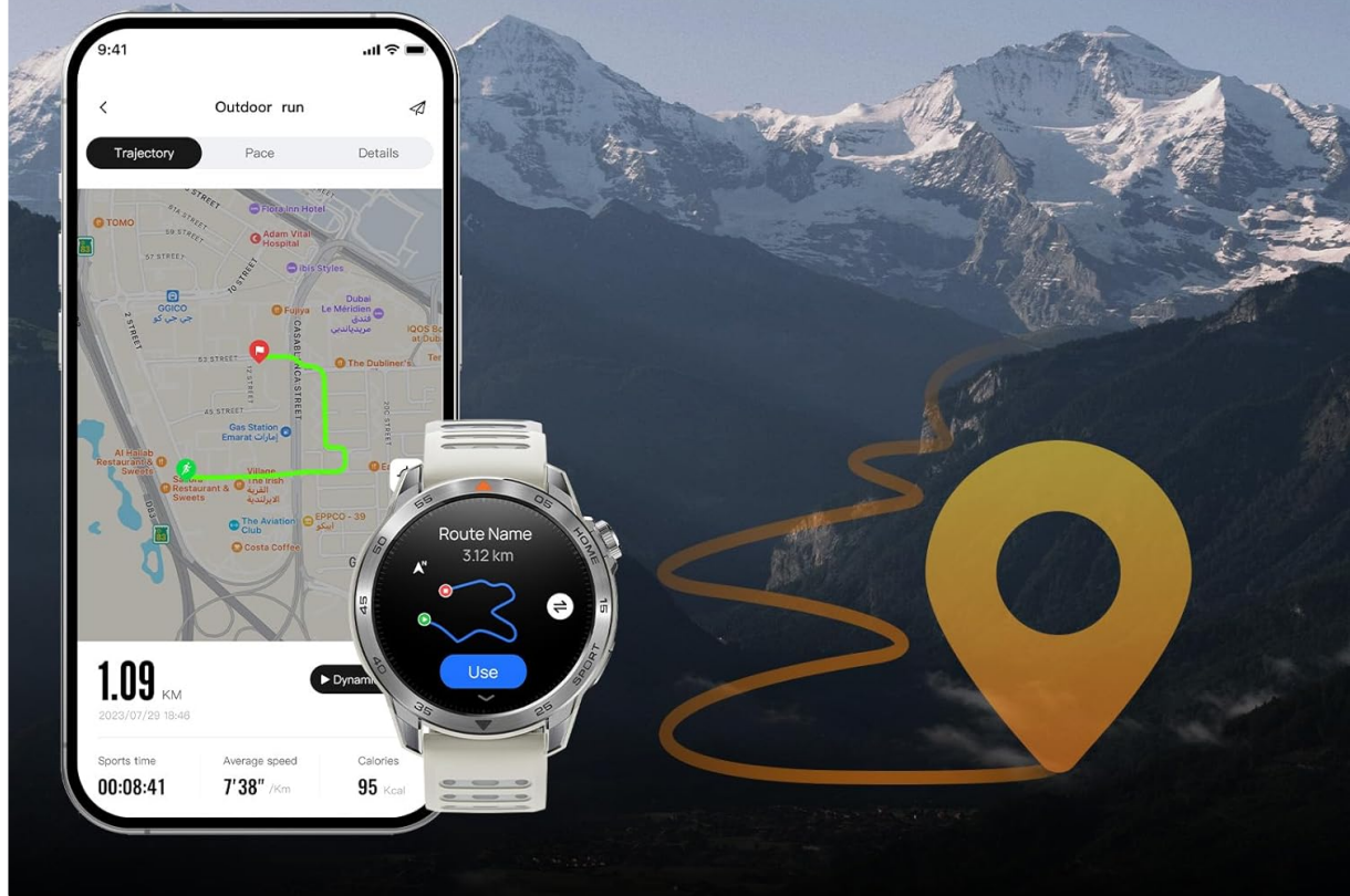
Image: The Mibro GS Pro2 Smart Watch displaying a route on its screen, mirrored on a smartphone, illustrating its complete route management and navigation capabilities.