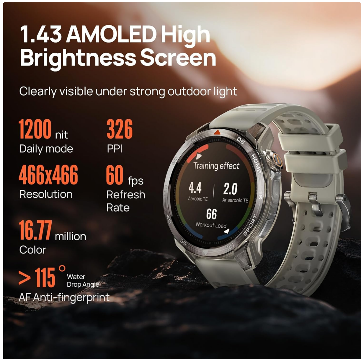
Image: The Mibro GS Pro2 Smart Watch screen highlighting its 1.43-inch AMOLED display, 1200 nit brightness, 466x466 resolution, 60fps refresh rate, and 16.77 million colors.

The Mibro GS Pro2 features a 1.43-inch AMOLED high-brightness screen with a 466x466 resolution and 60fps refresh rate, offering clear visibility even under strong outdoor light. The display supports 16.77 million colors and has an AF anti-fingerprint coating. Navigate the watch using its responsive touchscreen and physical buttons.