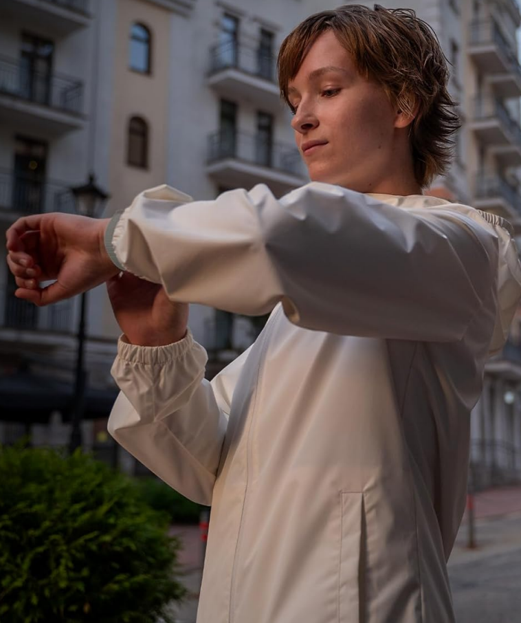
Image: The Mibro GS Pro2 Smart Watch displaying a 100% charge on its screen, indicating readiness for use.