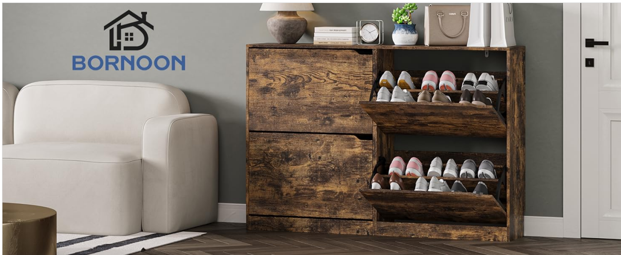
Image 4: Open Drawers with Shoes. This image demonstrates how shoes are stored within the open flip drawers.