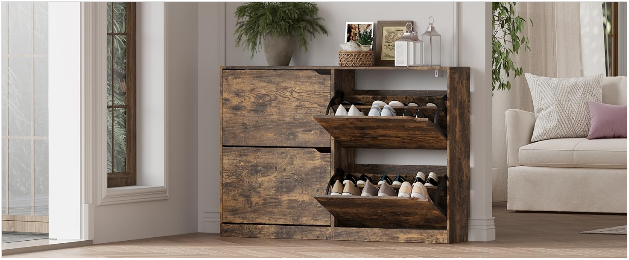
Image 1: Anti-Tip Safety Feature. Always install the anti-tip device to prevent accidents, especially in homes with children.