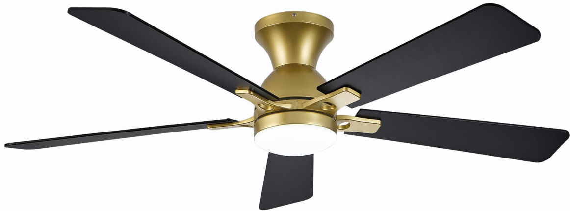
Figure 2.1: Dolavast 52-inch Gold Ceiling Fan with Lights and Remote.