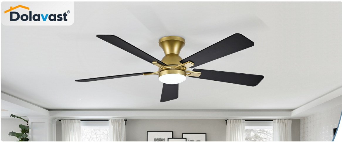
Figure 2.2: Key features of the Dolavast ceiling fan.