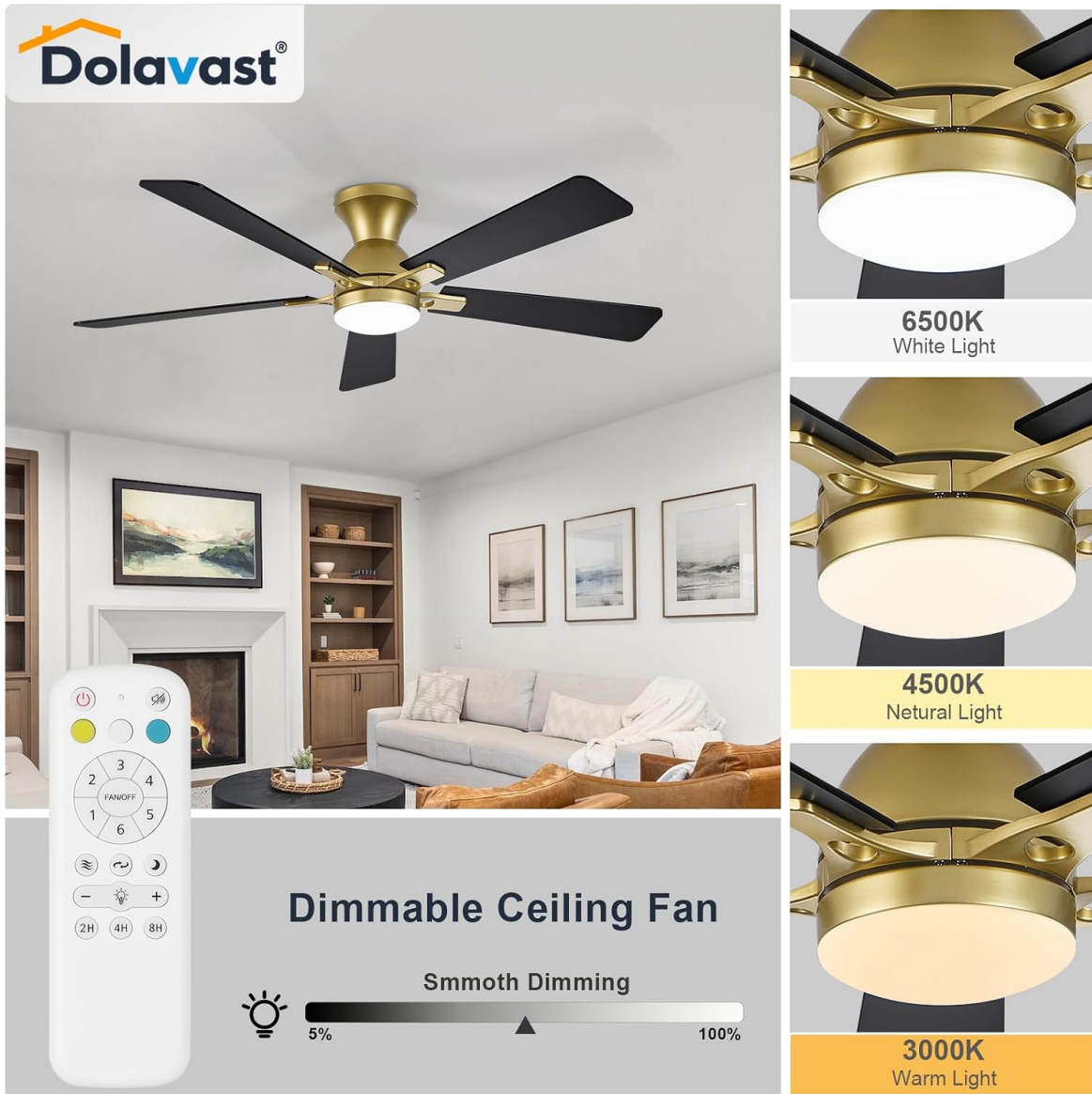
Figure 4.1: Remote control for the Dolavast ceiling fan.