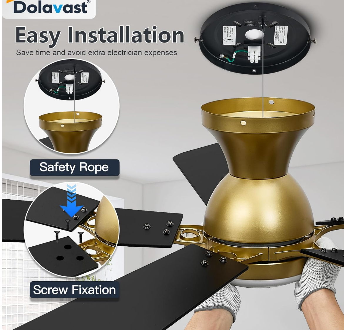
Figure 3.1: Easy installation steps for the Dolavast ceiling fan.