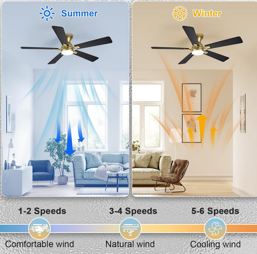
Figure 4.2: Reversible airflow for year-round comfort.