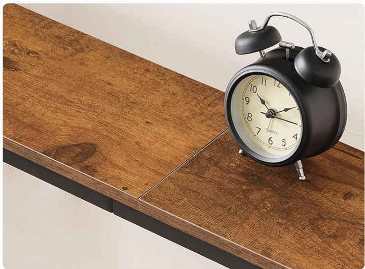
Rustic Wooden Panel