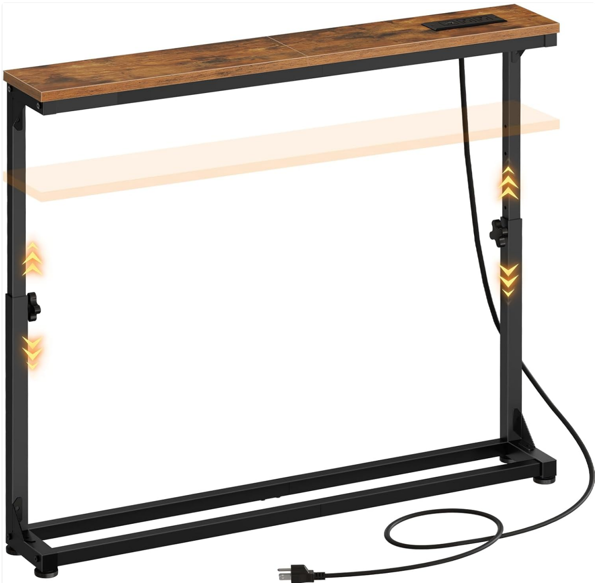
Image 1.1: The HOOBRO Narrow Console Table BF95UXG01, showcasing its rustic brown top and black metal frame, with an integrated charging station and height adjustment mechanism.