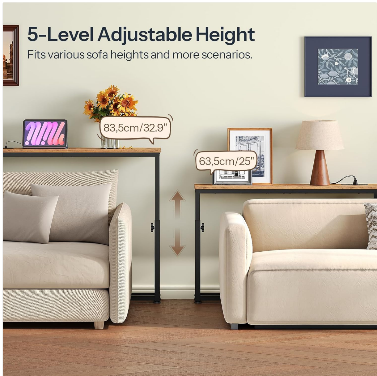
Image 5.1: Illustration of the 5-level adjustable height feature, showing the table adapting to different sofa heights, ranging from 25 inches to 32.9 inches.