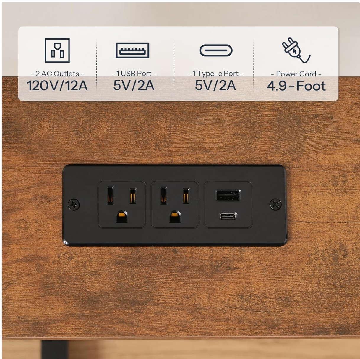
Image 5.2: A detailed view of the charging station, showing the two AC outlets, one USB-A port, and one USB-C port, ready for device connection.