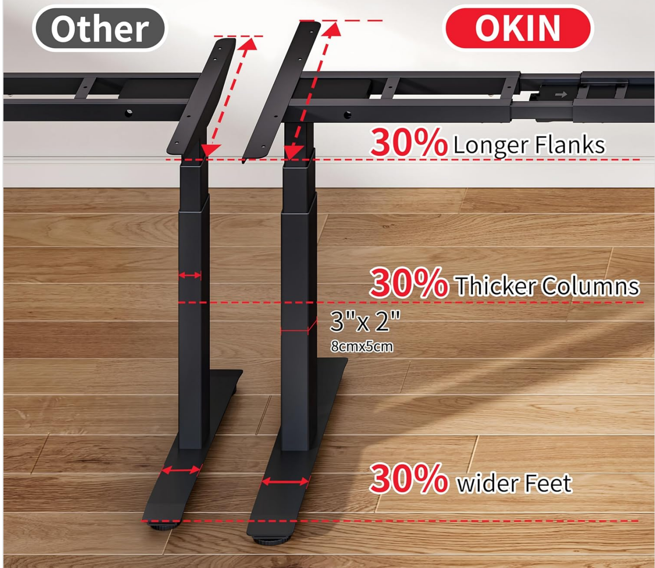
Image: Comparison showing Okin's frame features, including 30% longer flanks, 30% thicker columns (3"x2"), and 30% wider feet for enhanced stability.