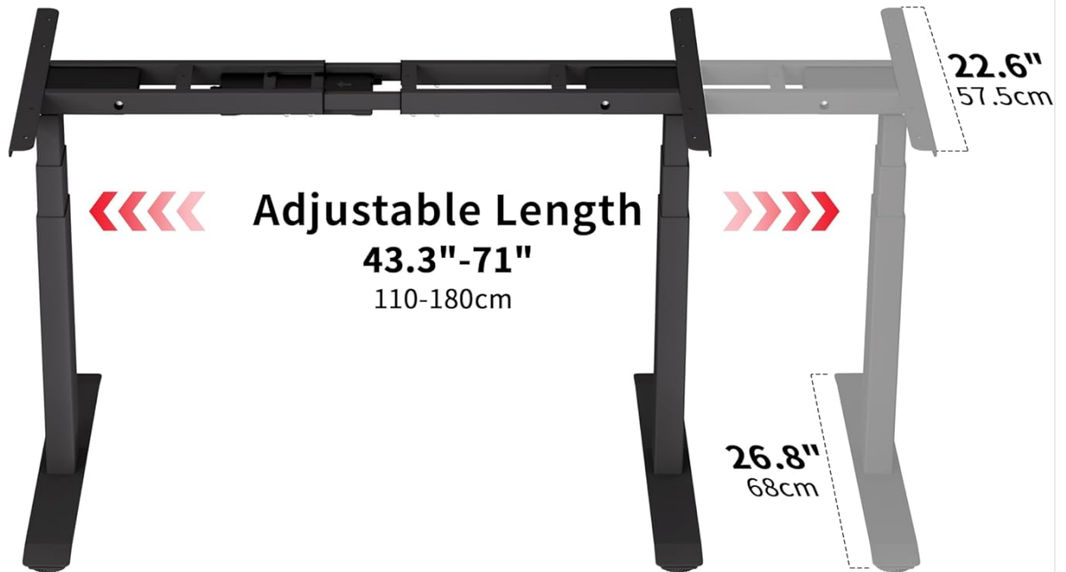
Image: Diagram illustrating the recommended tabletop dimensions and the adjustable length of the desk frame's crossbar (43.3"-71").