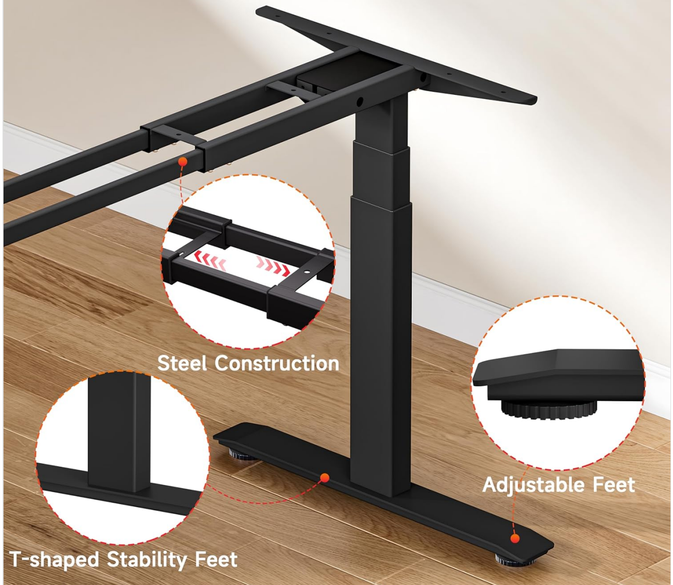
Image: Close-up view highlighting the sturdy steel construction, T-shaped stability feet, and adjustable leveling feet of the desk frame.