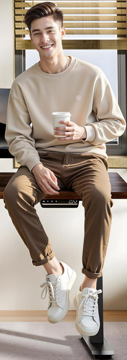
Image: Visual representation of the desk frame's maximum load capacity of 270 lbs.