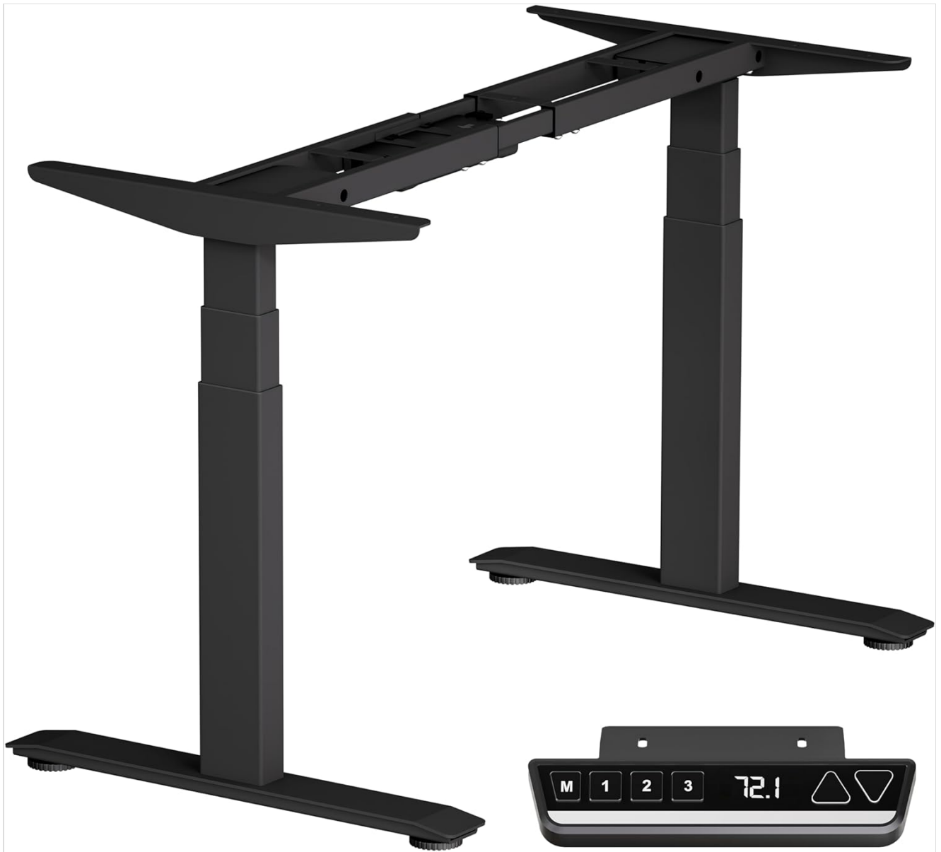
Image: Overview of the Okin Standing Desk Frame components, including the lifting columns, feet, crossbar, and control panel.