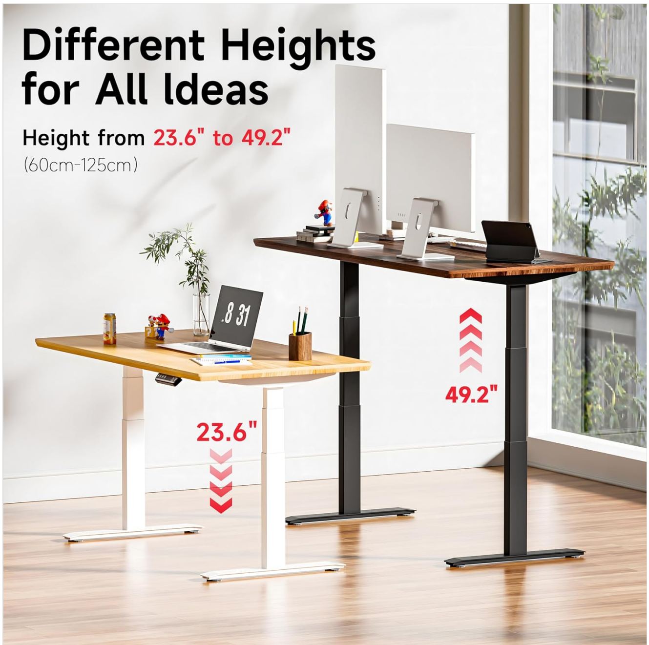
Image: Illustration demonstrating the adjustable height range of the Okin standing desk, from 23.6 inches to 49.2 inches.