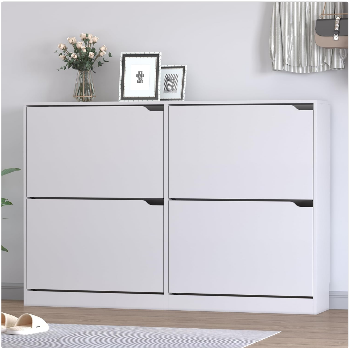
Image: The BORNOON 4-Drawer Basic White Shoe Cabinet in its closed state, showcasing its sleek design.