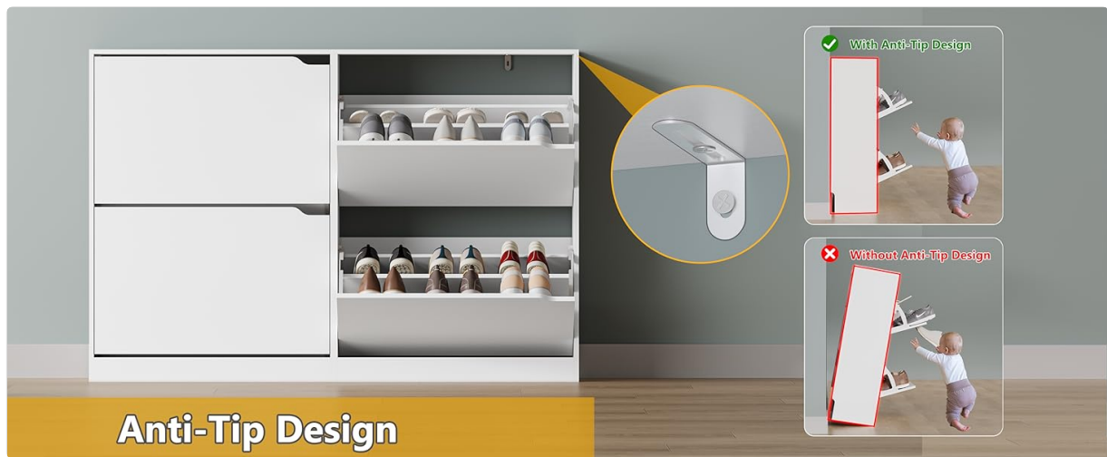
Image: Visual representation of the anti-tip design, showing how to secure the cabinet to a wall for enhanced stability and safety.