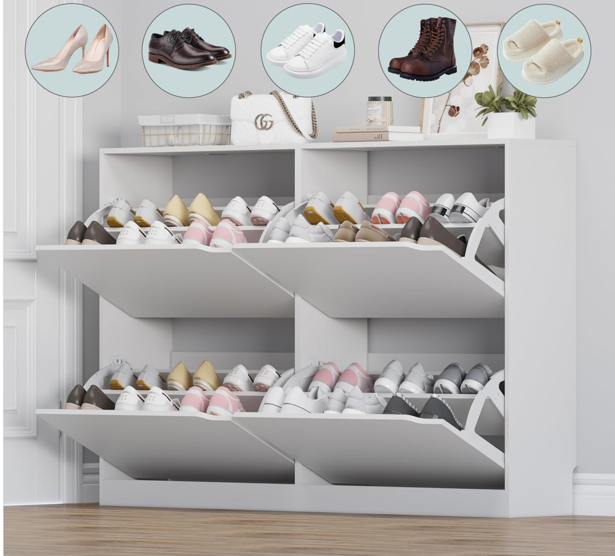
Image: The shoe cabinet accommodating different types of footwear, from sneakers to high heels, demonstrating its versatile storage.