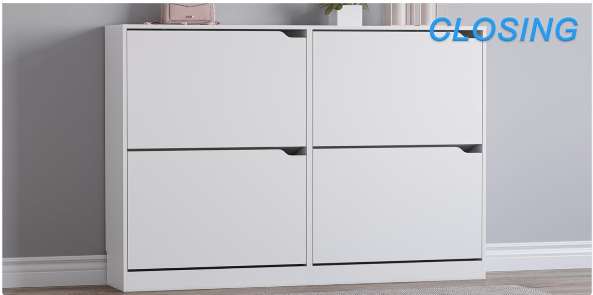
Image: Demonstration of the flip-out drawers in both open and closed positions, highlighting the cabinet's functionality.