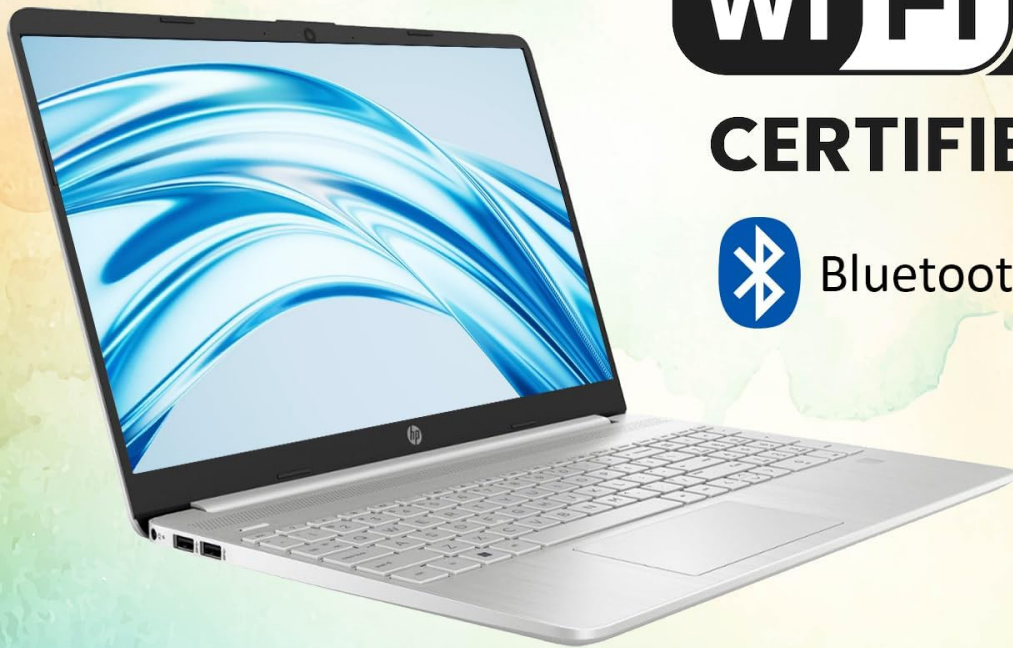
Image: Wireless connectivity features of the HP 15 Laptop.

Stay effortlessly connected with strong Wi-Fi and Bluetooth —no more spotty internet or weak signals.