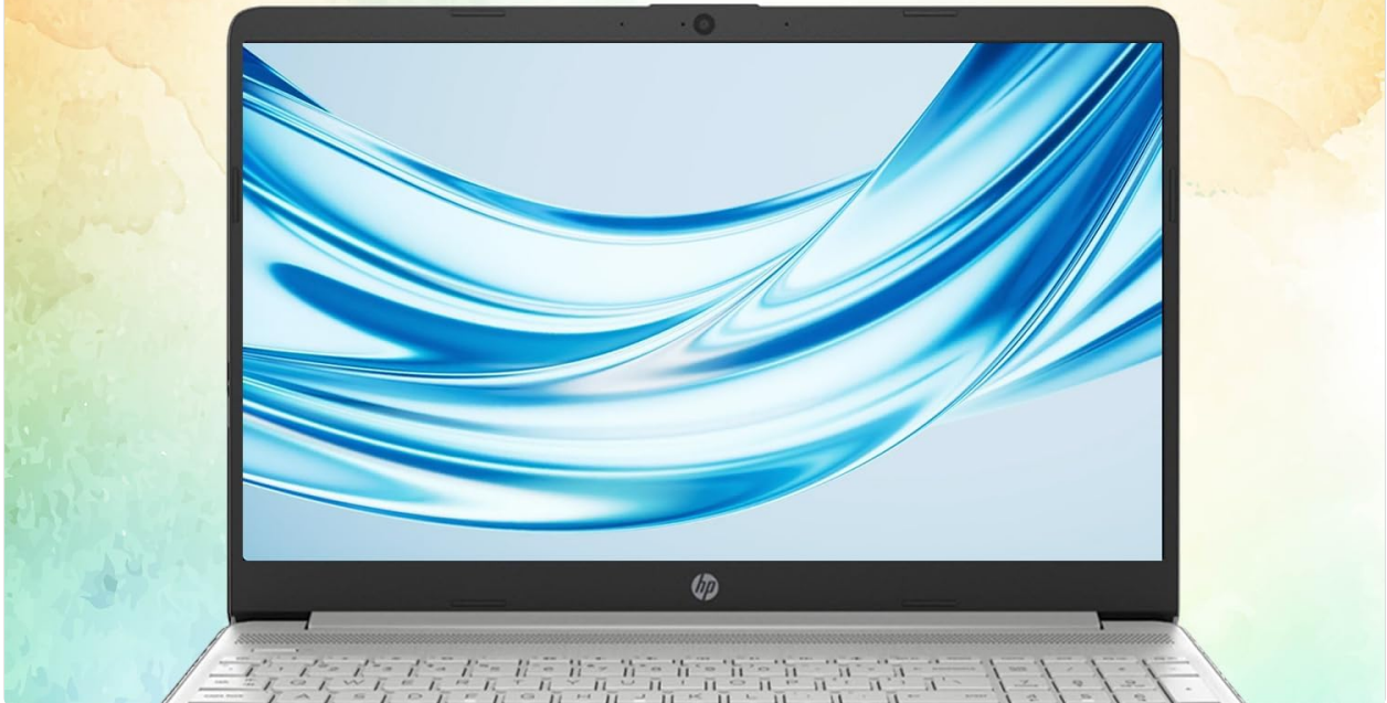
Image: The 15.6-inch Full HD IPS display with anti-glare coating.

15.6" FHD 1920x1080 LED Display with Anti Glare Coating