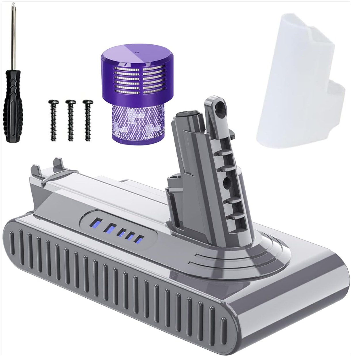
Image: The complete package includes the replacement battery, a screwdriver, three screws, a post filter, and a battery protection cap for a comprehensive replacement solution.