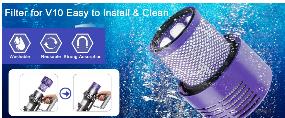
Image: Visual guide demonstrating the simple steps to install and clean the included post filter, ensuring optimal vacuum performance.