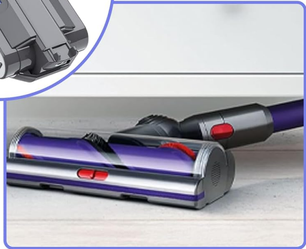
Image: This visual confirms the battery's compatibility with Dyson V10 and SV12 series vacuum cleaners, including models like V10 Animal, V10 Absolute, and V10 Motorhead.