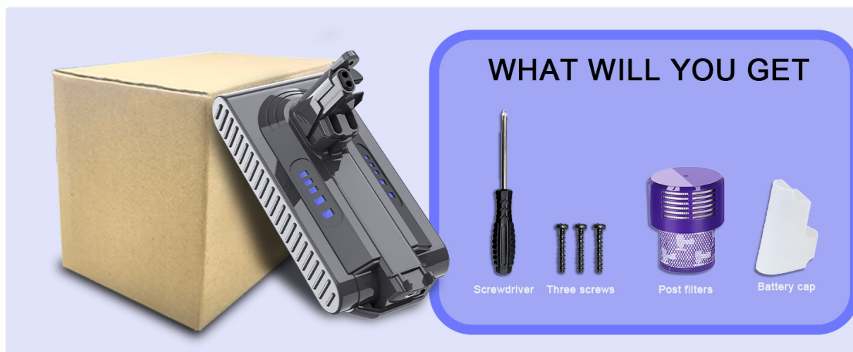
Image: This diagram illustrates the components included in the package, which are essential for the battery replacement process.

8. Initial Charge: It is recommended to fully charge the new battery before its first use.