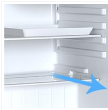
Image: A close-up view of the drip tray, which is used to collect water during the manual defrosting process.