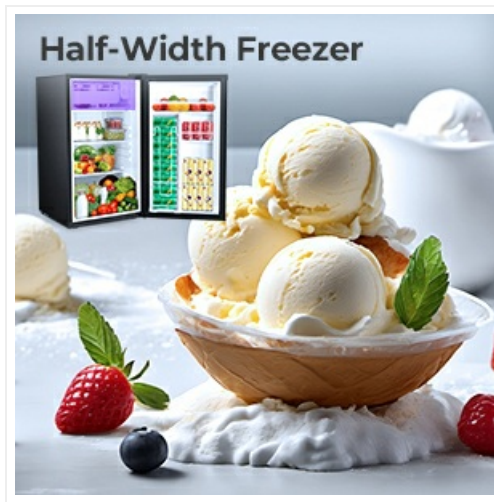
Image: A close-up view of the half-width freezer compartment, designed for ice cubes and small frozen items.