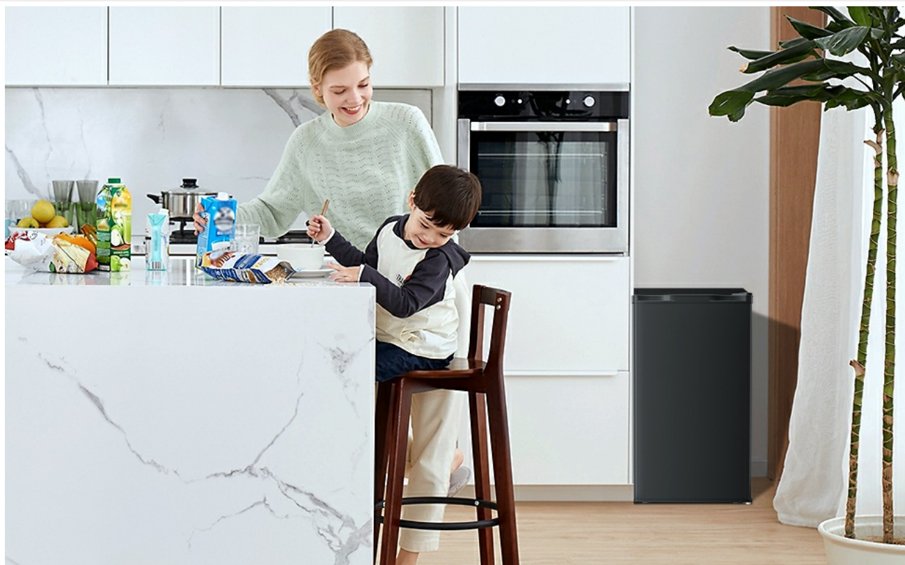
Image: Examples of suitable placement for the mini fridge in different environments, including an office, RV, lounge area, and kitchen.