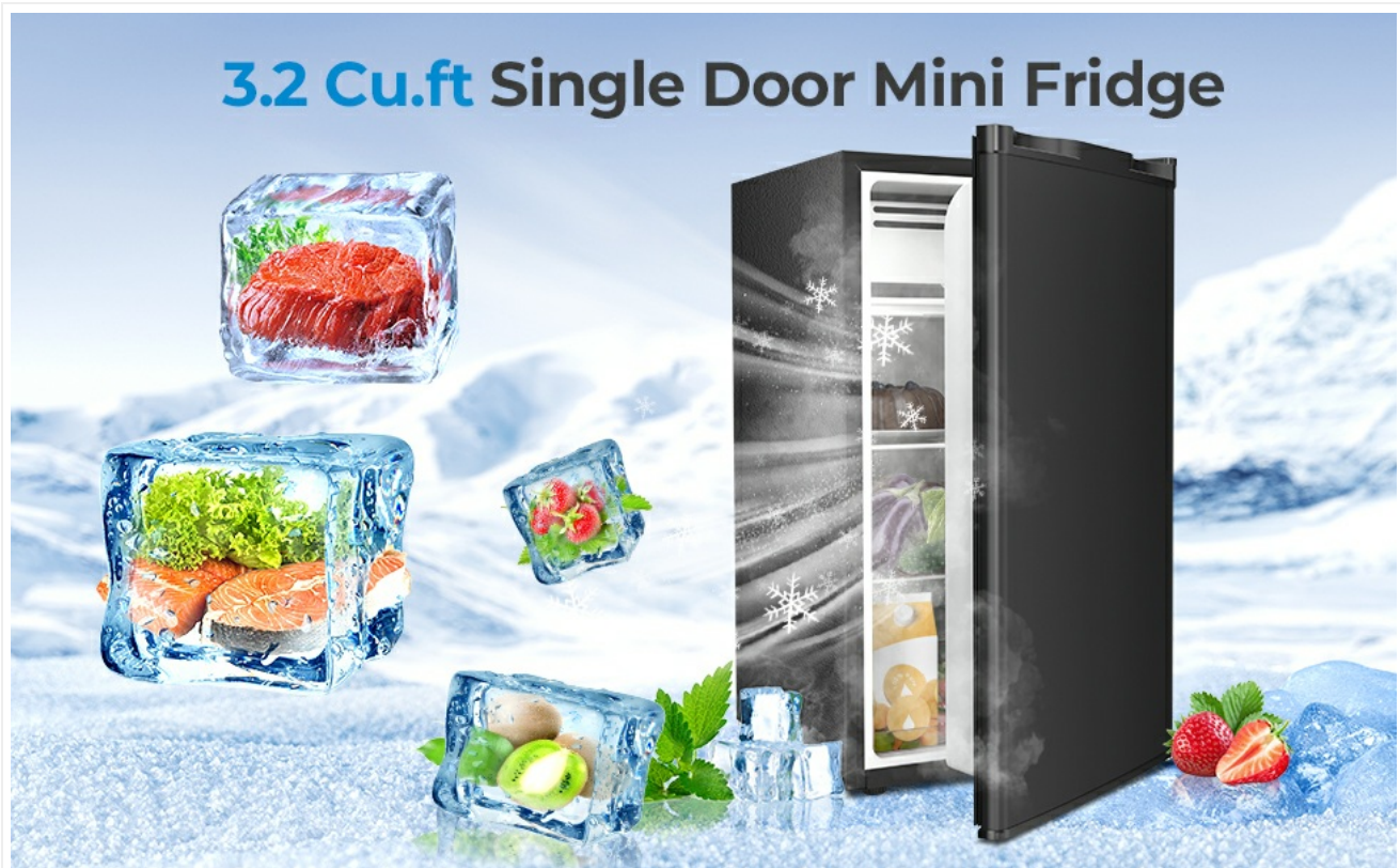
Image: An infographic highlighting the main features of the 3.2 Cu.ft Mini Fridge, including the half-width freezer, temperature control, large door chamber, and drip tray.

The refrigerator includes adjustable glass shelves, allowing you to customize the interior space to accommodate items of various sizes. The door features a large-capacity chamber, ideal for storing frequently used beverage bottles or cans, optimizing internal storage.