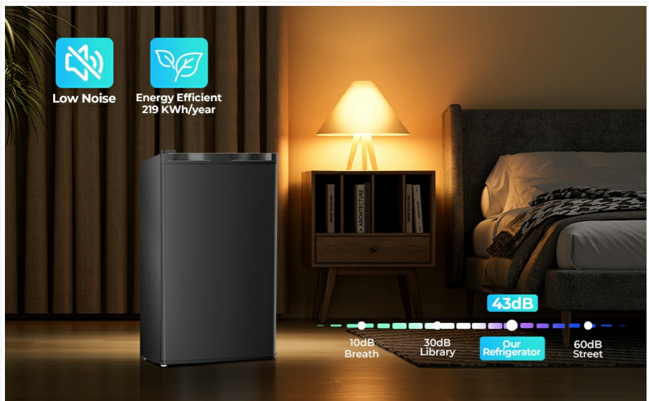
Image: An illustration demonstrating the quiet operation of the refrigerator, comparing its 43dB noise level to common ambient sounds.

The refrigerator operates at a low noise level of 38 dB, ensuring minimal disturbance in quiet environments such as bedrooms or offices. This allows for peaceful rest and work without significant noise interference.