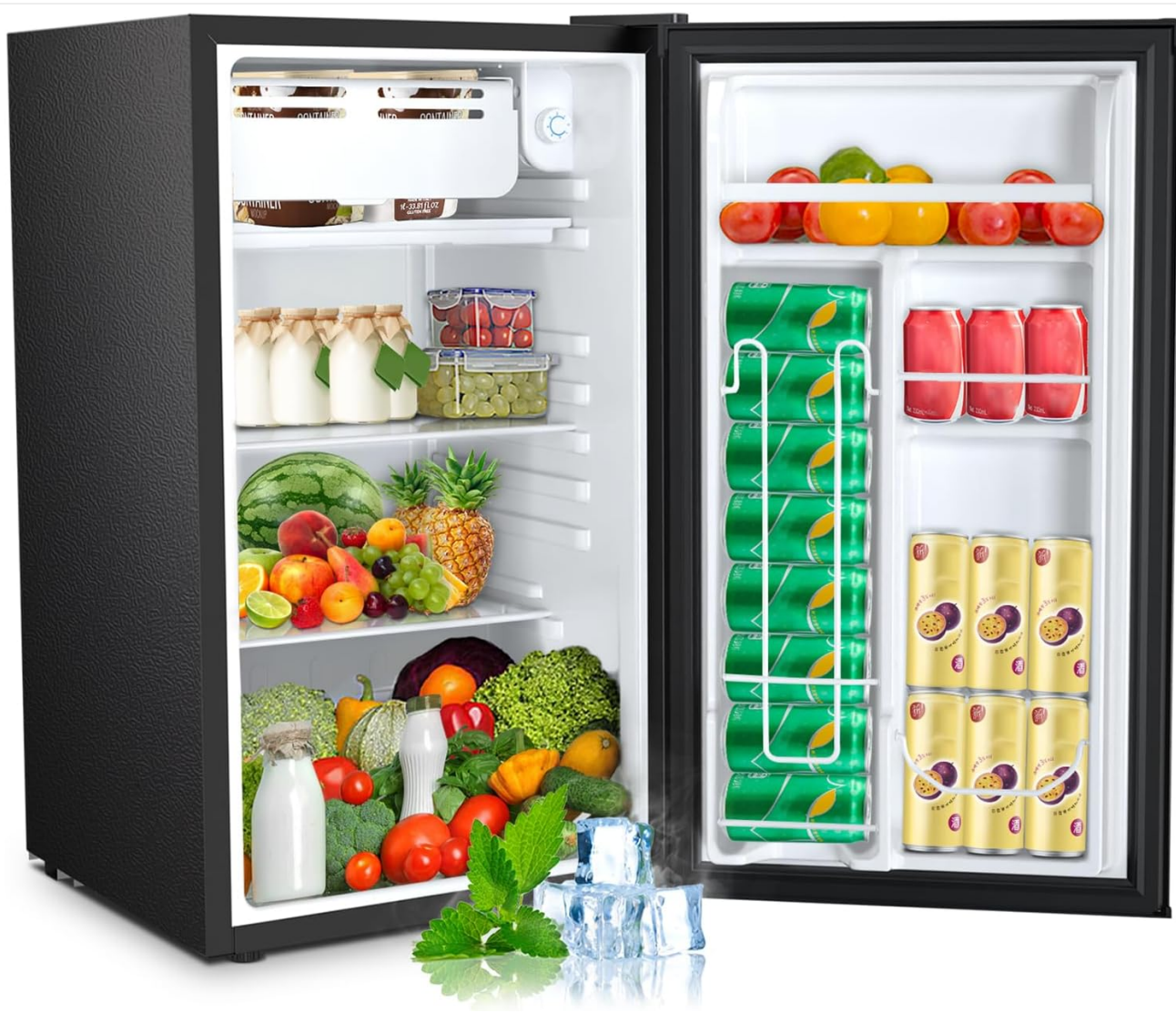
Image: Front view of the Electactic 3.2 Cu.ft Mini Fridge with its door open, showcasing its interior filled with various food items and beverages.