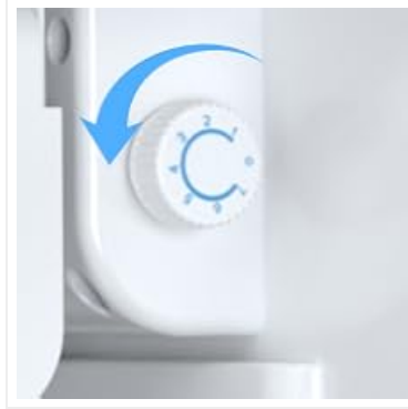
Image: A detailed view of the internal rotary thermostat knob, showing temperature settings from 1 to 7.

settings. The freezer compartment has a temperature range of 30°F to 48°F (-1°C to 8°C). The main fridge compartment offers 7 variable temperature settings to suit your cooling needs. Turn the knob to a higher number for colder temperatures and a lower number for warmer temperatures.