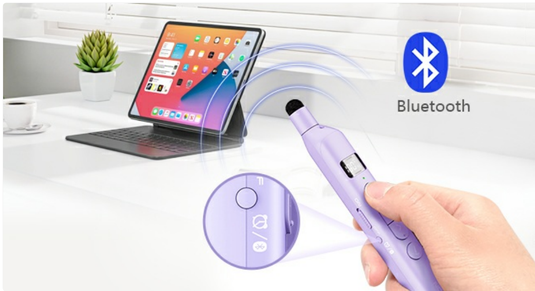
Figure 1: Overview of Norwii N21's six-in-one functionality.