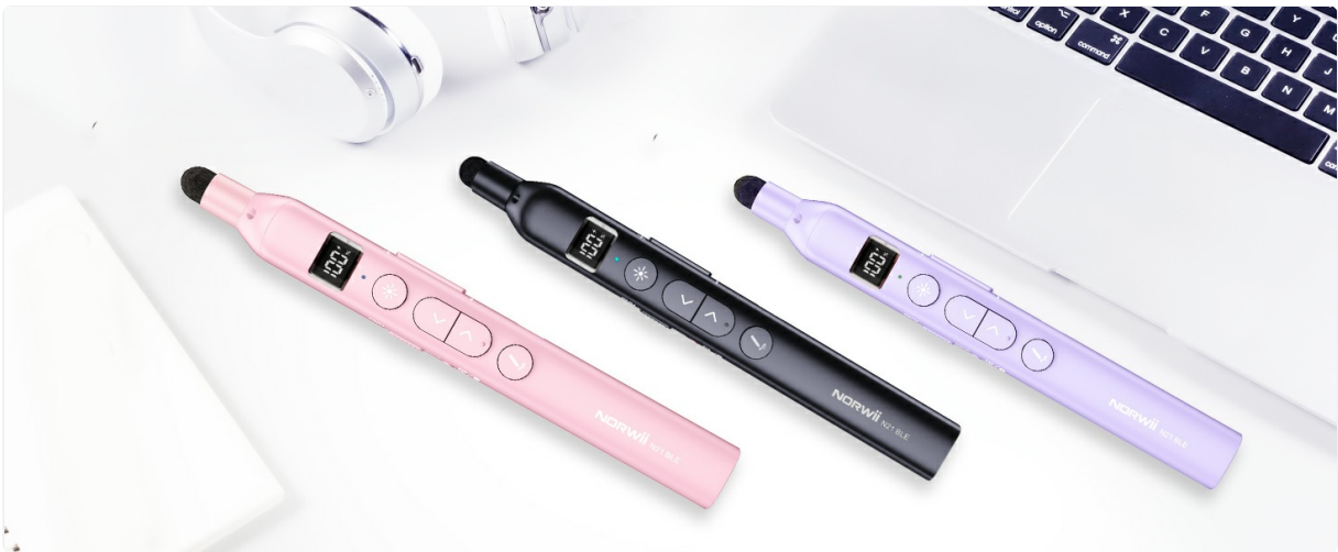
Figure 10: Broad compatibility with various operating systems.