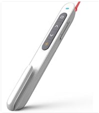
Figure 9: Customizing buttons via Norwii Presenter software.

The Norwii N21 is compatible with a wide range of devices and operating systems: