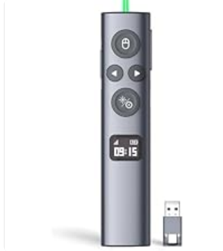
Figure 4: Connecting via USB-A receiver.