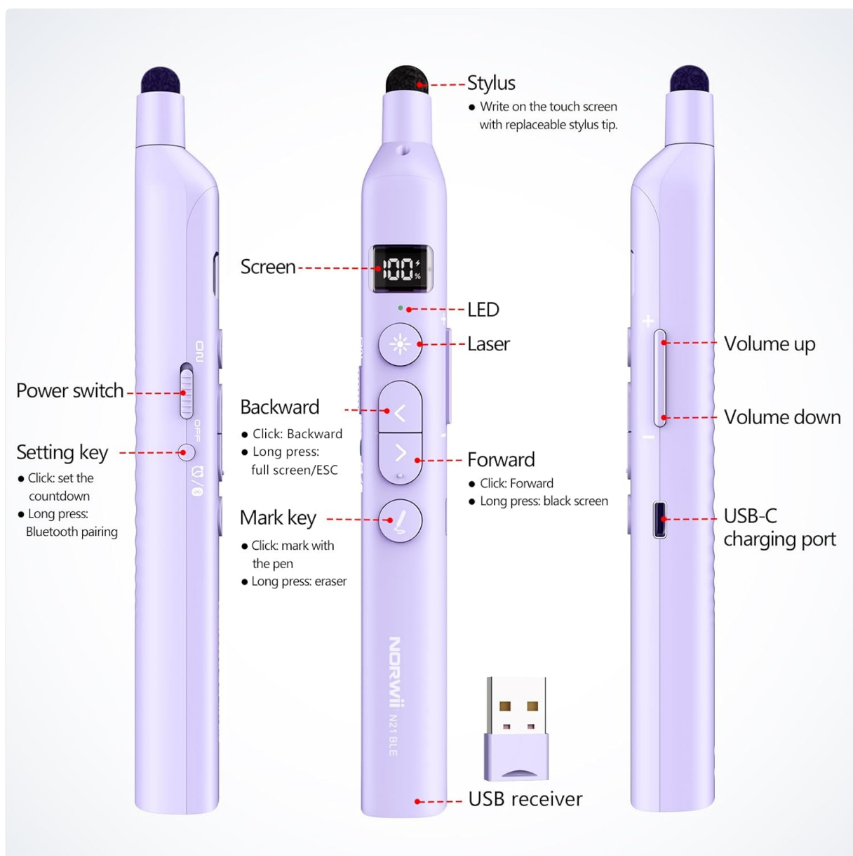
Figure 5: Norwii N21 button layout and functions.