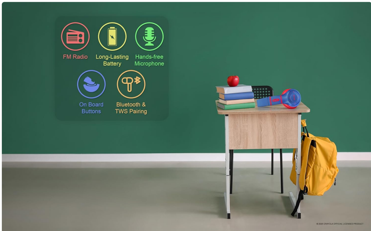
Image: Overview of headphone features including FM Radio, long-lasting battery, hands-free microphone, on-board buttons, and Bluetooth connectivity.

equipped with 40mm drivers for clear sound, a hands-free microphone for calls and online learning, and an adjustable, lightweight design for comfort.