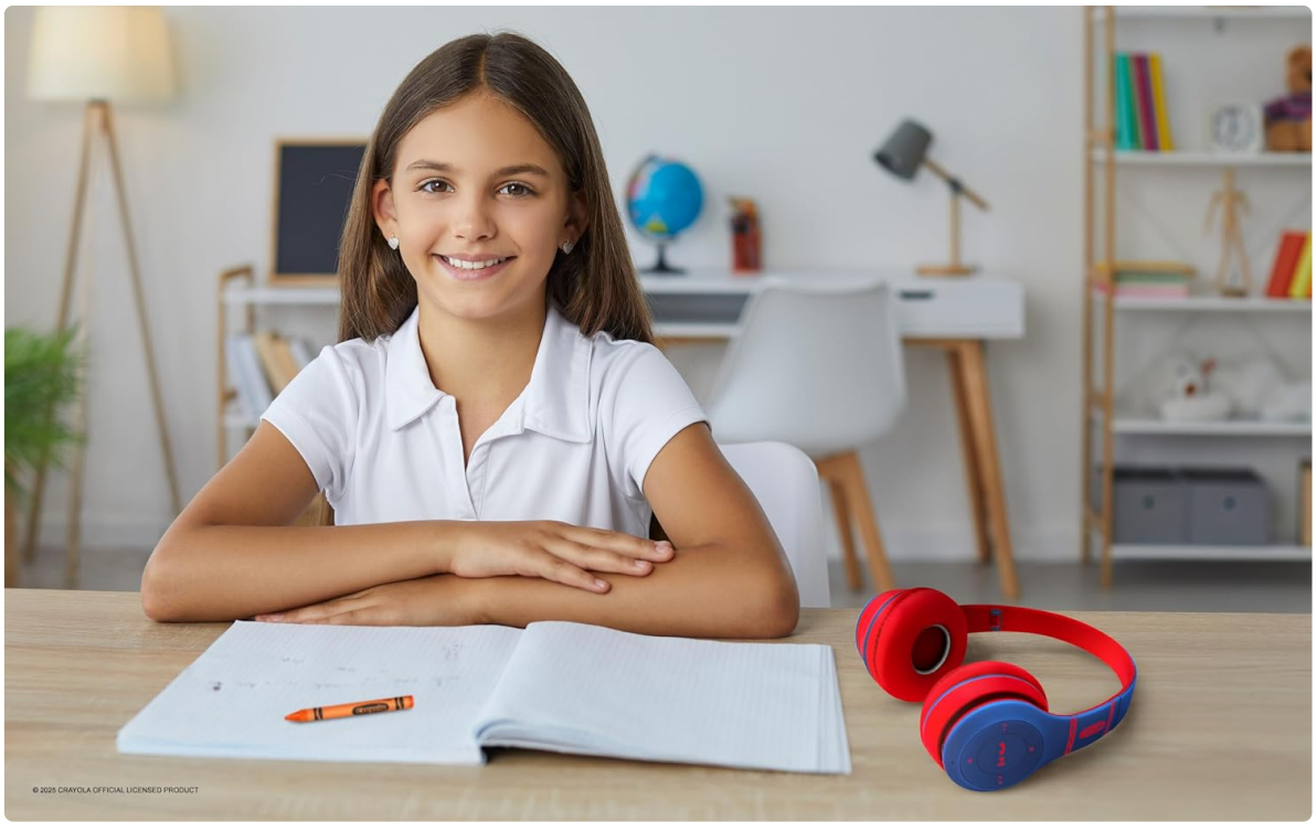
Image: A young girl sitting at a desk with the blue Crayola headphones next to her notebook, ready for learning or entertainment.