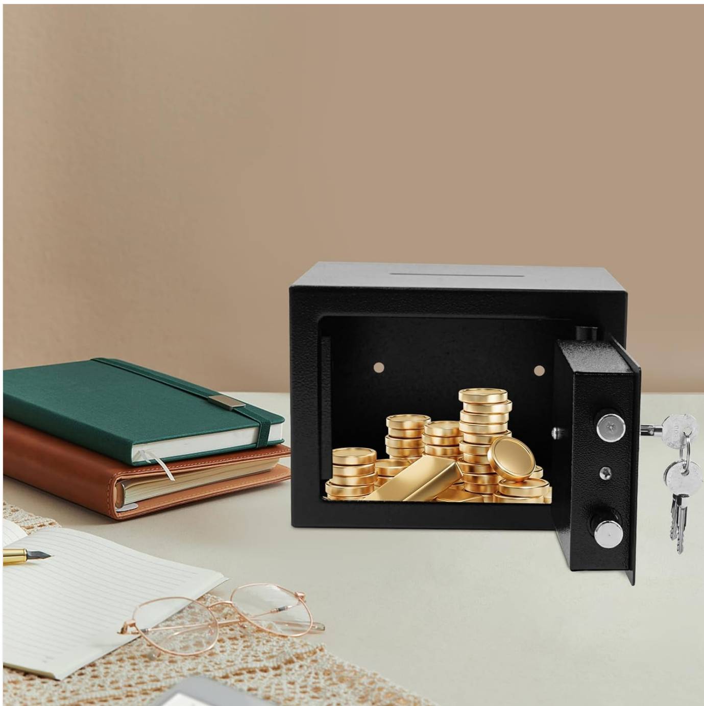
Image: The LIKARVA Mini Safe Box open on a desk, revealing its interior with gold coins, alongside notebooks and glasses.