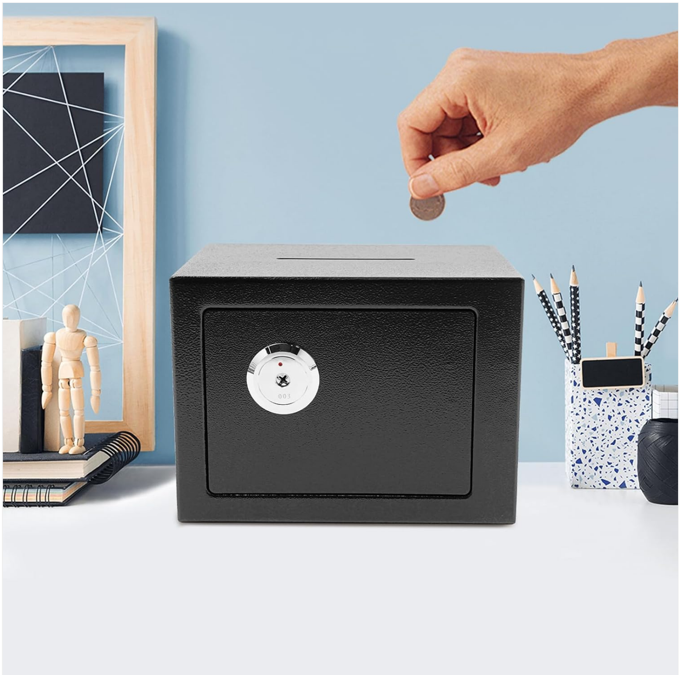
Image: A hand dropping a coin into the top slot of the LIKARVA Mini Safe Box, illustrating the coin-operated feature.