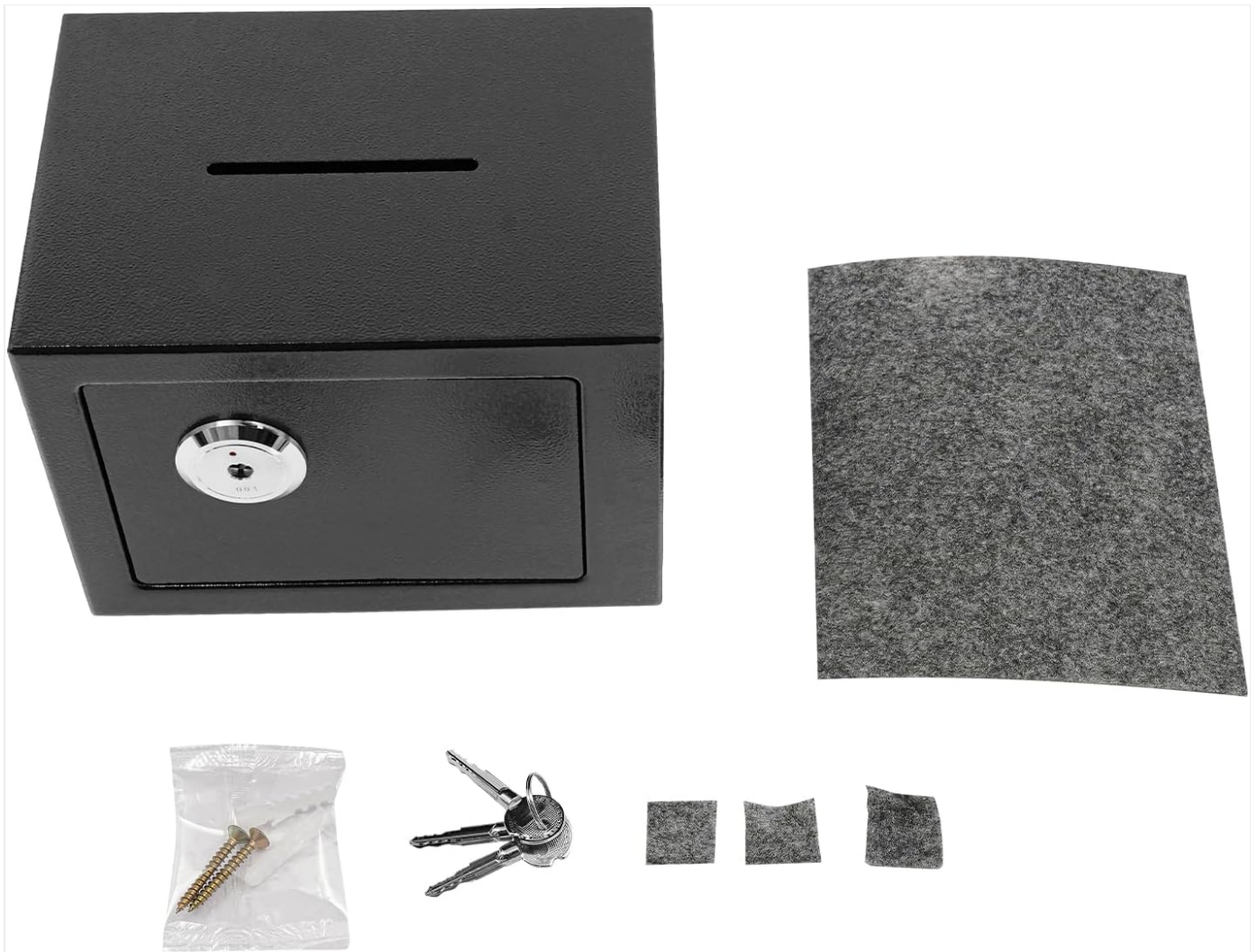
Image: The LIKARVA Mini Safe Box displayed with its included accessories, including three mechanical keys, mounting hardware, and a protective mat.