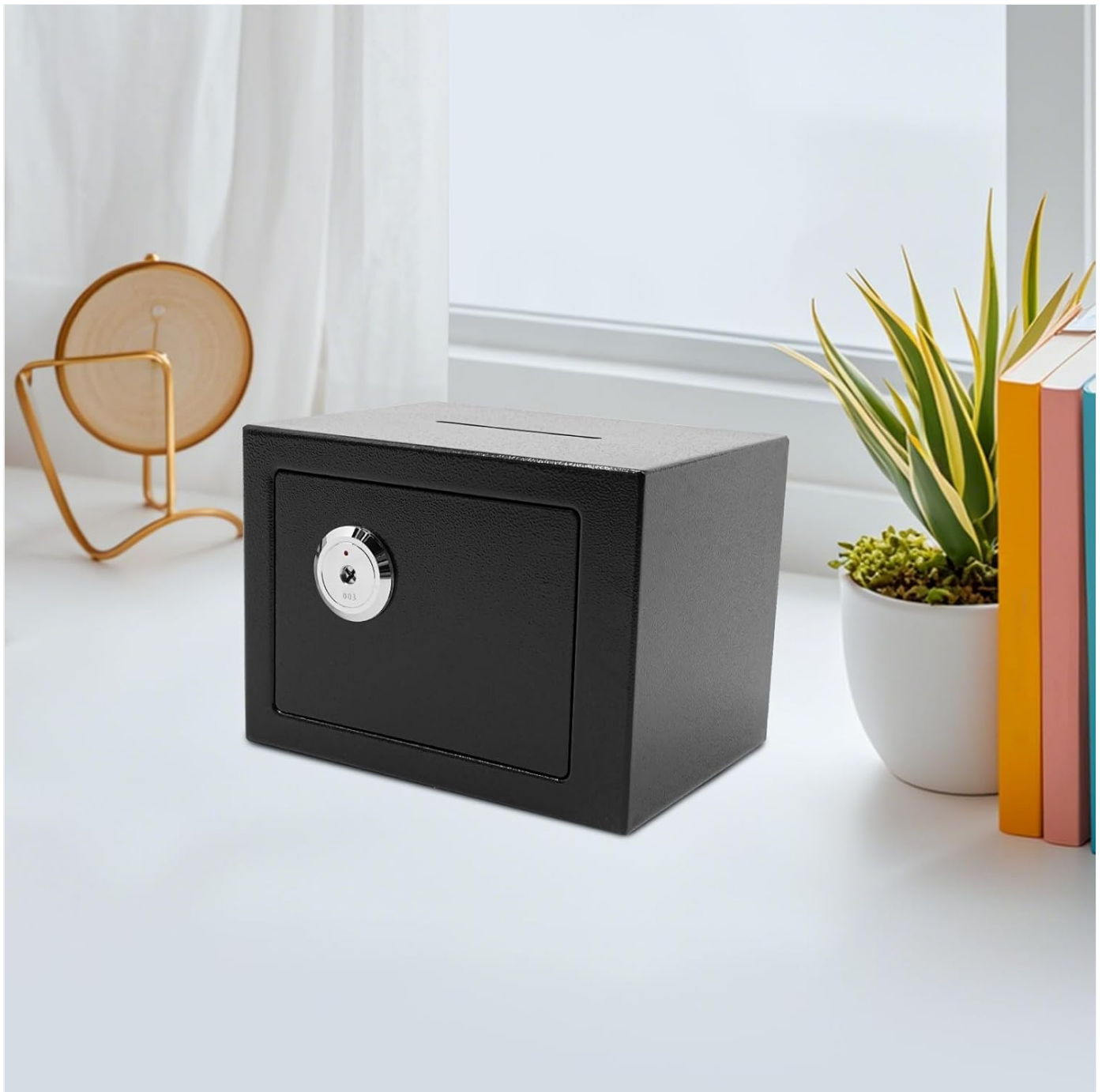
Image: The LIKARVA Mini Safe Box positioned on a desk next to a window, demonstrating its compact size for free-standing use.