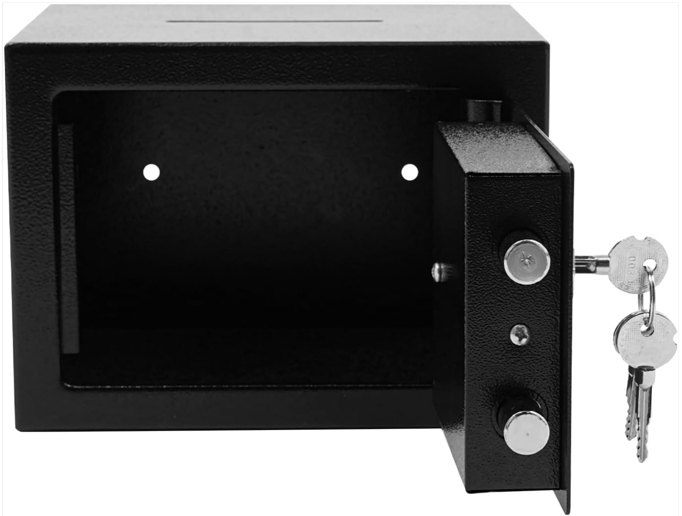
Image: An interior view of the LIKARVA Mini Safe Box, highlighting the pre-drilled mounting holes on the back panel for wall installation.