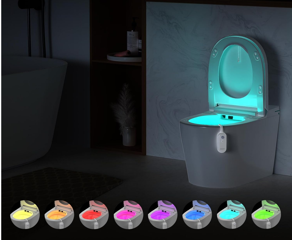
Image: The toilet light offers 8 distinct color options to suit personal preferences.

Adjust to suit your habits and preferences