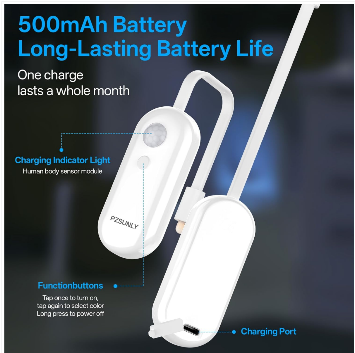
Image: Installation steps for the PZSUNLY SL-F27 Motion Sensor Toilet Light.