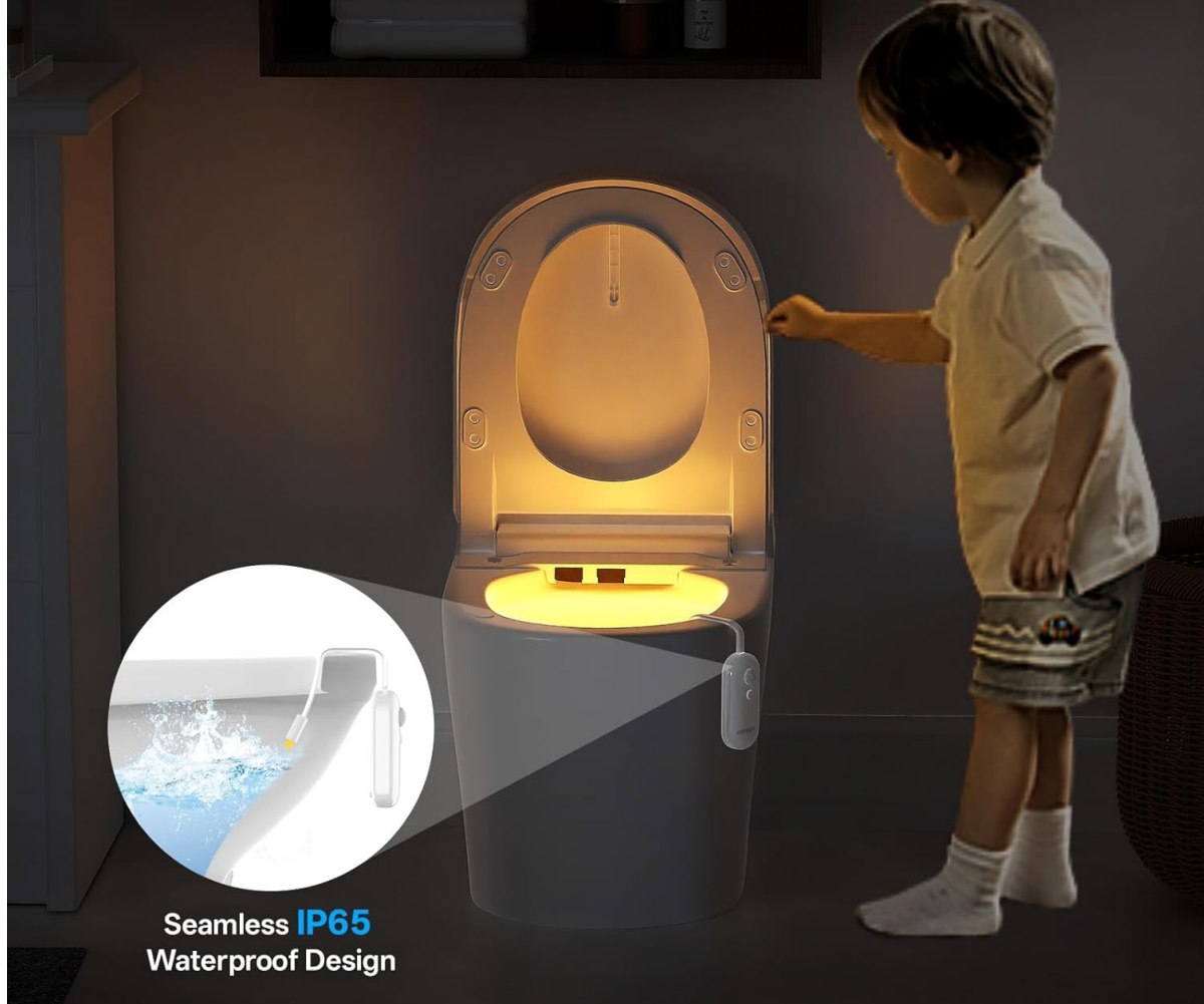
Image: The light automatically turns off during the day and turns on when motion is detected in the dark, turning off after 90 seconds of inactivity.

No More Blinding Lights or Midnight Bumps