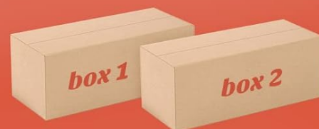
Figure 2: Delivery in two boxes. This image shows two cardboard boxes, labeled "box 1" and "box 2", indicating that the complete clothes rack system is shipped in two separate packages. It is important to receive both for full assembly.

The Clothes Rack will be delivered in 2 boxes and you may receive them at different time.