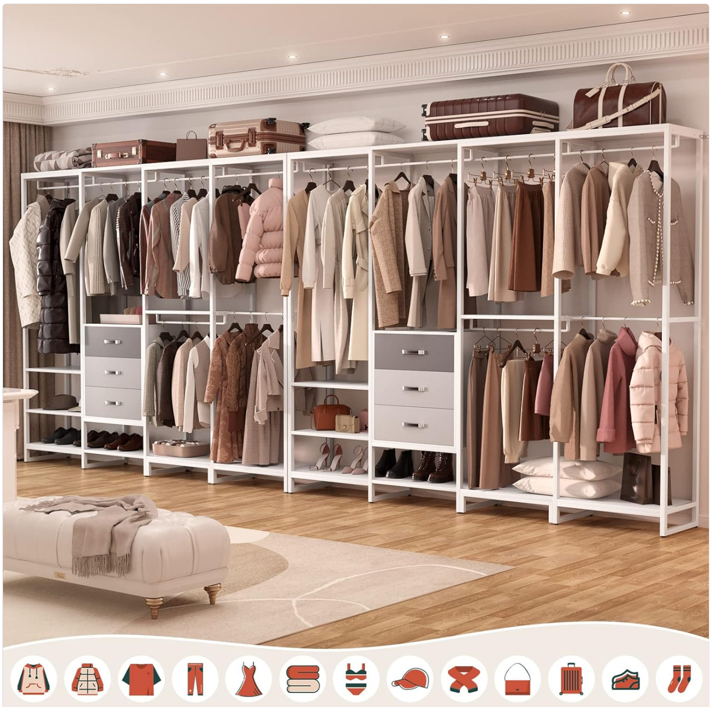
Figure 5: Detailed features. This close-up view emphasizes key features of the closet system, including the spacious wooden drawers, the robust thickened hanging rods, and the versatile storage shelves, demonstrating the quality of construction and design.