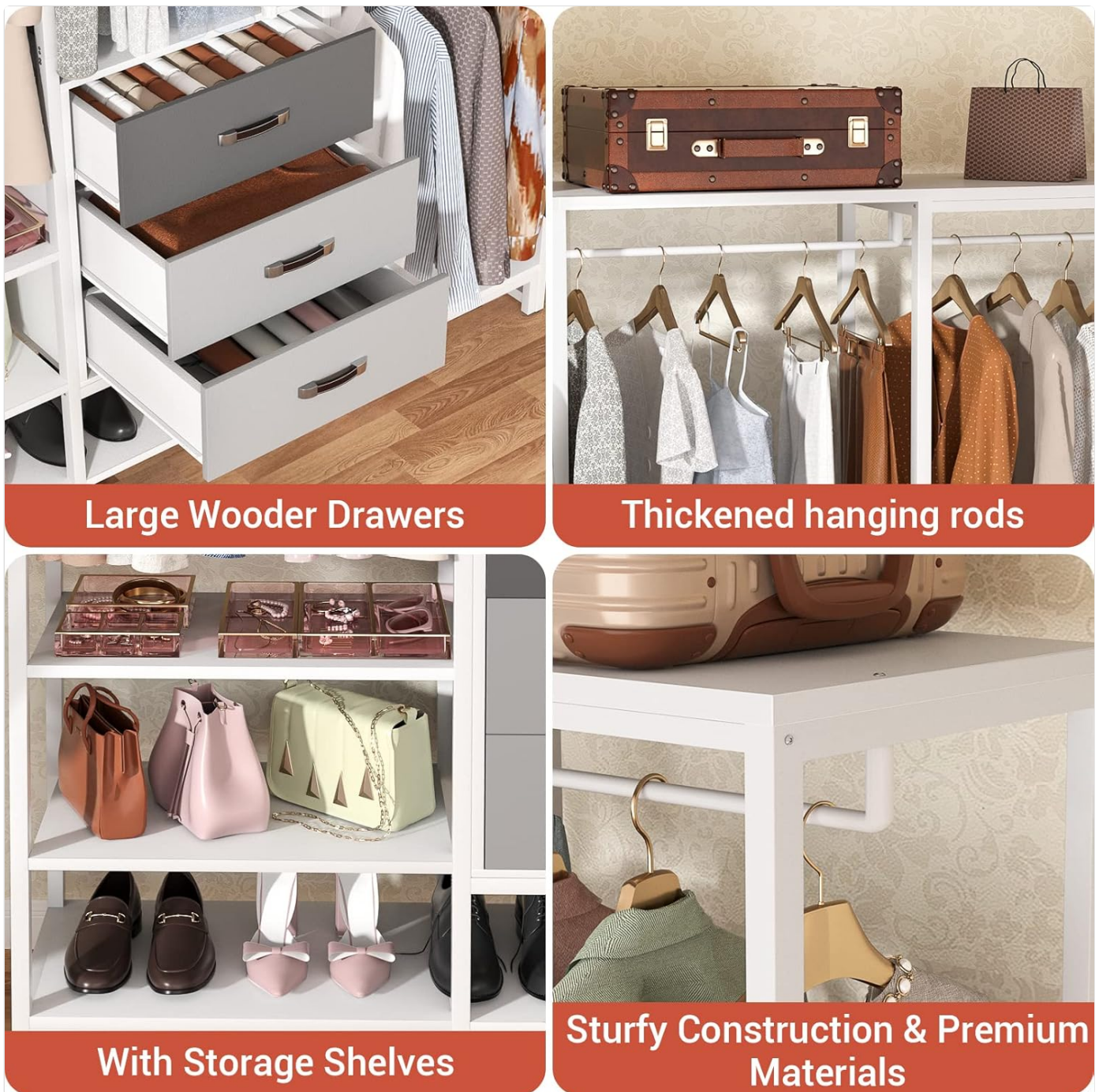
Large Wooder Drawers