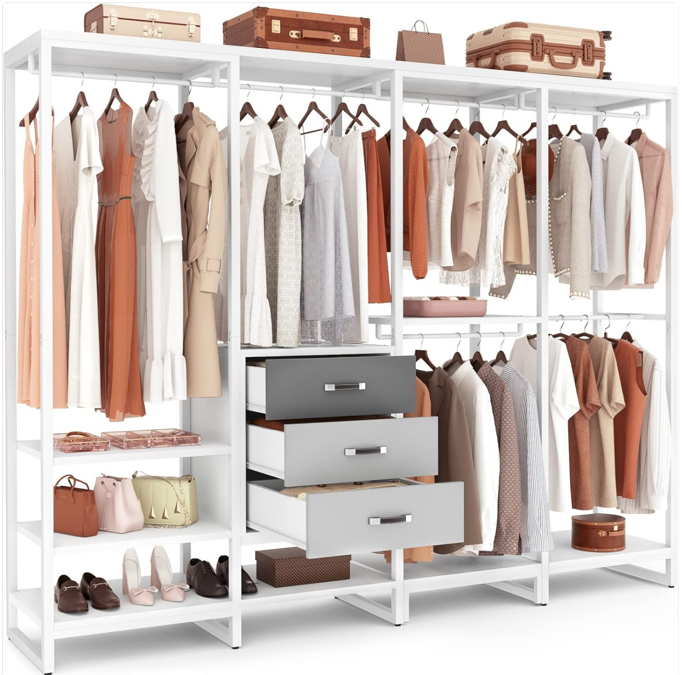
Figure 6: Aheaplus Wood Clothes Rack Wardrobe Closet System. This image displays the complete Aheaplus wardrobe closet system, showcasing its design and functionality when fully assembled and in use, filled with clothing and accessories.