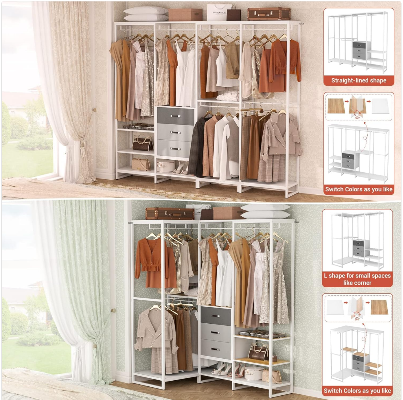
Figure 3: Configuration options. This image displays two primary ways to assemble the closet system: a straight-lined arrangement for larger spaces and an L-shaped configuration designed for corner placement, demonstrating its adaptability.