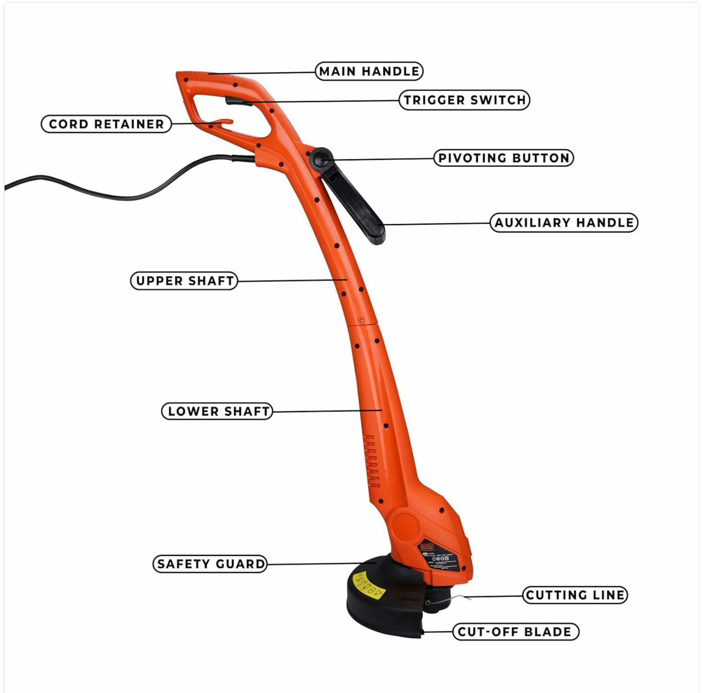
Image: Overview of the GL350L String Trimmer with key components labeled.

Familiarize yourself with the components of your BLACK+DECKER GL350L string trimmer before operation.