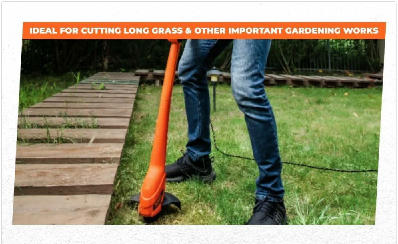
Image: A user demonstrating the use of the string trimmer for garden maintenance.