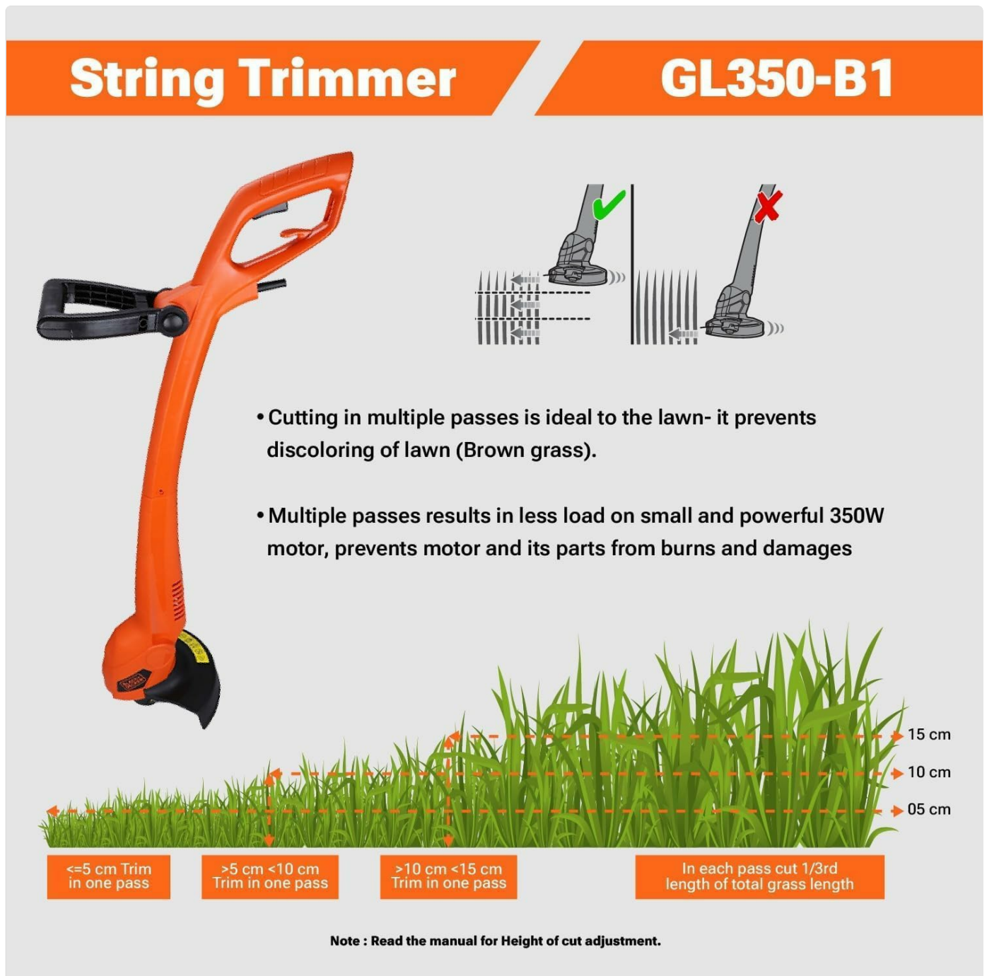
Image: Visual guide for effective grass trimming, emphasizing multiple passes and cutting height.