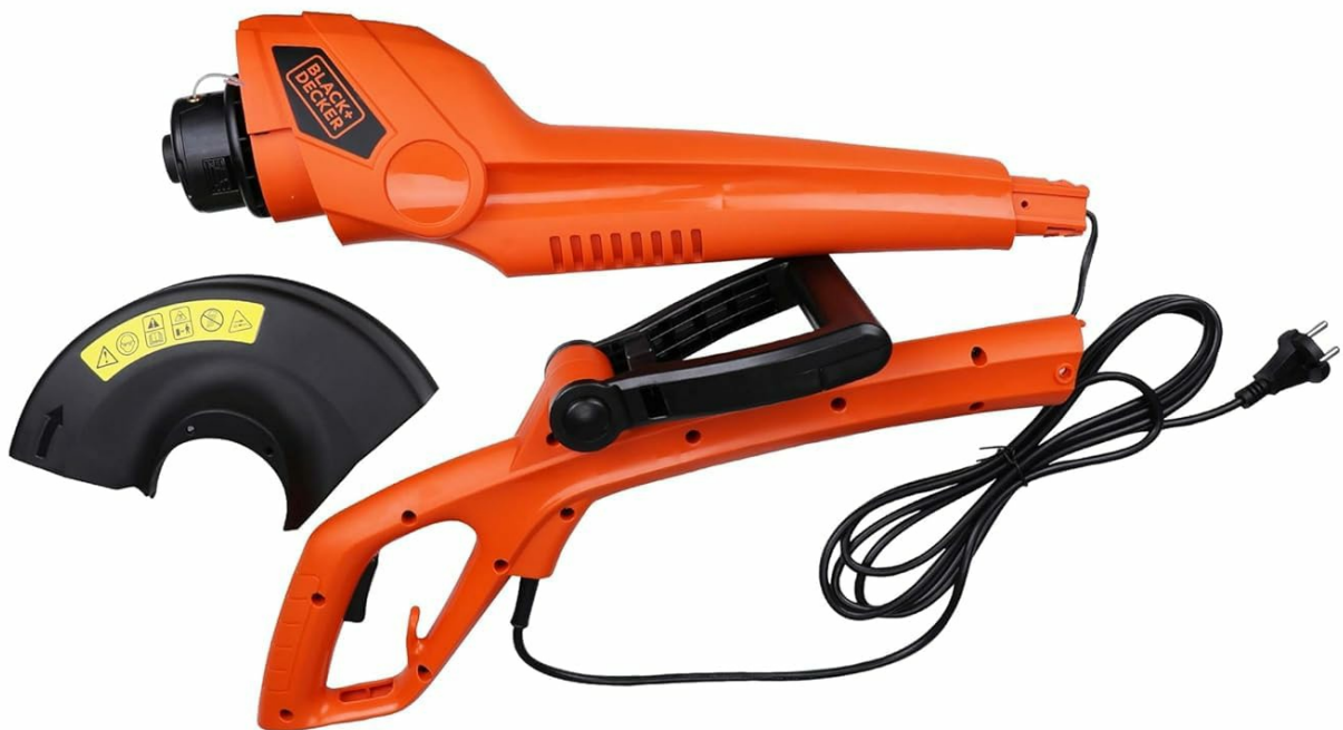
Image: Components of the GL350L String Trimmer before assembly, showing the safety guard.