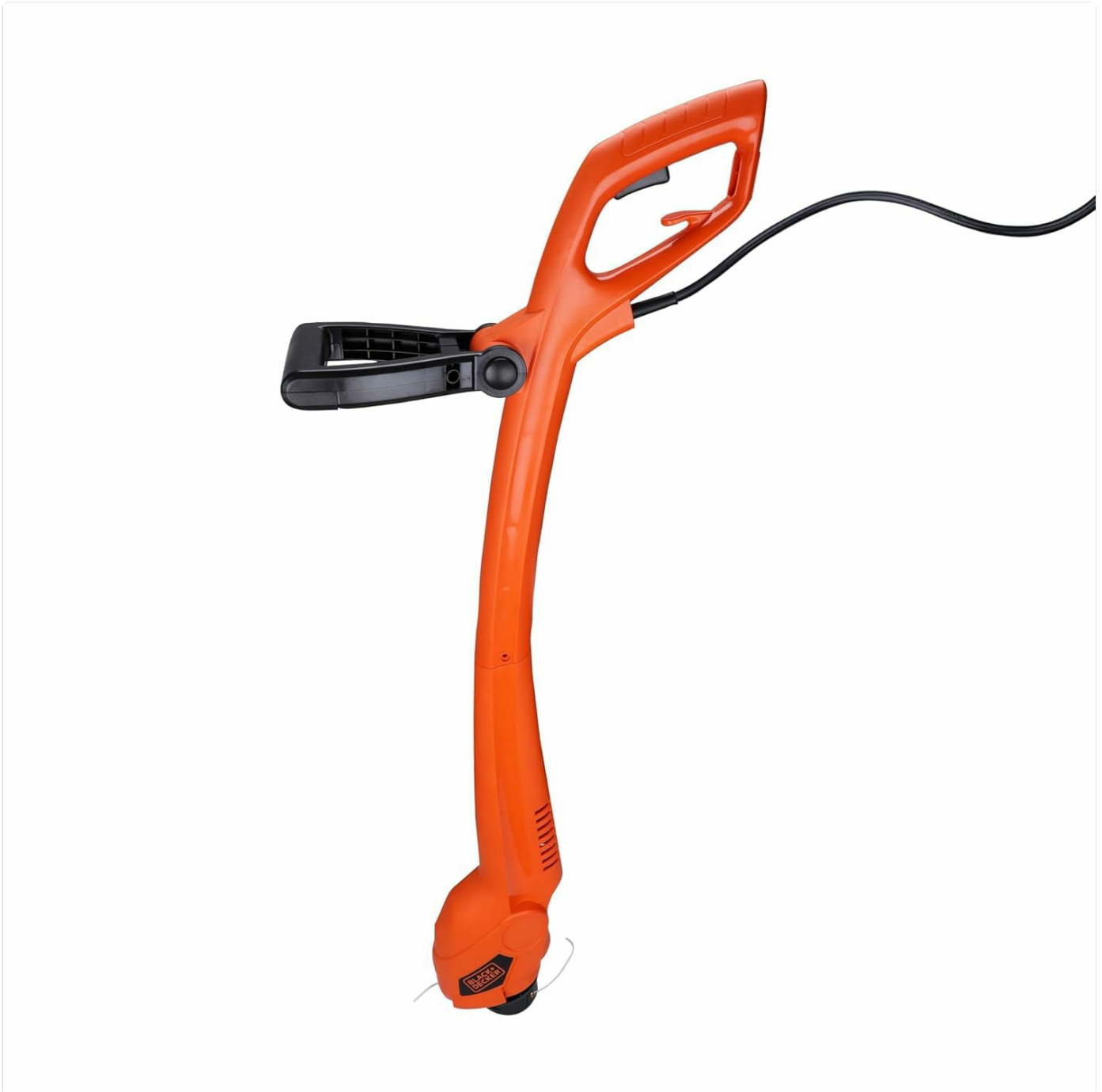
Image: Detail of the auxiliary handle attachment point.