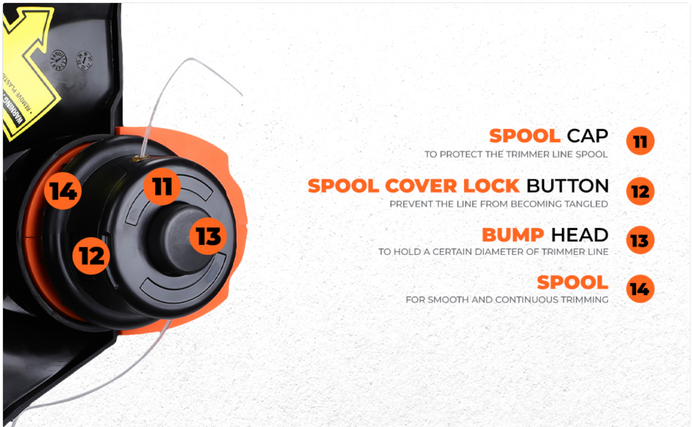
Image: Detailed view of the trimmer head components, including the spool and cap.