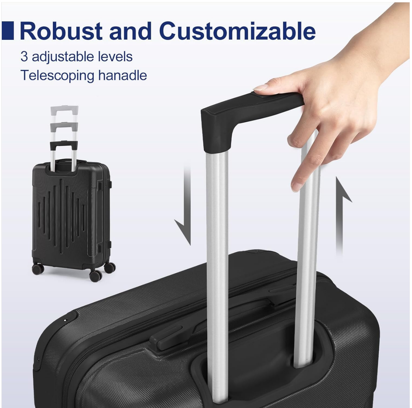
Image: Illustration of the telescoping handle, demonstrating its three adjustable levels for user comfort.