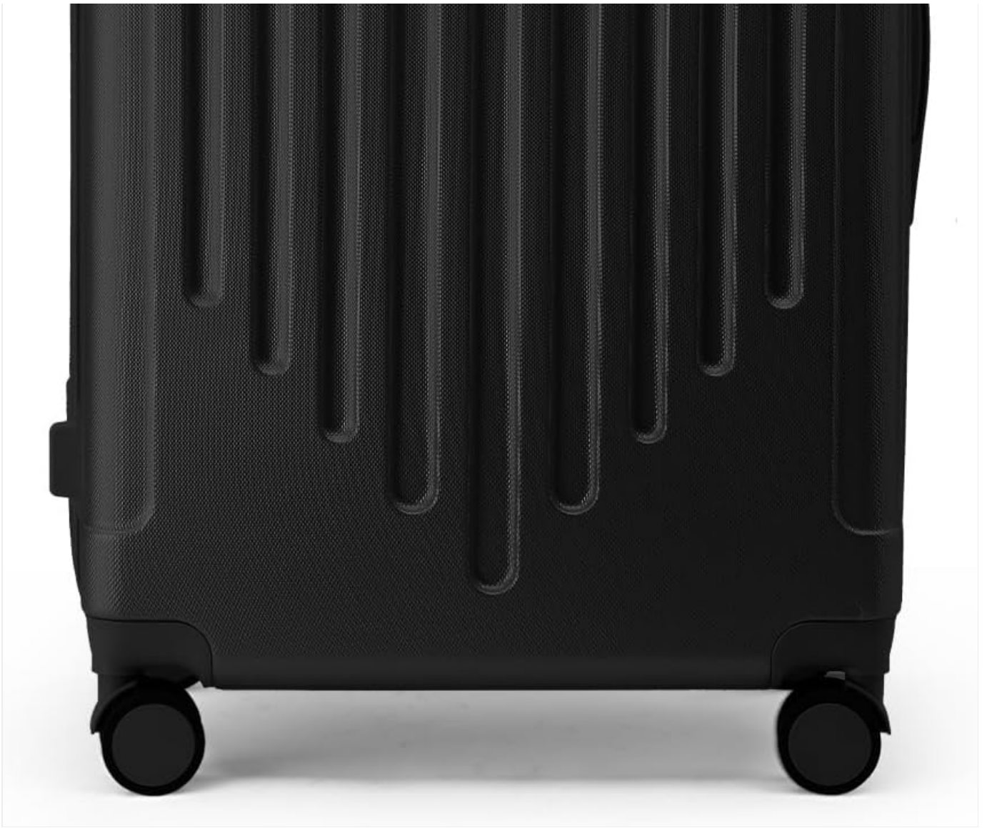
Image: Front view of the Karl home Hardside 21 Inch Carry On Luggage in black, showcasing its textured hardshell design and spinner wheels.