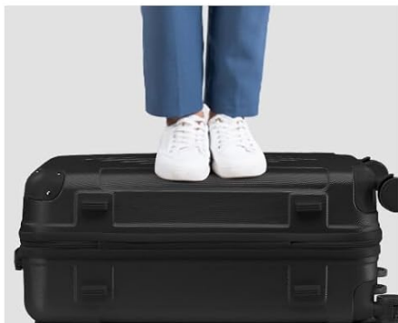
Strong load-bearing capacity