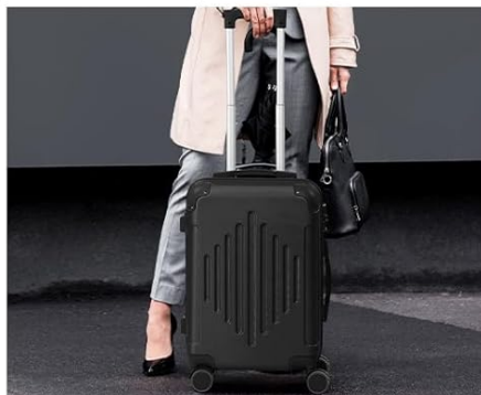
Exquisite and elegant appearance