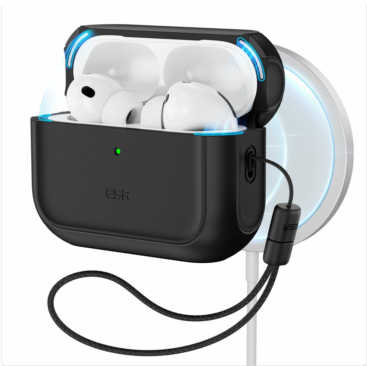
The ESR AirPods Pro 3 Case, designed for protection and convenience.