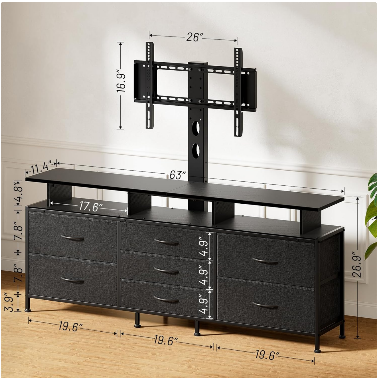
Image: Overall dimensions of the TV stand, including height, width, and depth, with specific measurements for shelves and drawers.