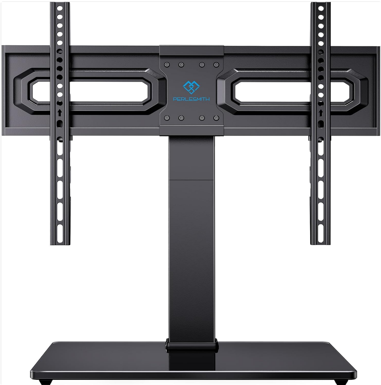
Image: Components of the PERLESMITH PSTVS35 TV Stand, featuring a wider TV bracket for larger screens.