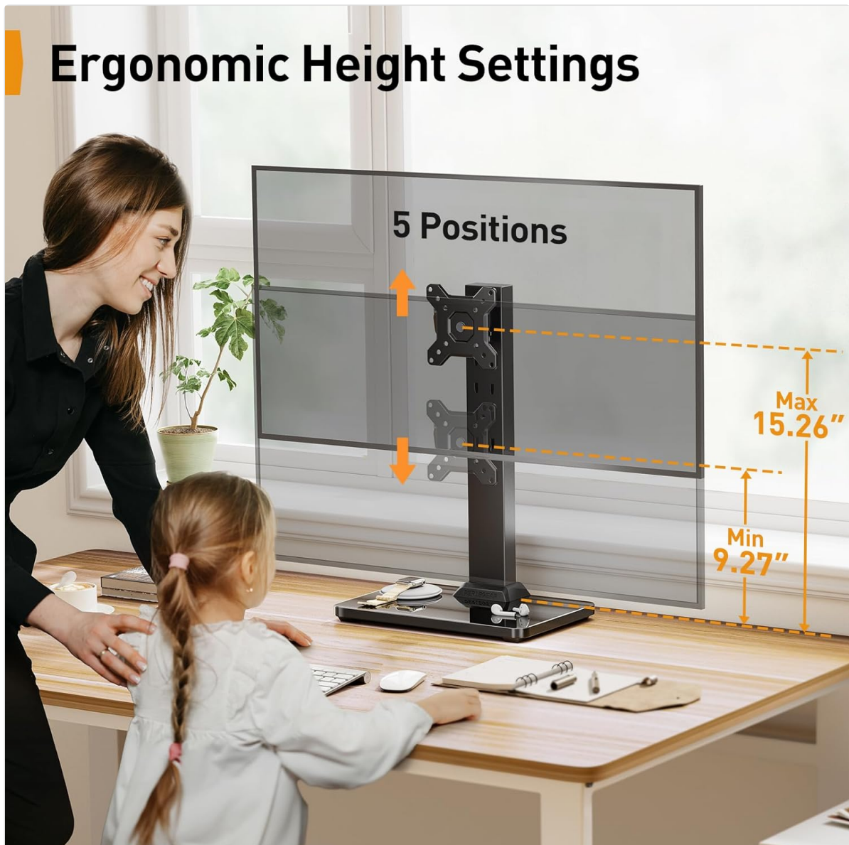
Image: Illustration of the PGTVS29 Monitor Stand's 5 ergonomic height adjustment positions.