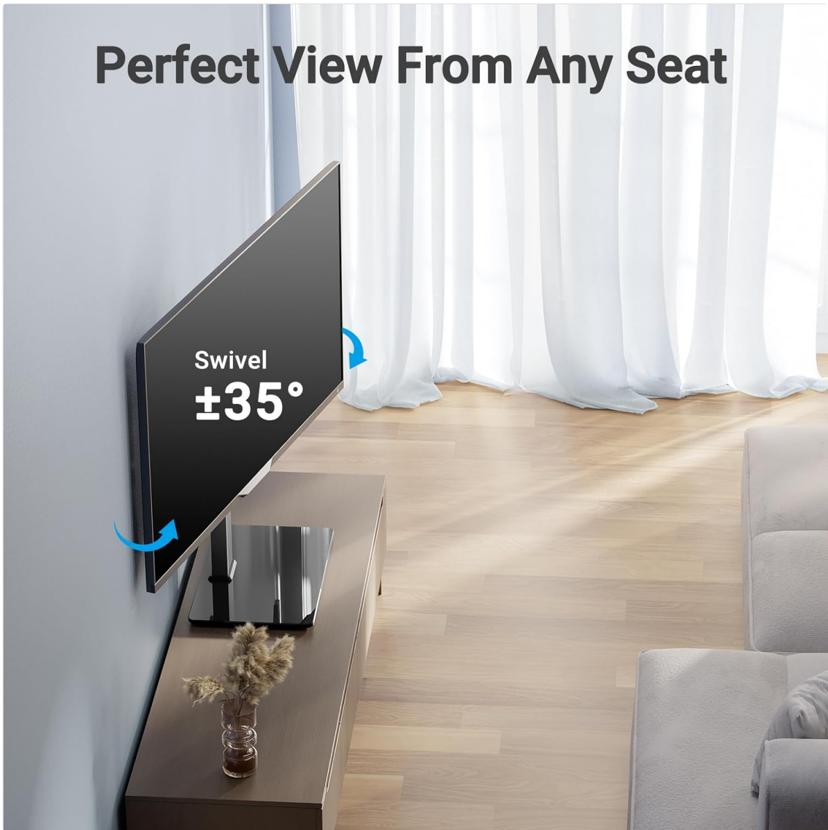
Image: Demonstrates the \pm 35^\circ swivel capability of the PSTVS35 TV Stand for optimal viewing from various positions.