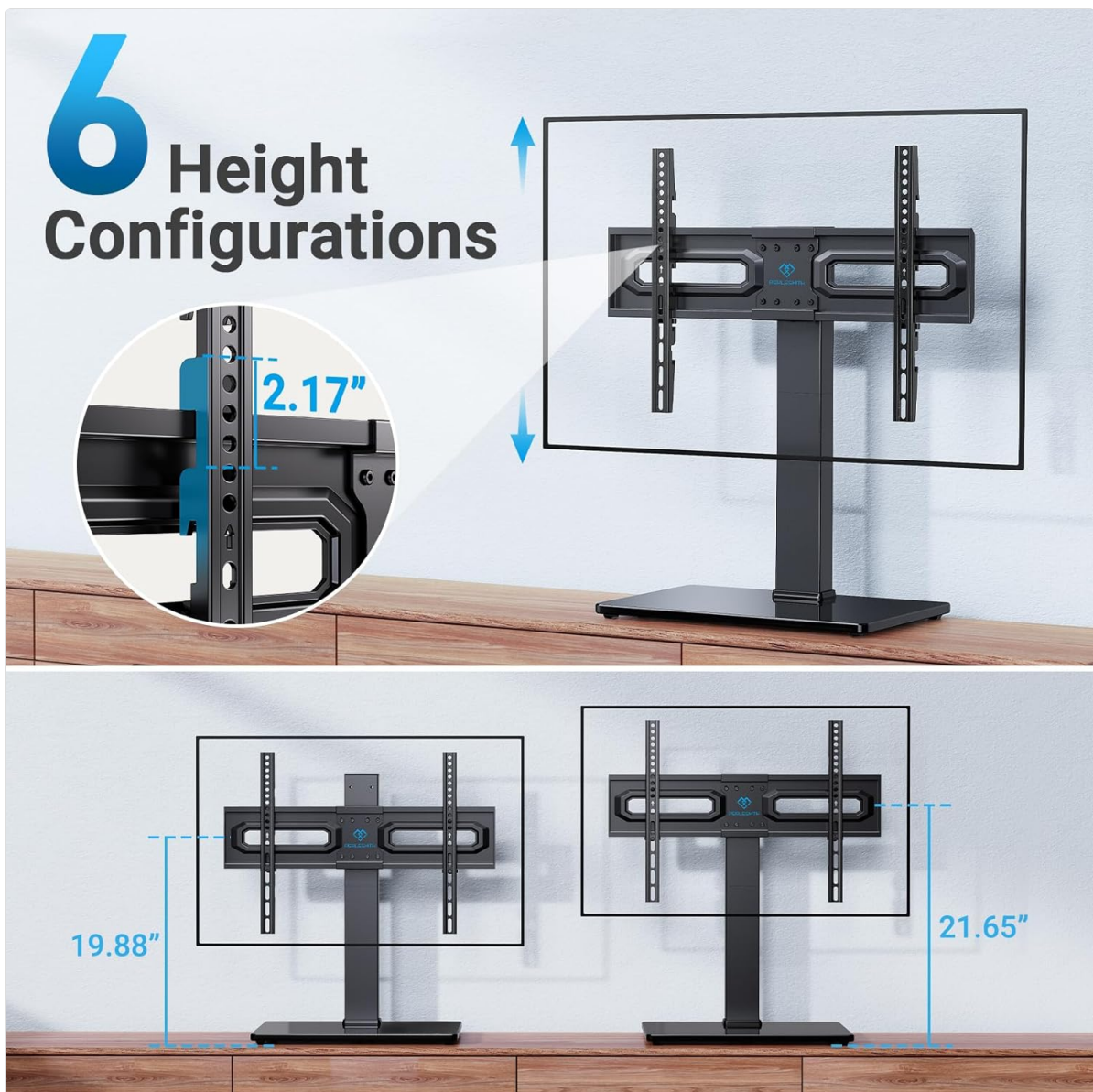
Image: Illustrates the 6 different height configurations available for the PSTVS35 TV Stand.