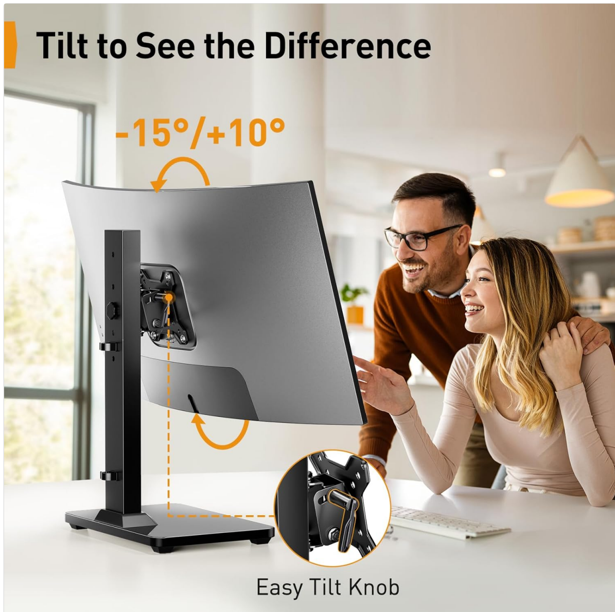
Image: Demonstrates the -15^{\circ} to +10^{\circ} tilt range of the PGTVS29 Monitor Stand, highlighting the easy tilt knob.