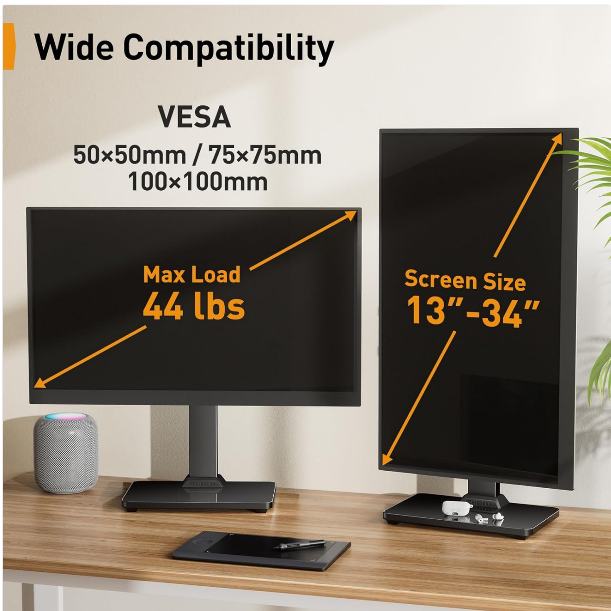
Image: Specifications for the PGTVS29 Monitor Stand, including VESA patterns, max load, and screen size range.