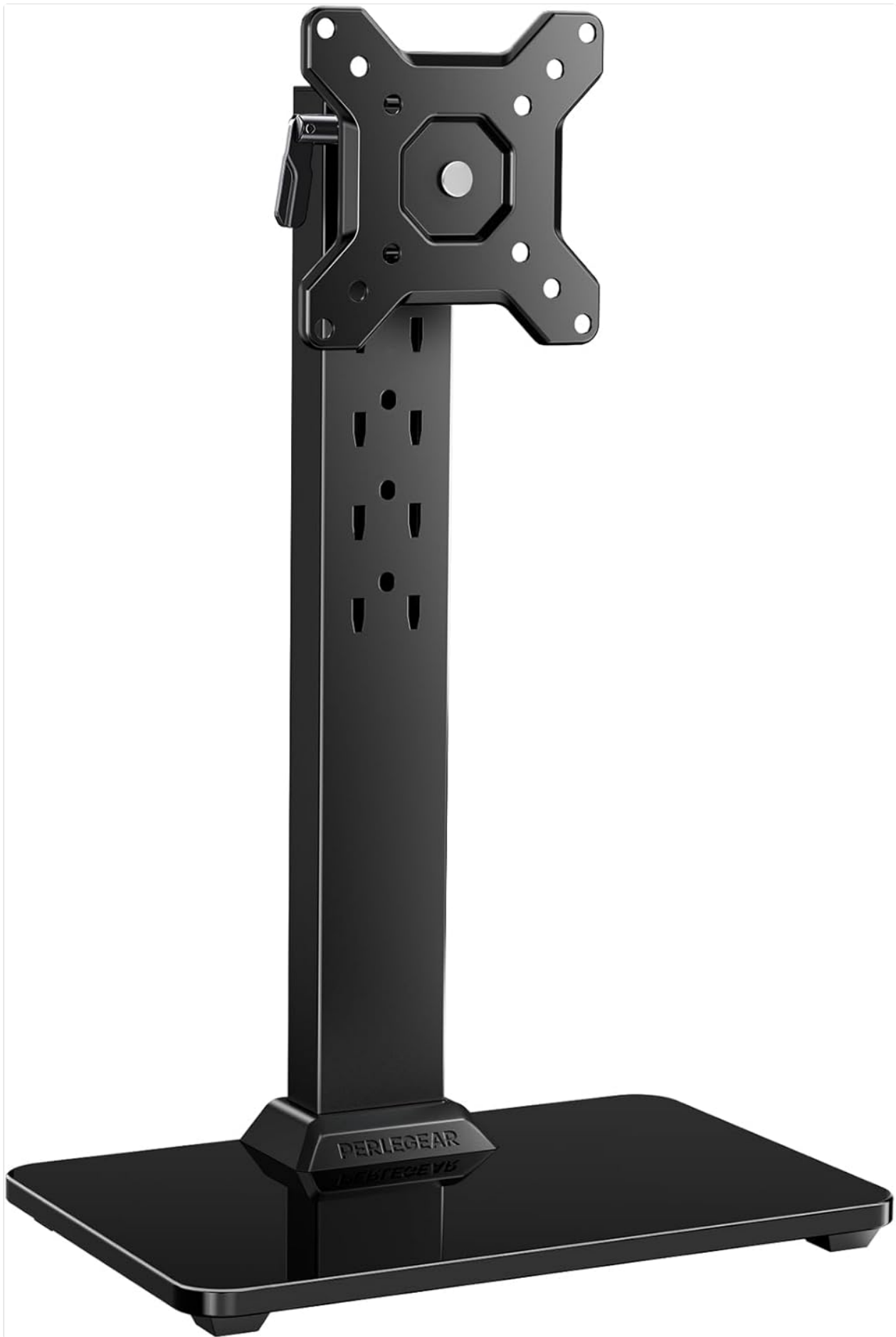
Image: Components of the PERLESMITH PGTVS29 Monitor Stand, showing the base, column, and VESA mounting plate.