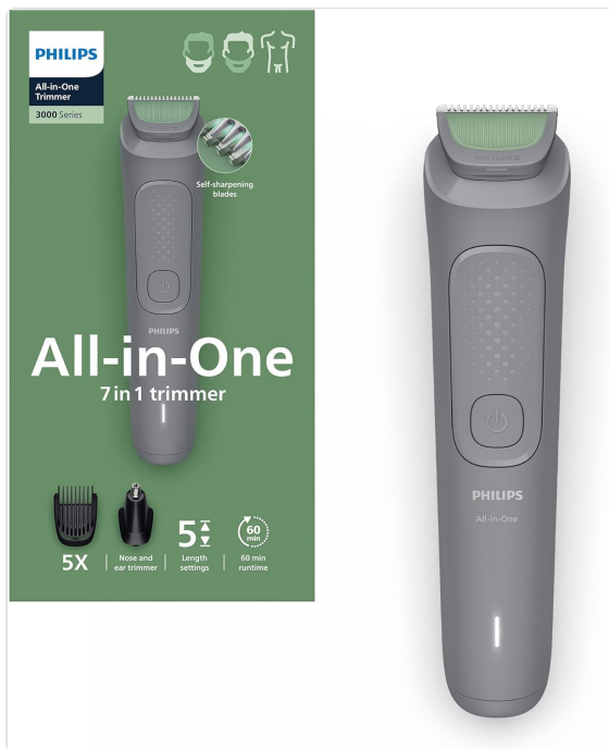
Figure 3.1: Philips MG3911/15 Trimmer and its retail packaging.