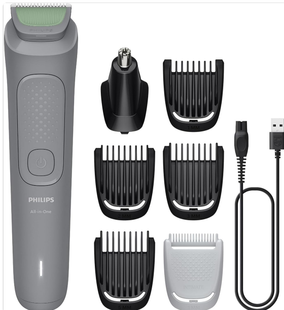
Figure 3.2: All included components: the trimmer handle, various trimming combs (1mm, 3mm, 5mm), a nose and ear trimmer attachment, an intimate area comb, and a USB charging cable.