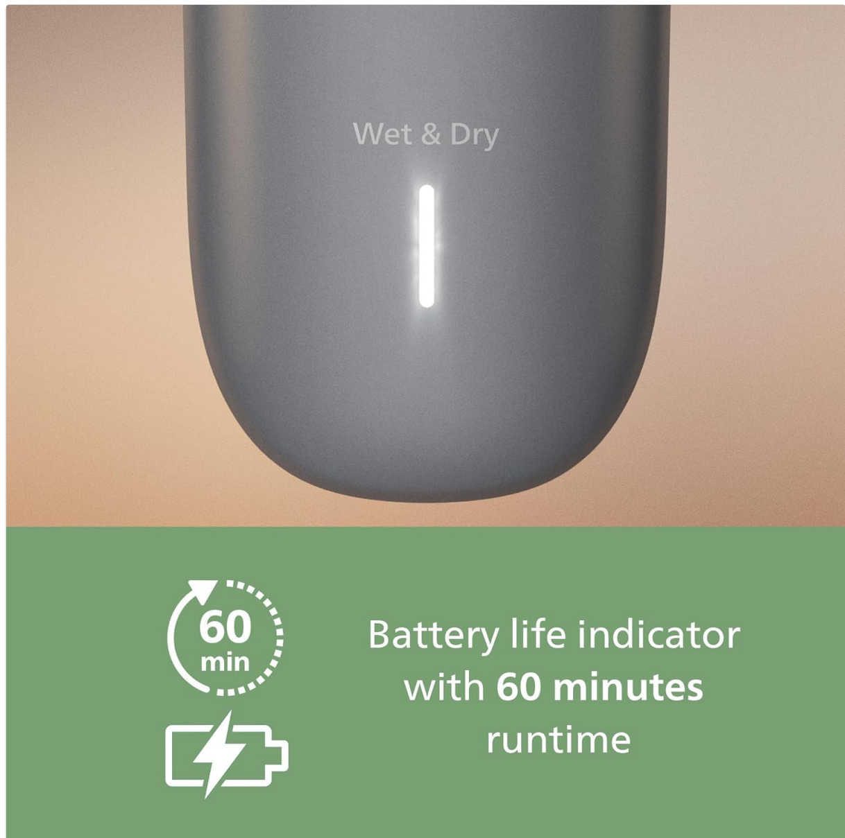
Figure 4.1: The battery life indicator on the trimmer, showing approximately 60 minutes of runtime on a full charge.