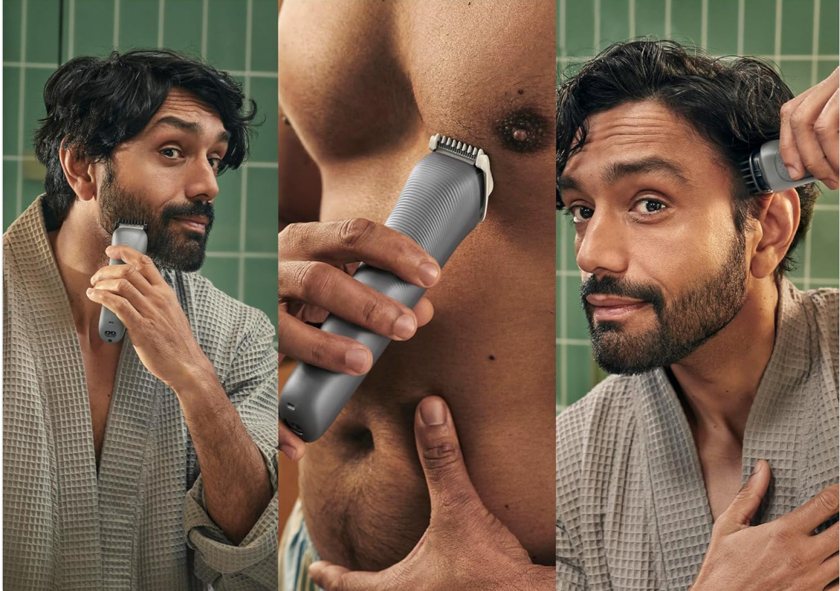
Figure 5.3: Detailed view of the self-sharpening steel blades, which maintain their sharpness over time without requiring oiling.