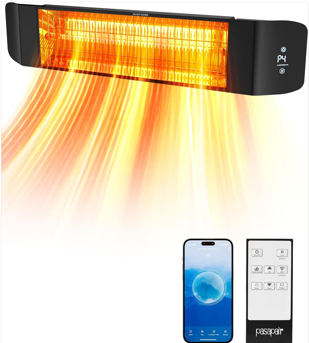
Image 2.1: Pasapair Electric Patio Heater with included remote control and a smartphone displaying the control app.