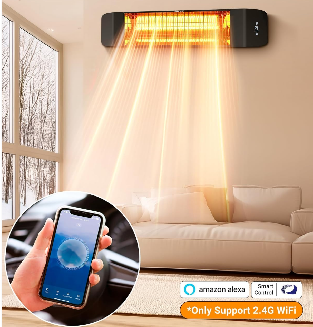
Image 4.1: Remote control of the heater via the Smart Life app, allowing pre-heating before arrival.

Turn on the heater before arriving home.