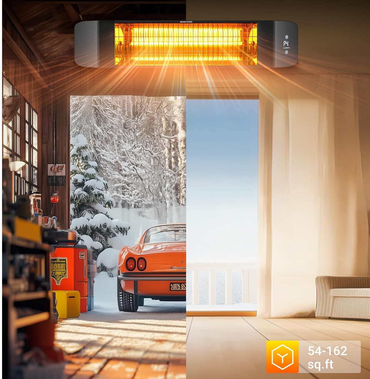
Image 4.4: The heater effectively distributing heat in a garage environment, suitable for spaces up to 162 sq. ft.

If your garage space is larger and the ambient temperature is lower we recommend that you buy more than one.