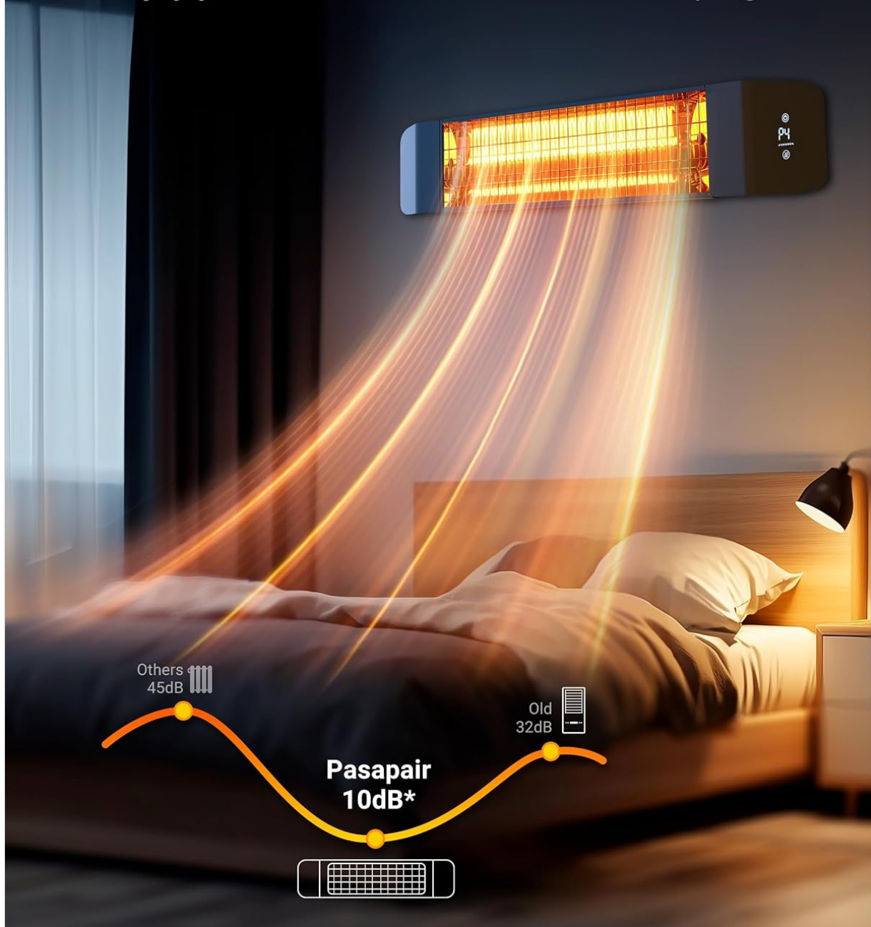
Image 4.3: The heater providing quiet warmth in a bedroom setting, ensuring comfortable sleep.

Enjoy your warm and comfortable sleeping.