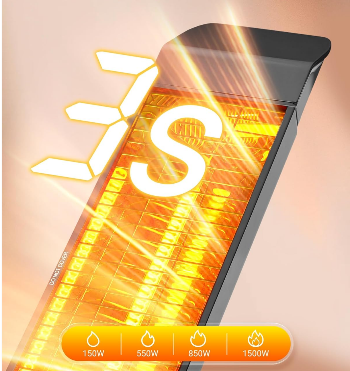
Image 2.2: Detail of the heater highlighting its 3-second fast heating capability and four distinct power settings.