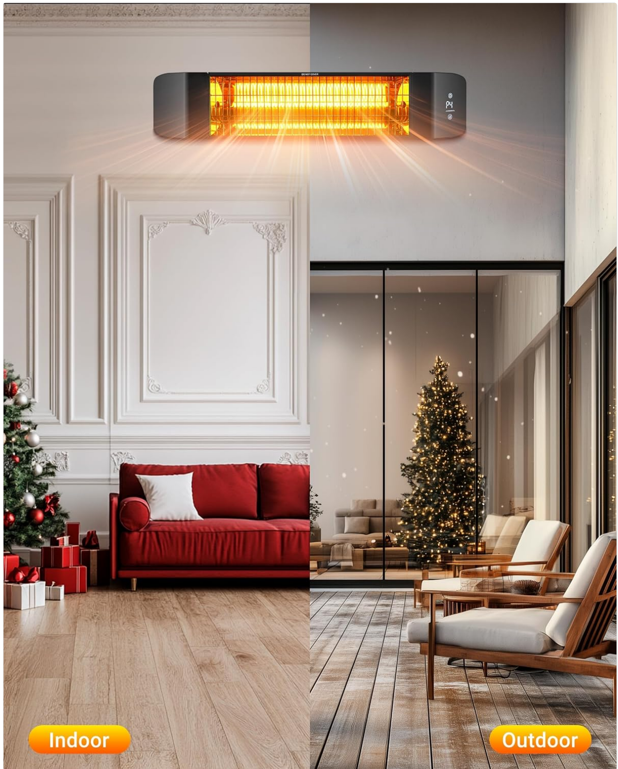
Image 4.2: The heater's versatility for both indoor living spaces and outdoor patio areas.