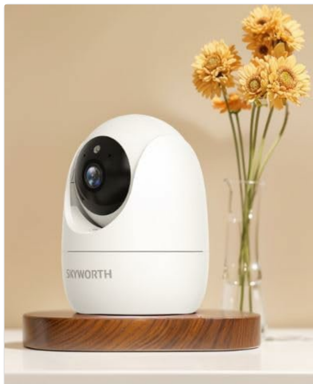
Figure 1: Skyworth H30P Smart Wi-Fi Camera

Thank you for choosing the Skyworth H30P Smart 360° Pan & Tilt Indoor Wi-Fi Security Camera. This camera is designed to provide comprehensive surveillance for your indoor spaces, offering advanced features like 360° pan and tilt, two-way audio, and remote viewing via a mobile app. Please read this manual carefully before use to ensure proper installation and operation.