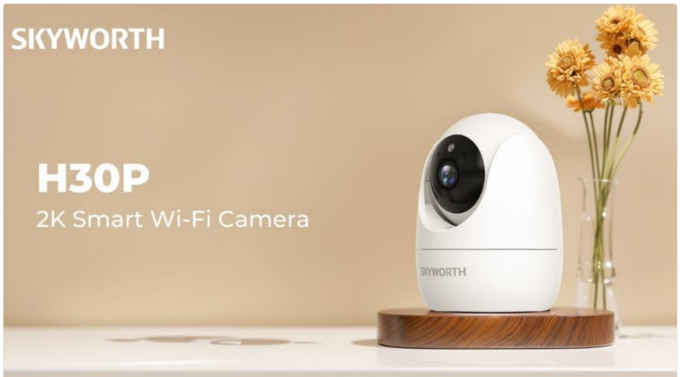
Figure 3: Illustrates Wi-Fi connectivity and remote control via mobile app.

This image shows the camera's wireless connectivity and how it can be controlled and monitored remotely using a smartphone application.