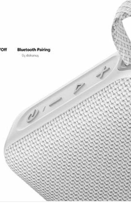
Image: QCY SP2 speaker, charging cable, and manual.