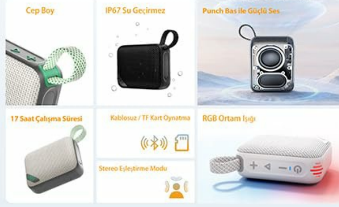
Image: Front view of the QCY SP2 speaker.