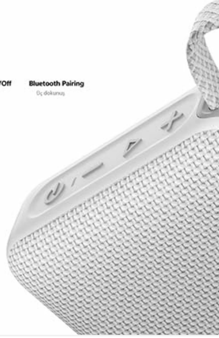
Image: Technical data and dimensions of the QCY SP2 speaker.