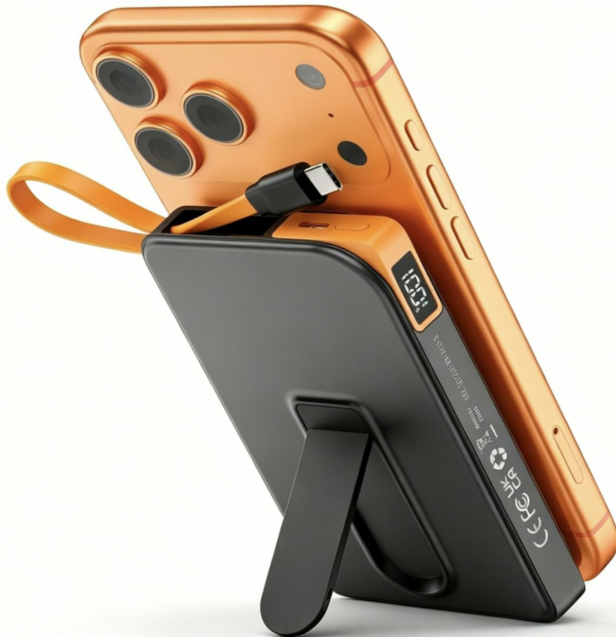
Image: The Ntaanoo MP51 3-in-1 Magnetic Power Bank, highlighting its sleek and portable form factor.