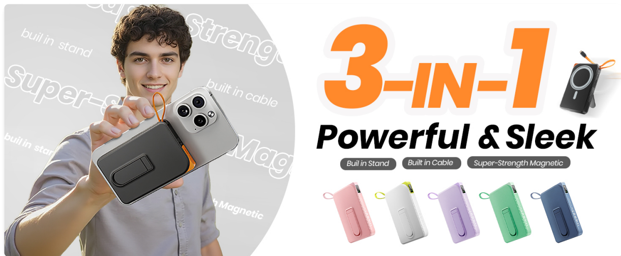
Image: Detailed view of the Ntaanoo MP51, illustrating its various components and features.