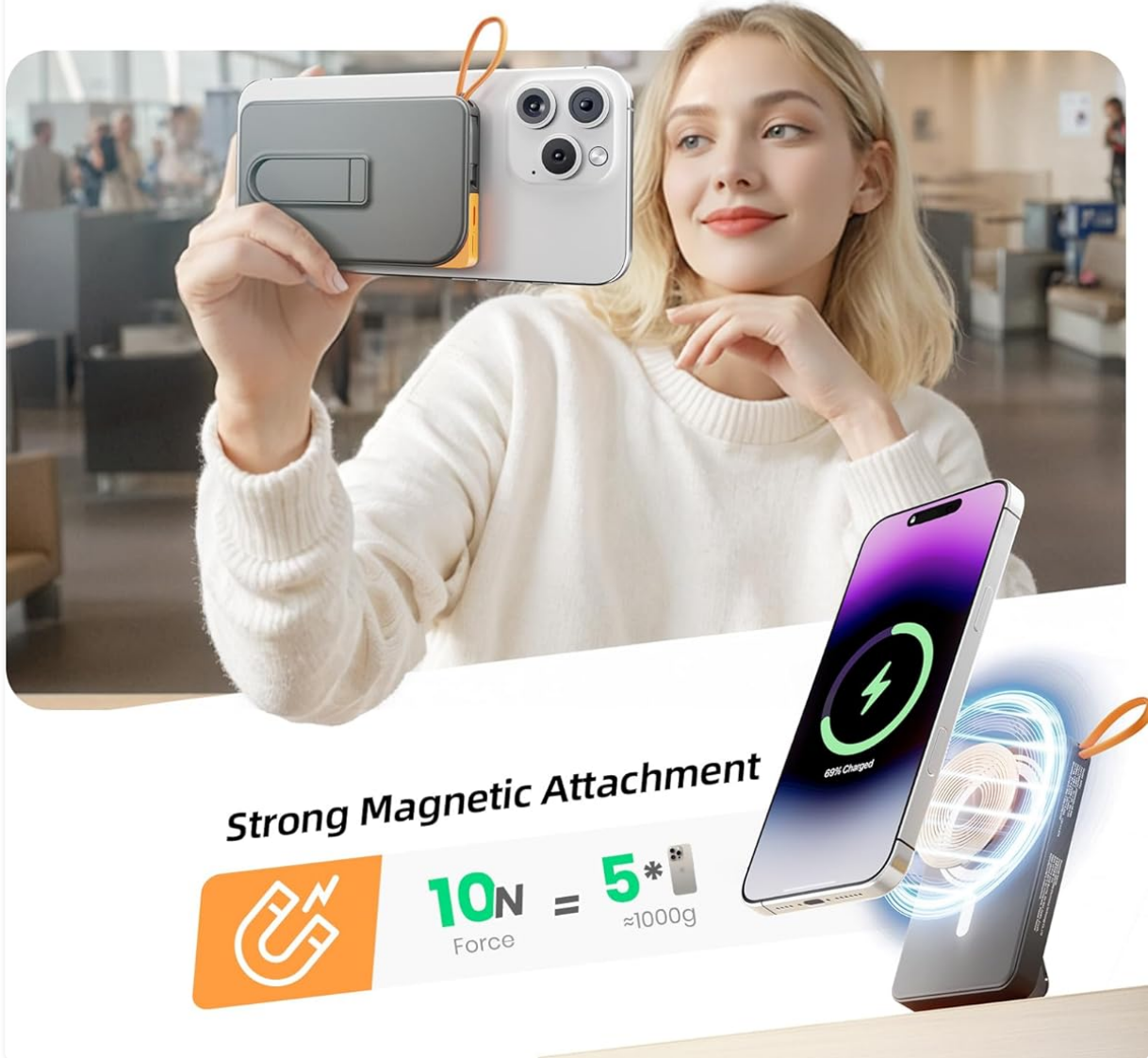
Image: Magnetic attachment of the power bank to an iPhone, showing the charging indicator on the phone screen.

Your browser does not support the video tag.