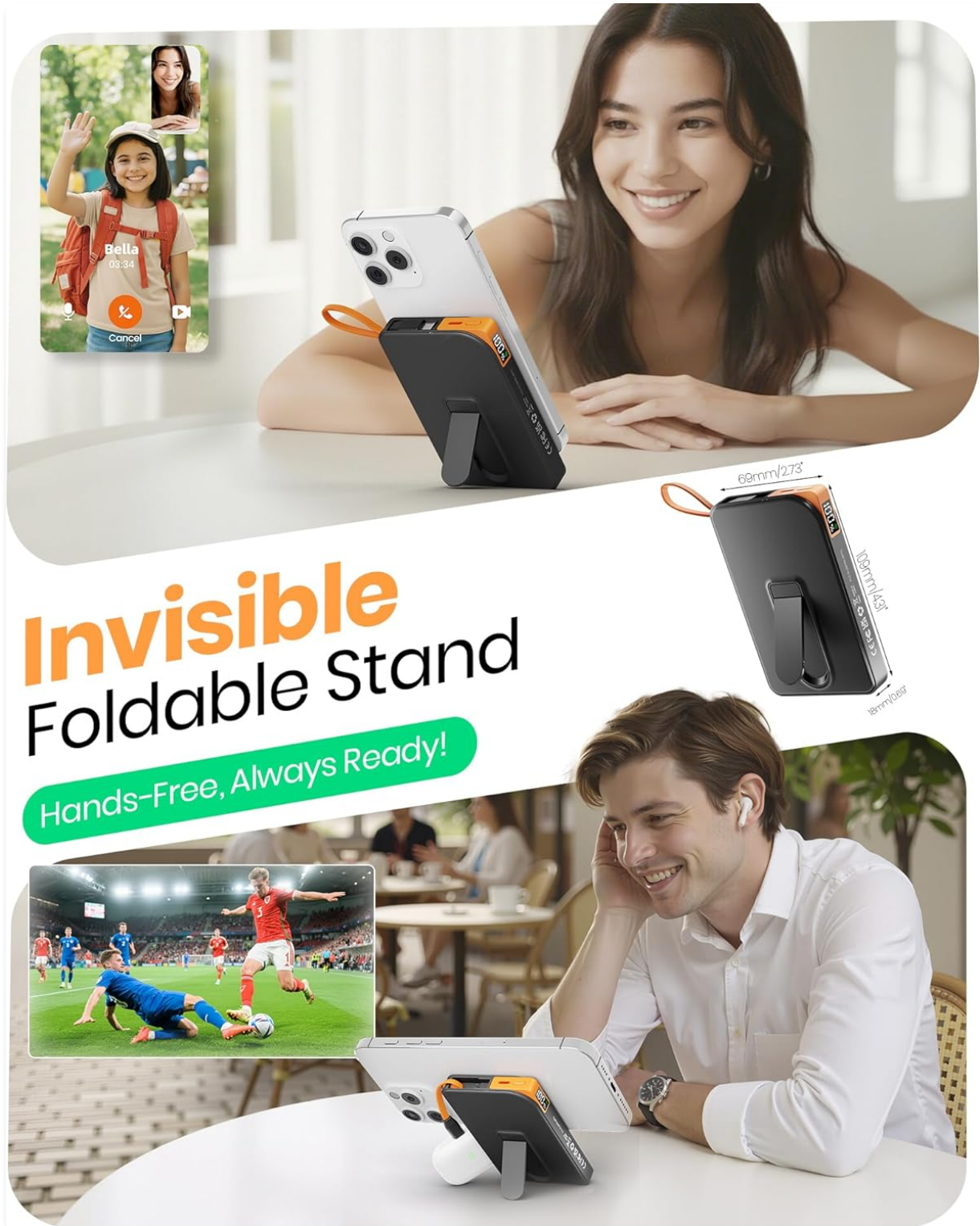
Image: The Ntaanoo MP51's foldable stand in use, supporting a phone for hands-free viewing during charging.

Your browser does not support the video tag.