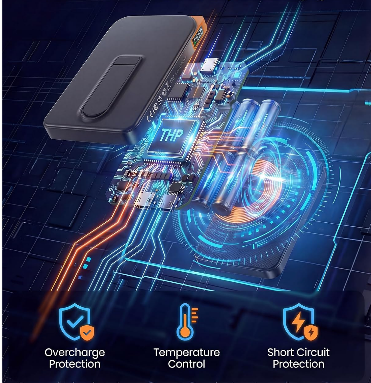
Image: Visual representation of the power bank's advanced safety mechanisms.

Advanced Protection for Worry-Free Charging