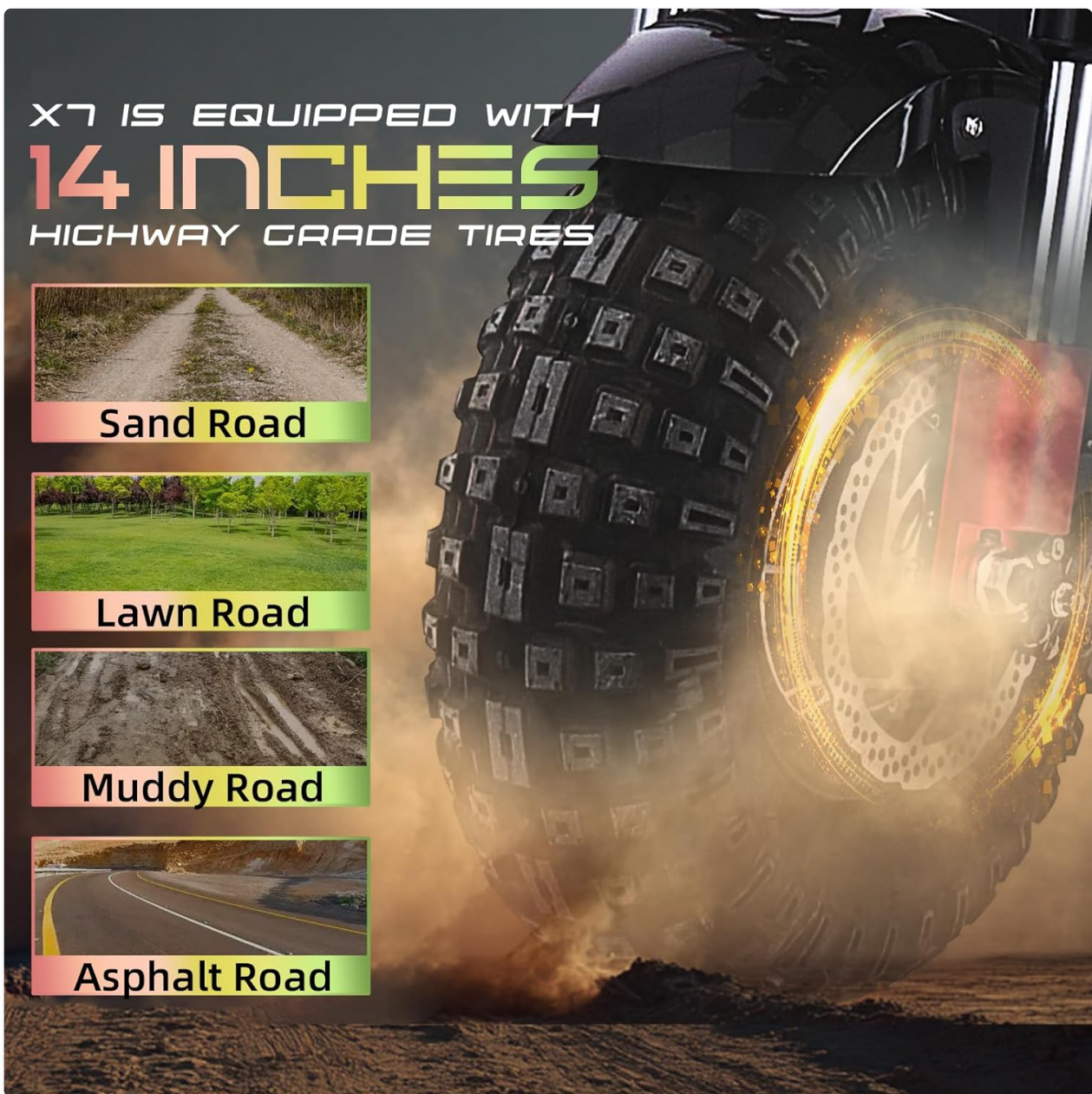
Figure 6: A detailed view of the 14-inch off-road inflatable tire of the OBARTER X7 Electric Scooter, with icons indicating suitability for sand, lawn, muddy, and asphalt roads.