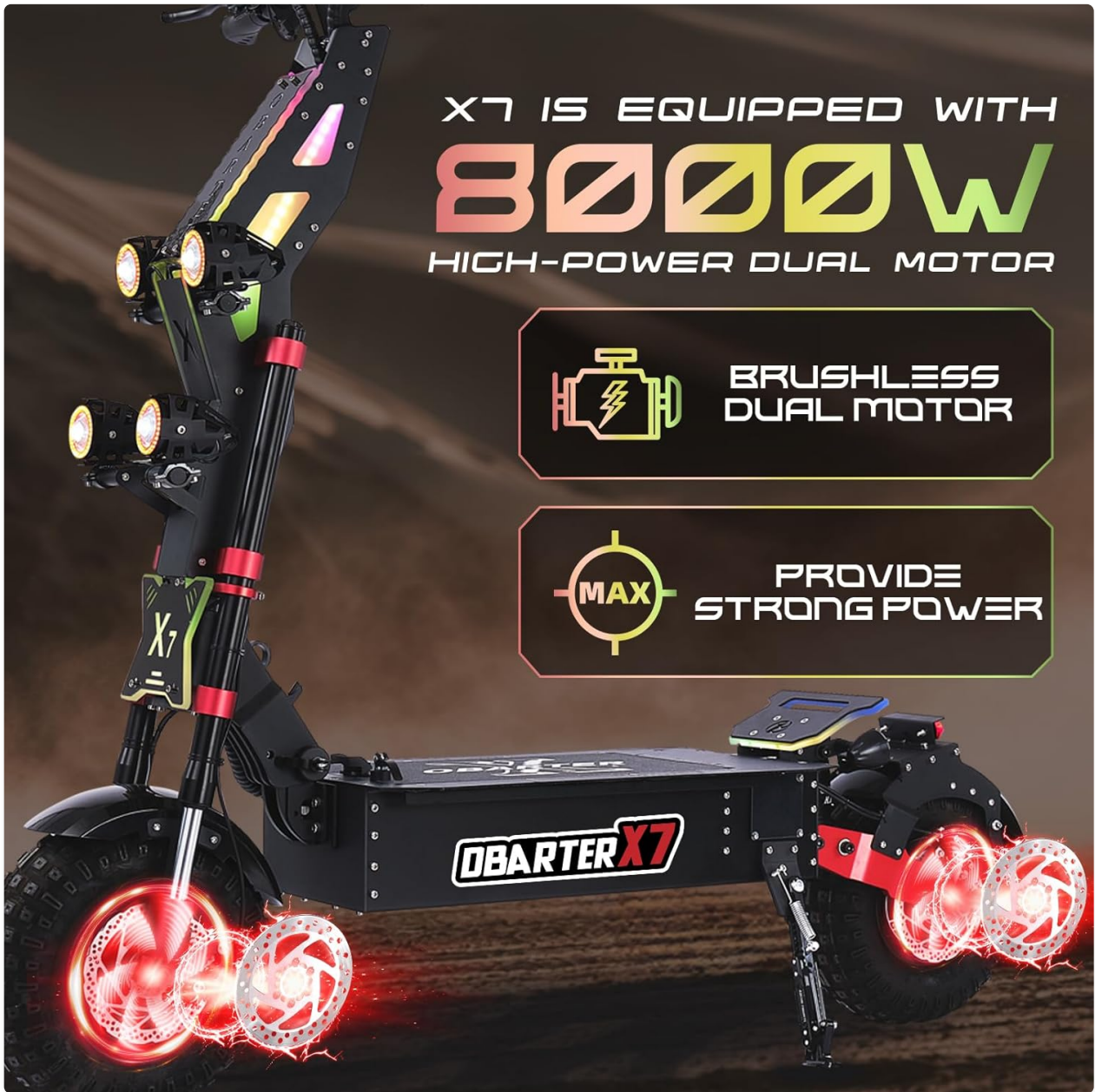
Figure 5: Close-up of the OBARTER X7 Electric Scooter's rear wheel and motor, emphasizing its 8000W high-power dual brushless motor system.