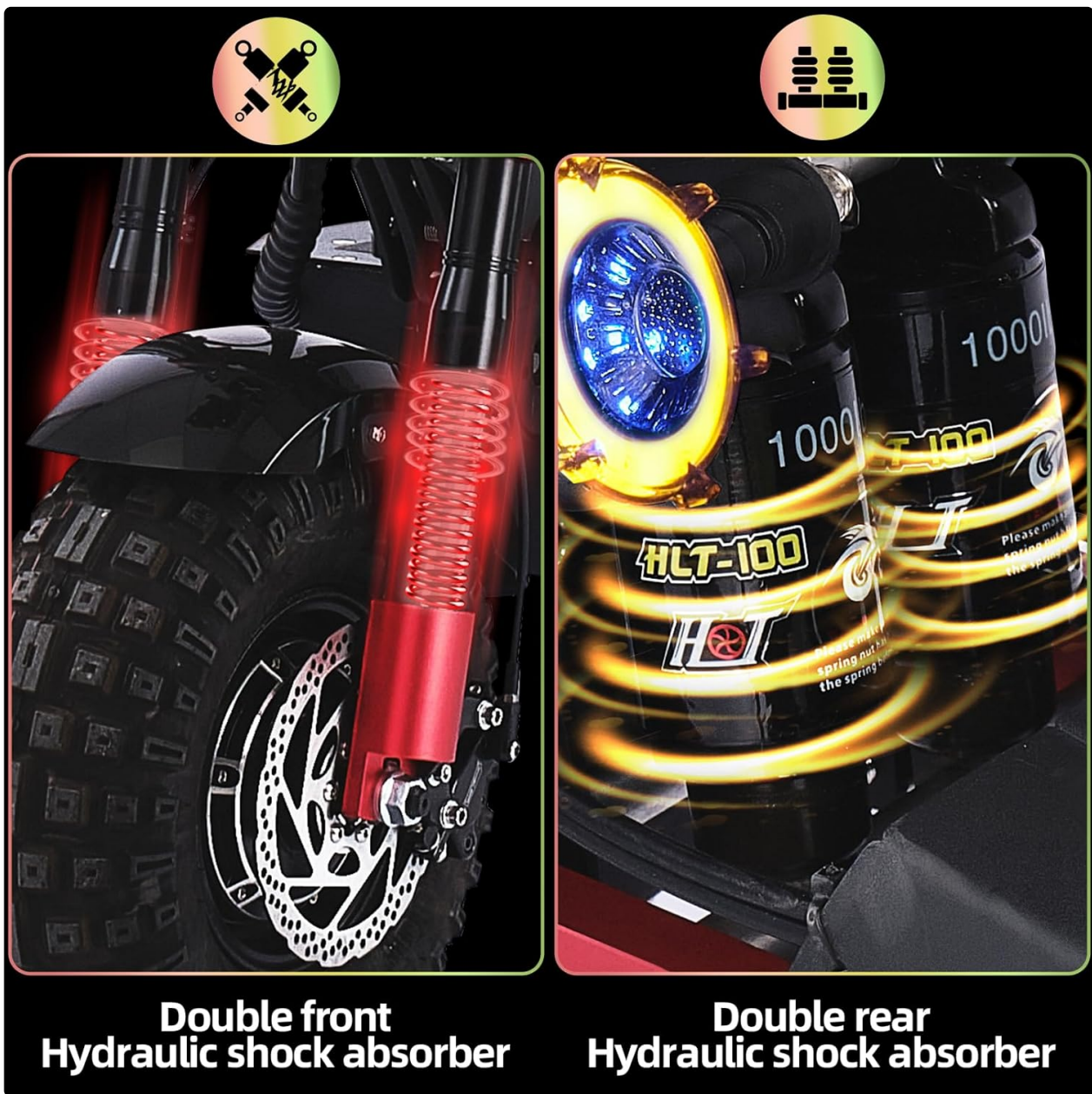
Figure 7: Visual representation of the double front and double rear hydraulic shock absorbers on the OBARTER X7 Electric Scooter.