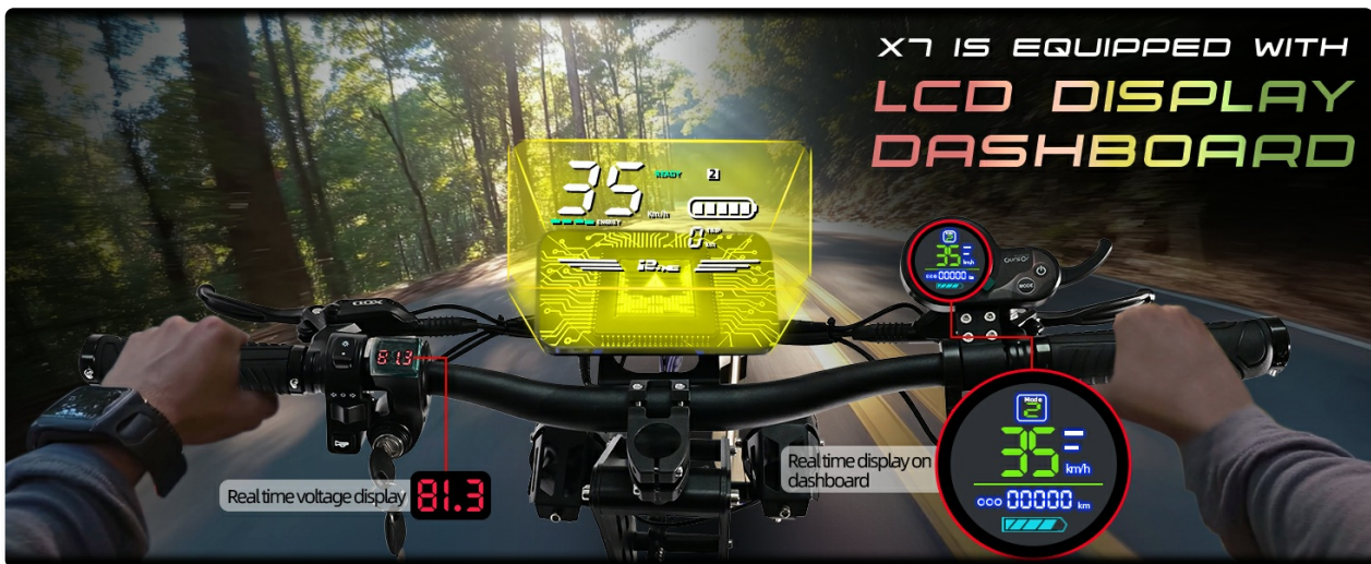
Figure 4: A view of the OBARTER X7 Electric Scooter's LCD display dashboard from the rider's perspective, showing real-time speed, battery, and voltage information.

The integrated LCD display provides real-time information including speed, battery level, and mileage. Use the control buttons near the display to switch between riding modes (e.g., single motor, dual motor) and adjust settings.