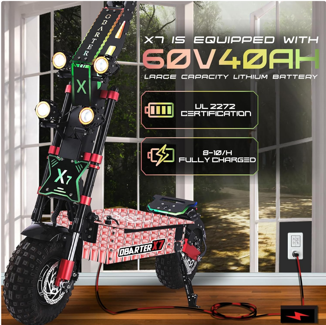
Figure 2: The OBARTER X7 Electric Scooter being charged, showcasing its 60V 40Ah large capacity lithium battery and UL 2272 certification.

The scooter's 60V 40Ah lithium battery should be fully charged before its first use. Connect the charger to the scooter's charging port and then to a standard power outlet. The charging indicator on the charger will change (e.g., from red to green) when charging is complete. Initial charging typically takes 8-10 hours.