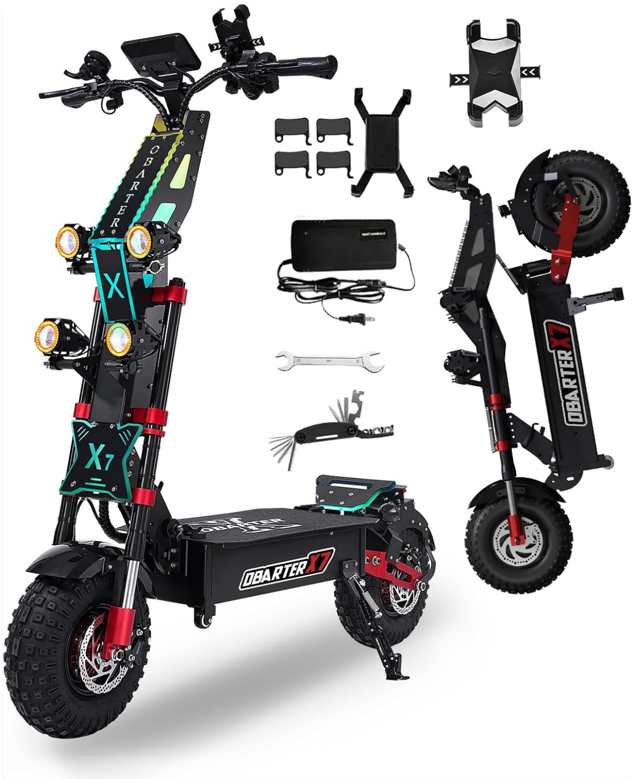
Figure 1: OBARTER X7 Electric Scooter with included accessories like charger, tools, and phone holder.