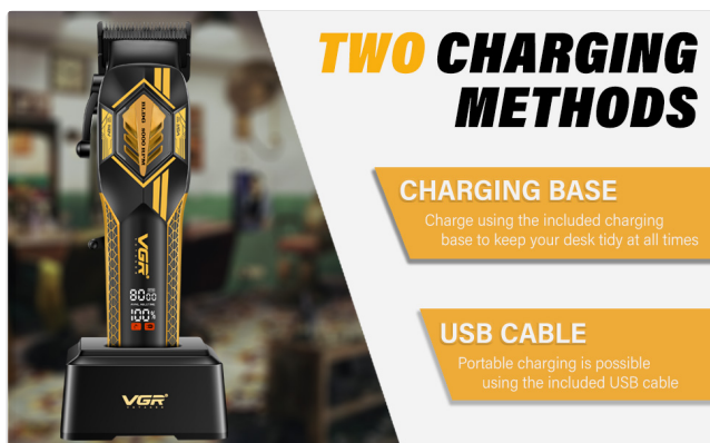
Figure 3.1: Dual Charging Methods. The clipper can be charged using the included charging base or directly via the USB cable for portable charging.

Before first use, fully charge the clipper. Connect the USB charging cable to the clipper or place the clipper in the charging dock. Connect the other end of the USB cable to a suitable USB power adapter (not included). The LED display will indicate charging status. A full charge takes approximately 3.5 hours.