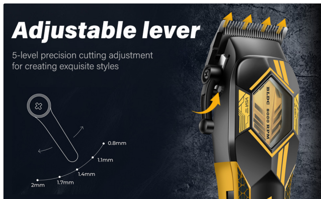
Figure 4.1: Taper Lever Adjustment. The lever provides precise control over cutting length.

The taper lever on the side of the clipper allows for fine adjustments to the cutting length without a guide comb, ranging from 0.8mm to 2mm. Move the lever up or down to select the desired length.