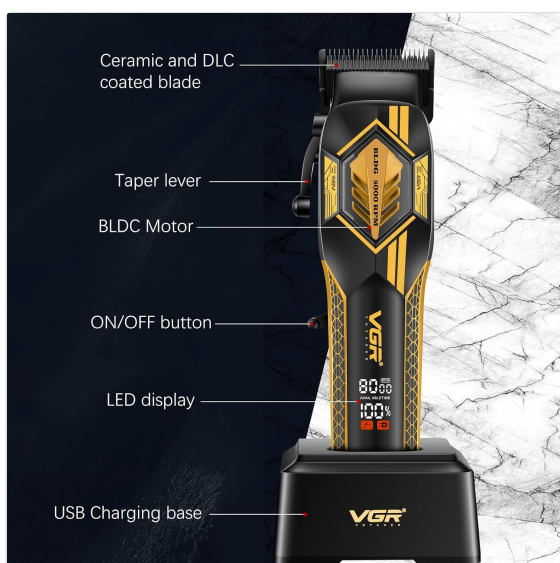
Figure 2.1: Clipper Components. This image shows the VGR 119 hair clipper resting on its charging base, highlighting key components such as the ceramic and DLC coated blade, taper lever, BLDC motor, ON/OFF button, LED display, and USB charging base.

The VGR 119 hair clippers are designed for professional and home use, featuring a powerful BLDC motor and precision ceramic blades for consistent cutting performance.