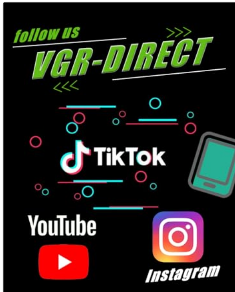
Figure 9.2: VGR-DIRECT Social Media. Connect with us for updates and support.

contact details on our website or social media platforms.