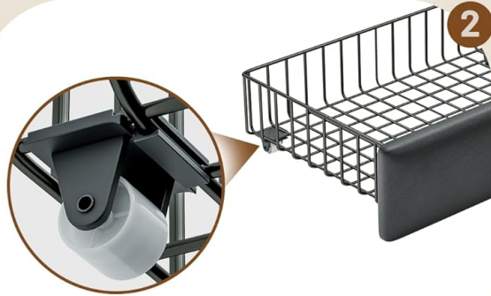
8 Rollers for Storage Drawers