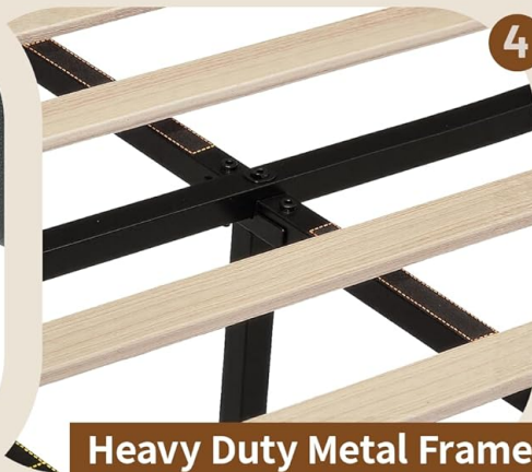
Heavy Duty Metal Frame

Image: A visual representation of the non-slip and silent design of the bed slats, indicating a quiet and comfortable sleeping environment. This emphasizes the noise-reduction features.