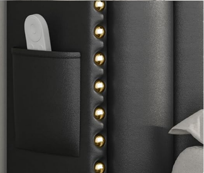
Image: A close-up view of the CypBed headboard, highlighting the two hidden drawers and two side pockets. This illustrates the integrated storage features of the headboard.

Put frequently used items in easy-to-reach places.