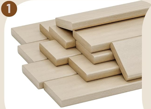
12 Sturdy Wooden Slats