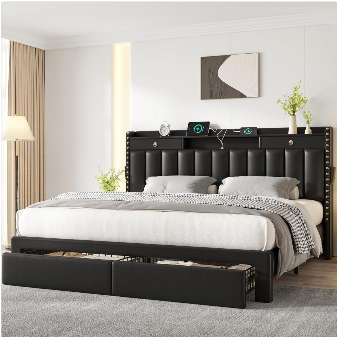
Image: The two large storage drawers are shown pulled out from under the bed, filled with folded clothes and bedding. This demonstrates the practical storage solution.