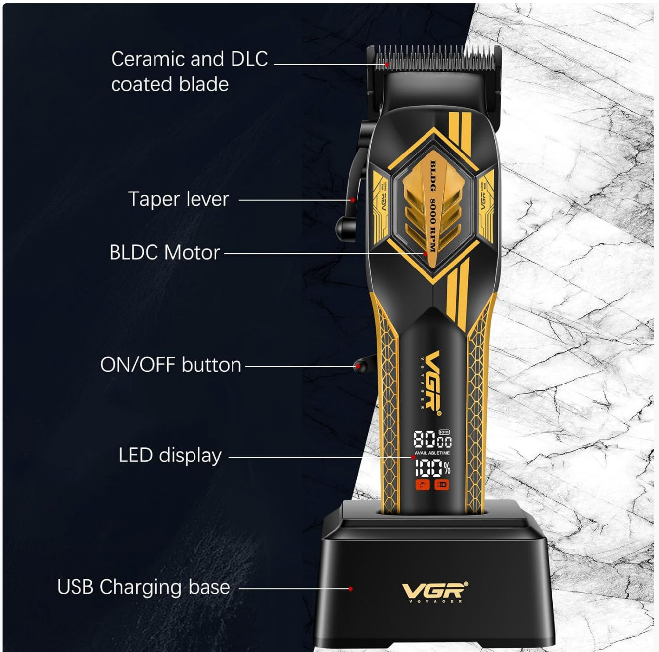
Image: The VGR 119 Hair Clipper illustrating the 5-level adjustable taper lever for precision cutting from 0.8mm to 2mm.