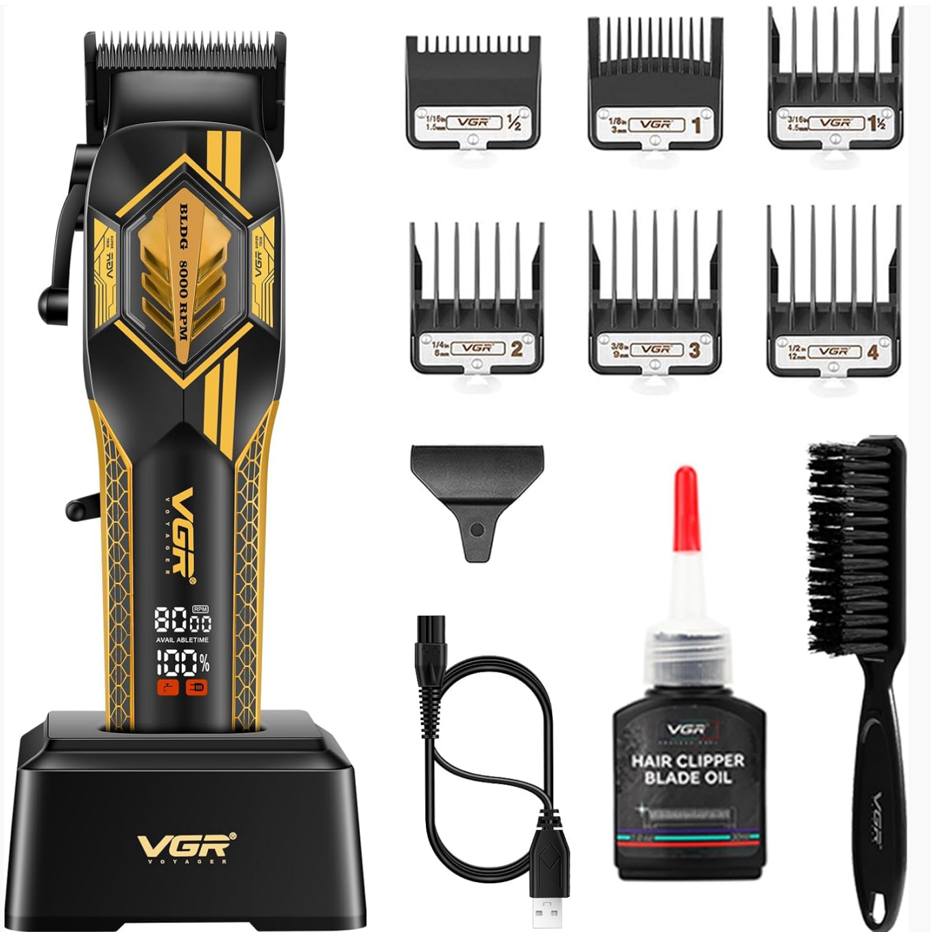
Image: The VGR 119 Professional Cordless Hair Clipper in Gold, showcasing its sleek design.