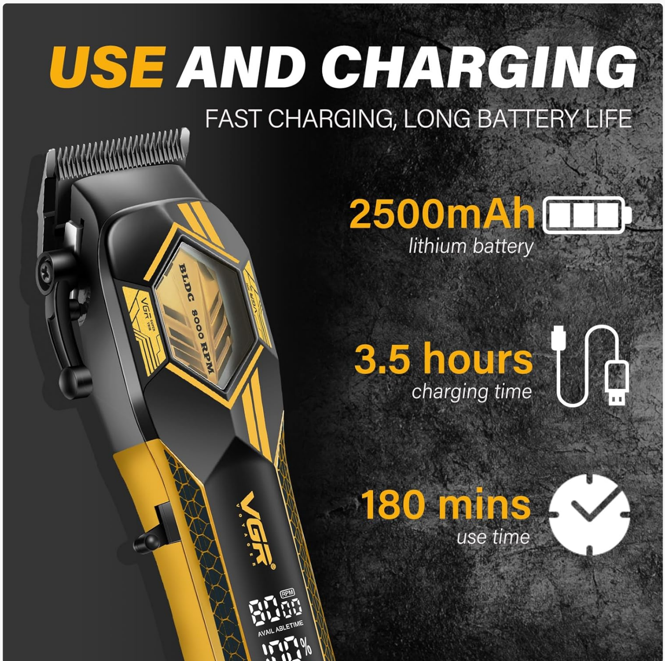
Image: The VGR 119 Hair Clipper shown on its charging base, highlighting its 2500mAh battery, 3.5-hour charging time, and 180 minutes of use time.