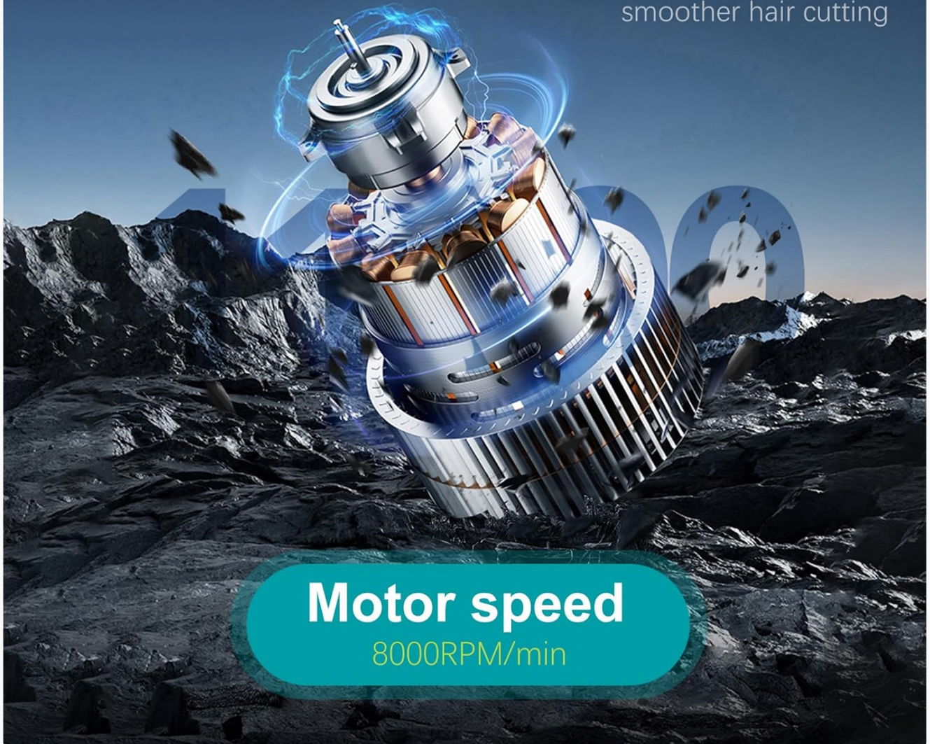
Image: The VGR 119 Hair Clipper highlighting its powerful 8000 RPM BLDC motor for smooth hair cutting.

Powerful, fast speeds for smoother hair cutting