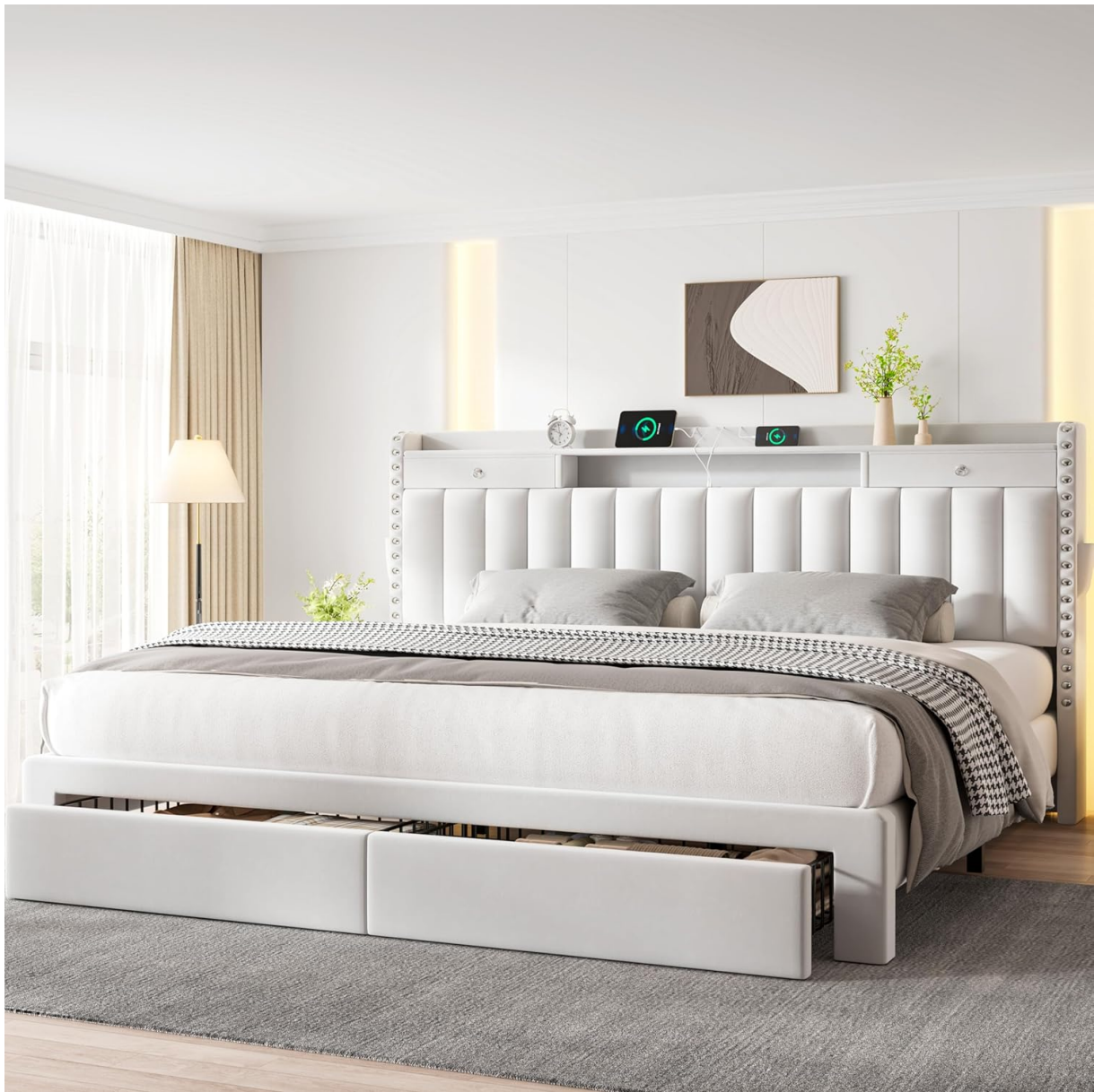
Image 5.3: The two large storage drawers at the foot of the bed provide ample space for various items.