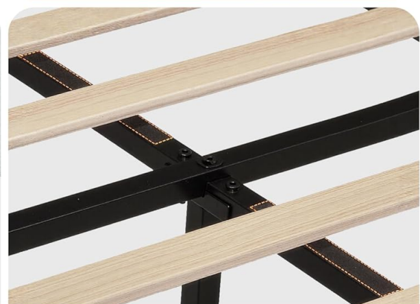
Heavy Duty Metal Frame

Image 3.1: Components such as sturdy wooden slats, rollers for storage drawers, strong metal support feet, and heavy-duty metal frame.