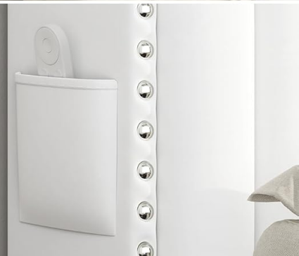
Image 5.2: The headboard offers two hidden drawers and two side pockets for convenient storage.

Put frequently used items in easy-to-reach places.