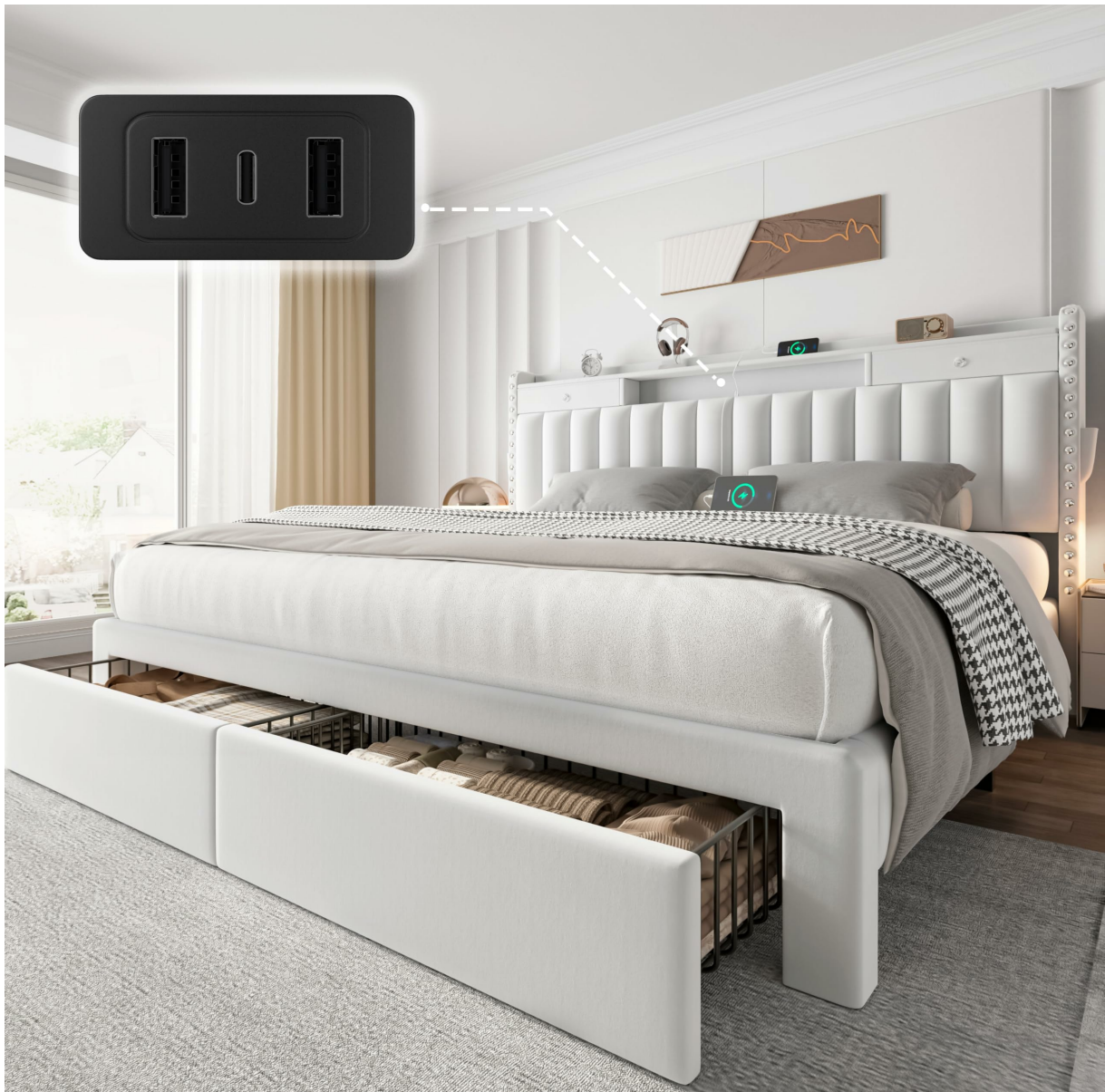
Image 1.1: Overall view of the CypBed King Size Bed Frame in White.