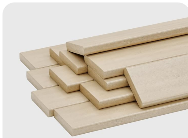
12 Sturdy Wooden Slats