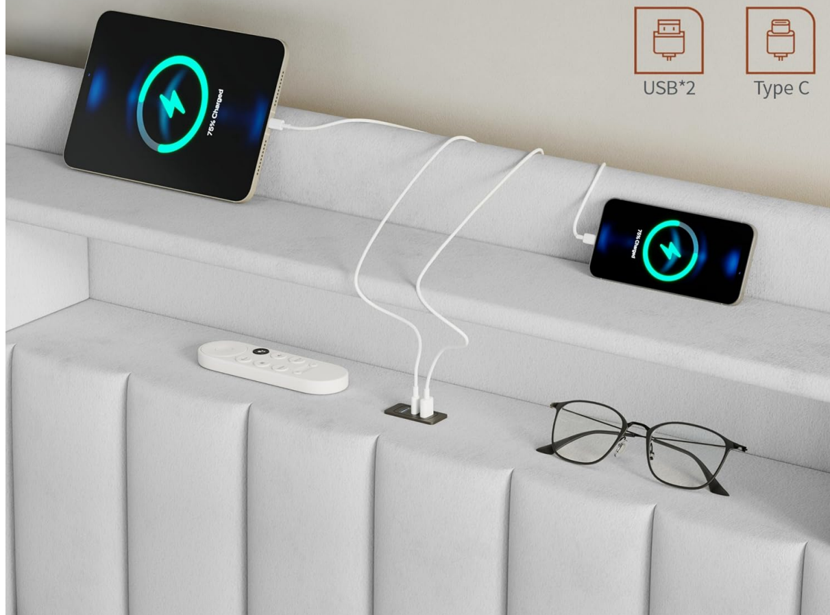
Image 5.1: The headboard features two USB ports and one Type-C port for charging multiple devices simultaneously.

You can charge three devices at the same time from your bed