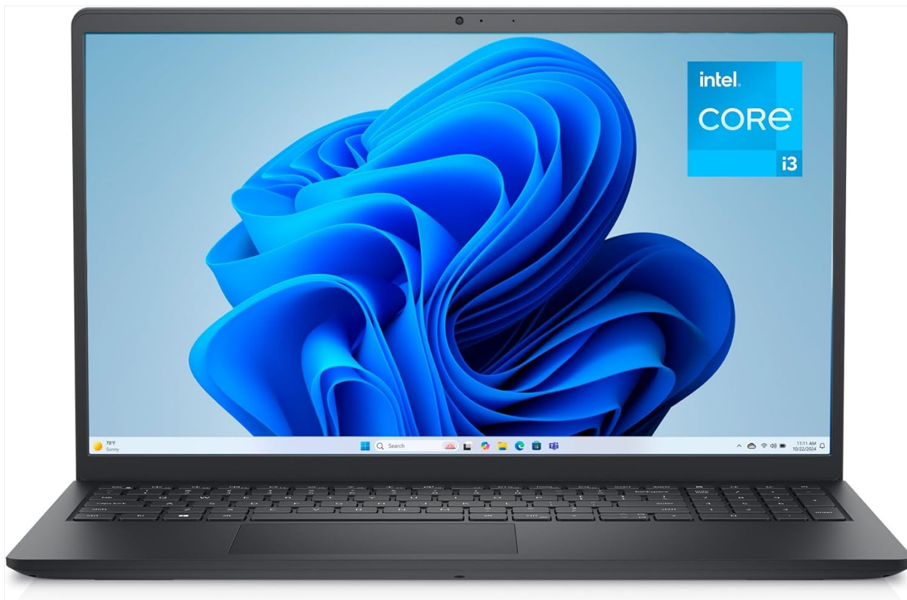
Figure 1.1: Dell Inspiron 3530 Laptop, front view with display showing Windows 11 desktop.

The Dell Inspiron 3530 is a 15.6-inch laptop designed for everyday computing tasks. It features a Full HD (1920x1080) display, an Intel Core i3-1305U processor, 8GB of DDR4 RAM, and a 512GB SSD. This manual provides essential information for setting up, operating, and maintaining your device.