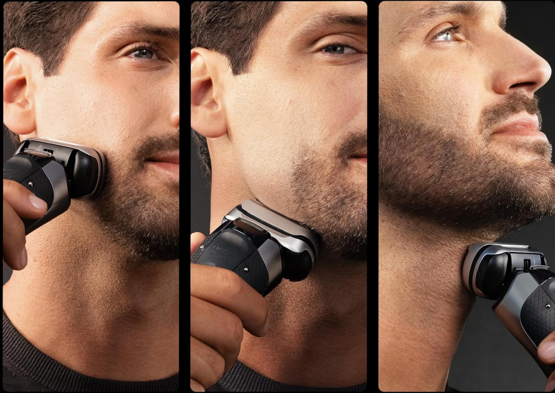
Image: A man demonstrating the shaver's effectiveness on various beard densities, highlighting maximum efficiency.

Any facial area and any beard's density.