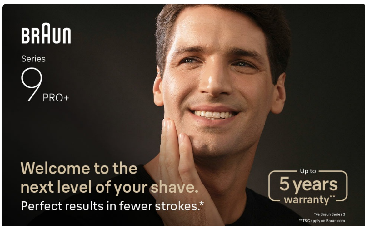
Image: A man with a smooth face, indicating the superior shaving experience offered by the Braun Series 9 PRO+.