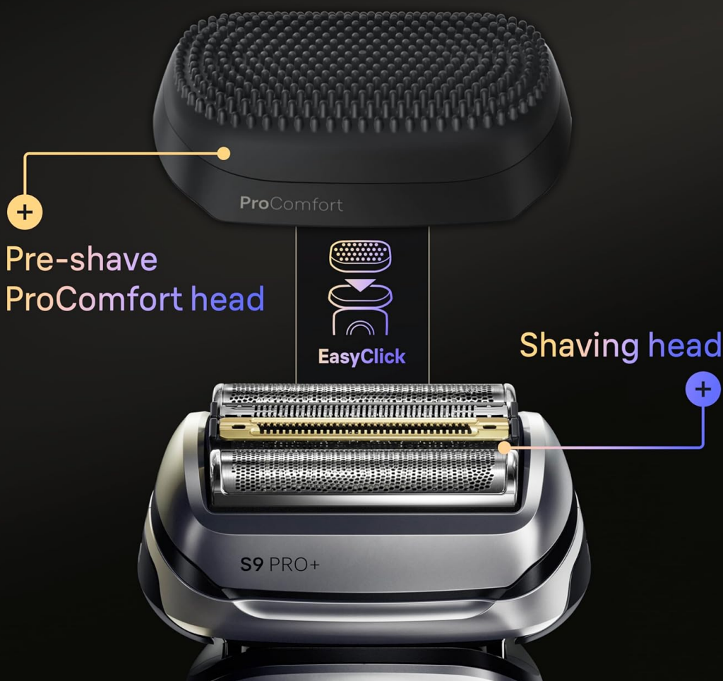
Image: A close-up of the ProComfort head, showing its 387 soft silicone bristles and highlighting its power by 10,000 sonic vibrations for beard massage.