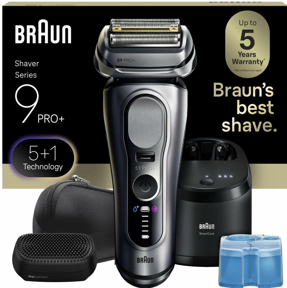
Image: Braun Series 9 PRO+ Electric Shaver, highlighting its 5+1 Technology, Pro SensoAdapt, 60 min run time, 5 min quick charge, 100% waterproof design, and Made in Germany quality.