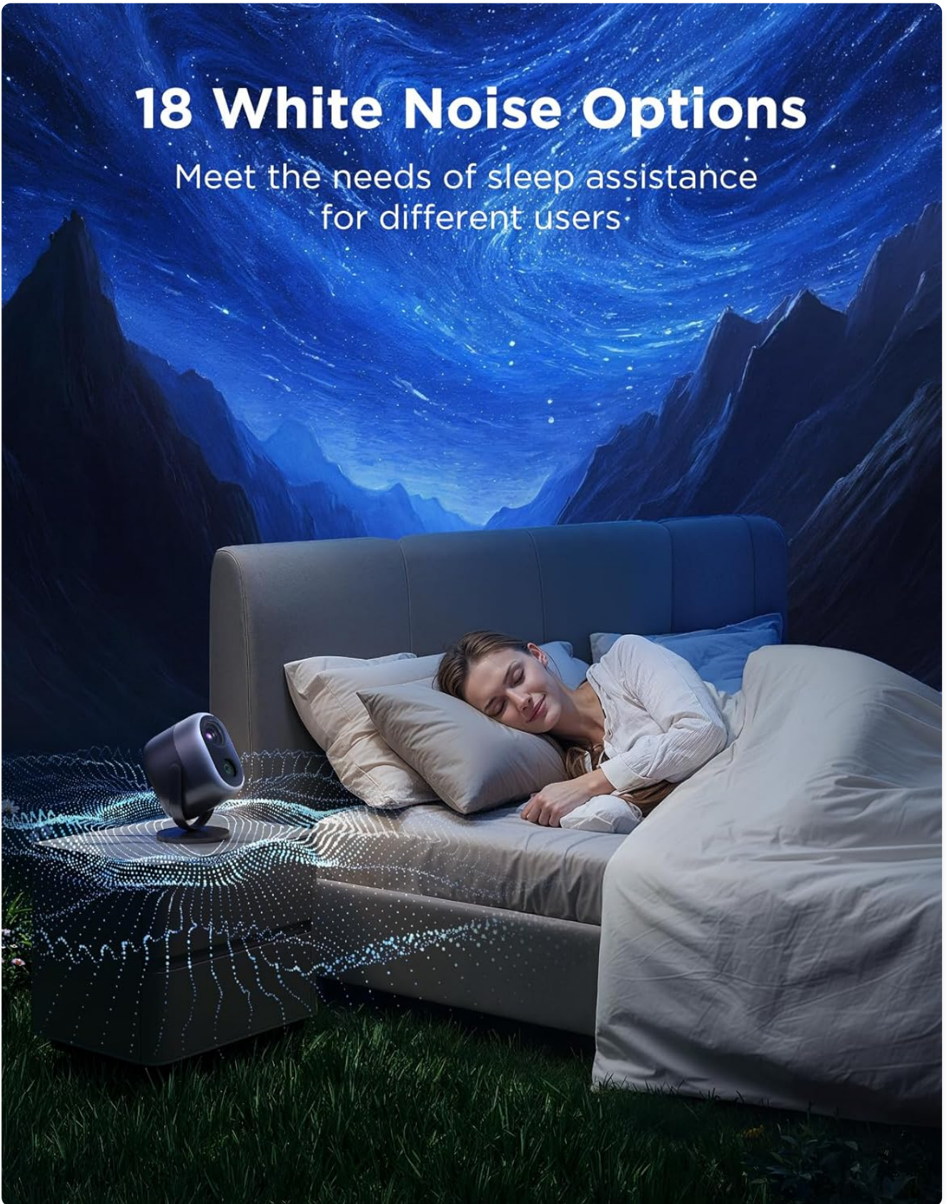
Image 5.3: The projector offers 18 white noise options for sleep assistance.

Meet the needs of sleep assistance for different users.