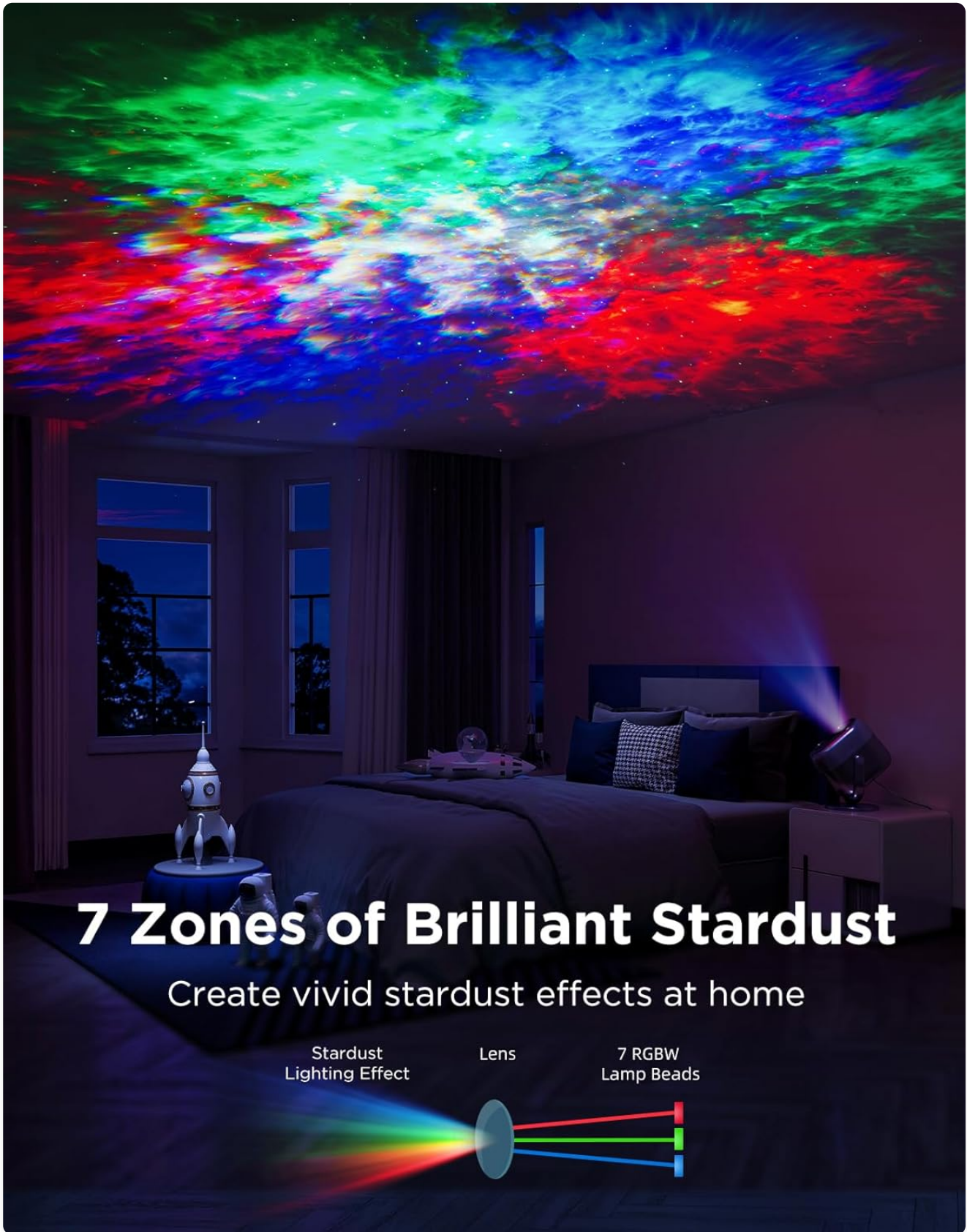
Image 3.1: Visual representation of the 7-zone stardust projection mechanism.