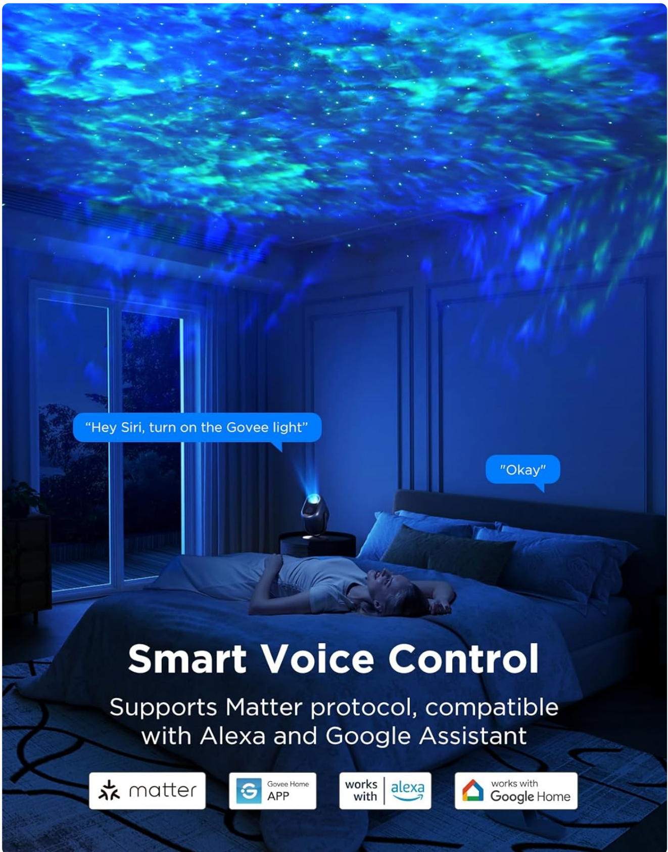
Image 4.1: The Govee Star Projector Lights H6095 supports smart voice control.