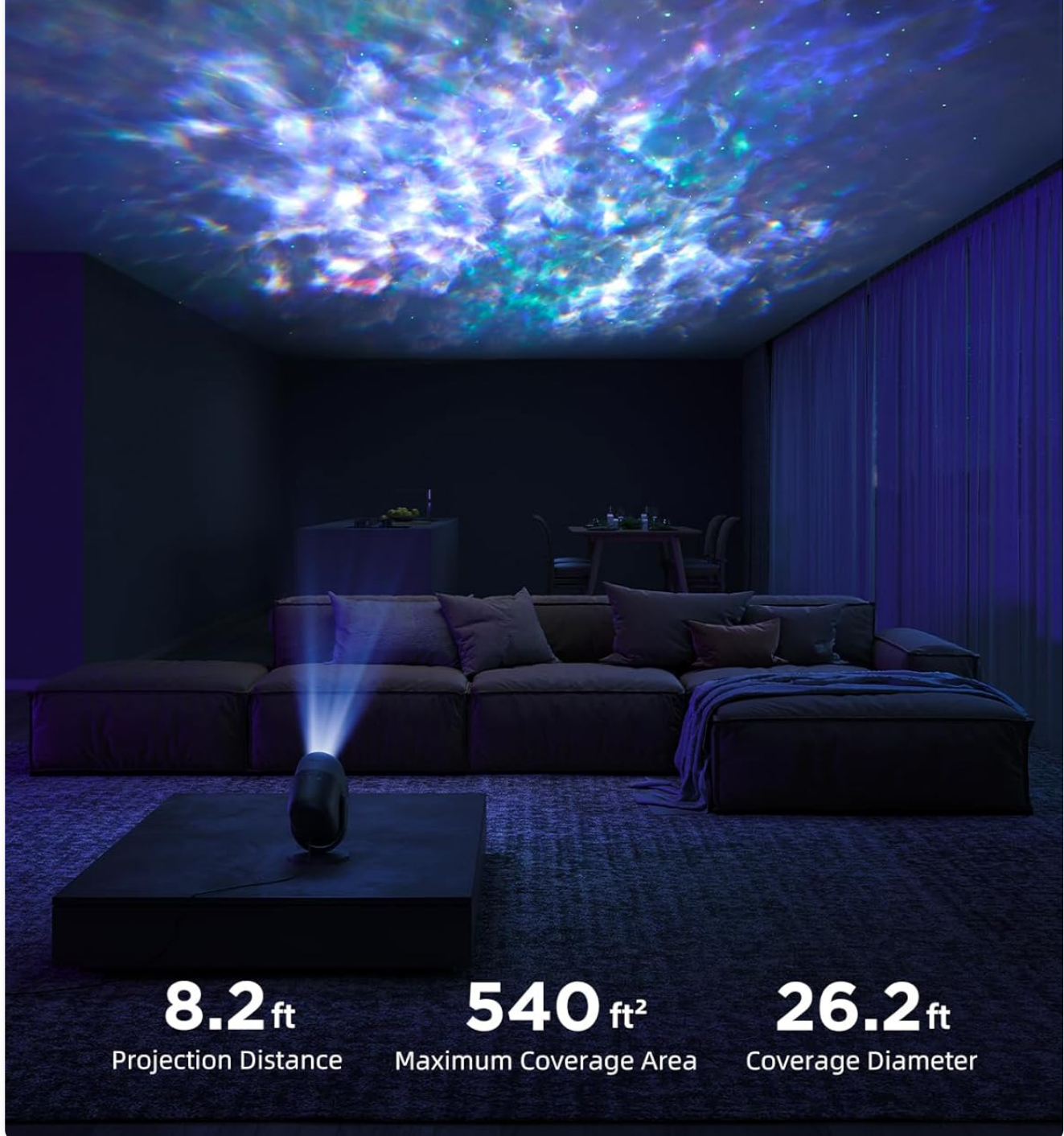
Image 3.2: The projector's extensive coverage area demonstrated in a room setting.