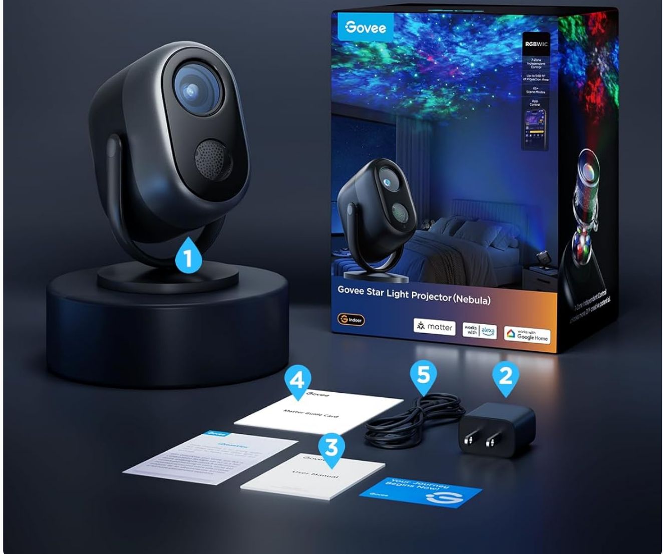
Image 2.1: All items included in the Govee Star Projector Lights H6095 package.