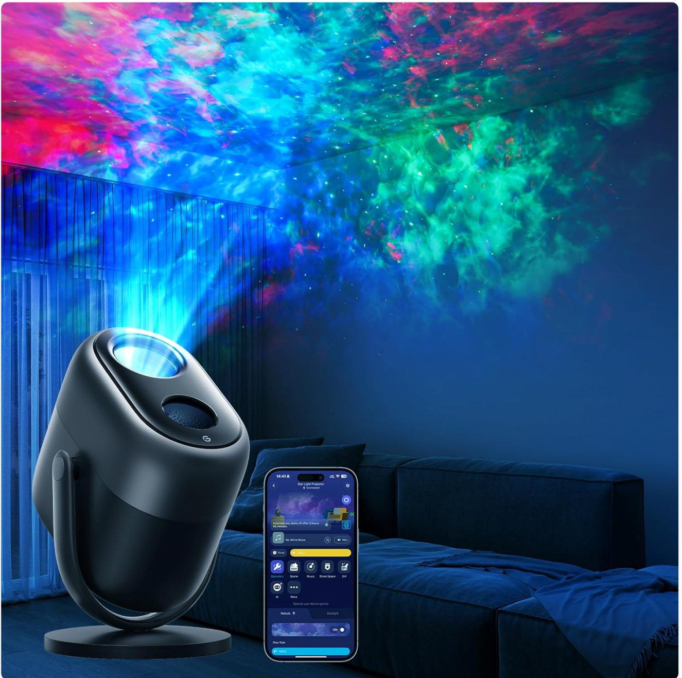
Image 1.1: The Govee Star Projector Lights H6095 in operation, displaying its vibrant nebula and star effects.