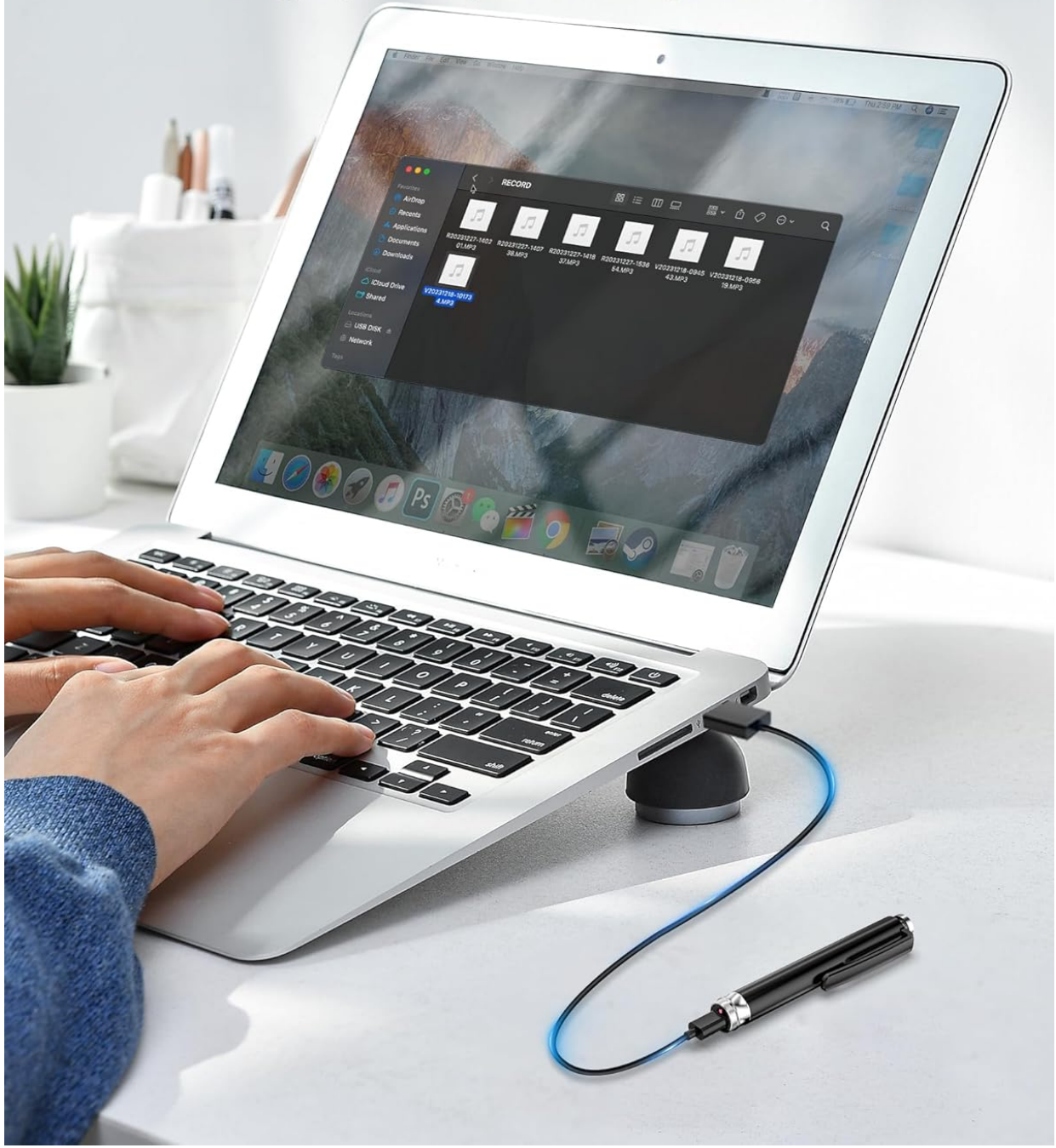
Image: Connecting the voice recorder to a computer for convenient file transfer.

Connecting to your computer to manage recorded files