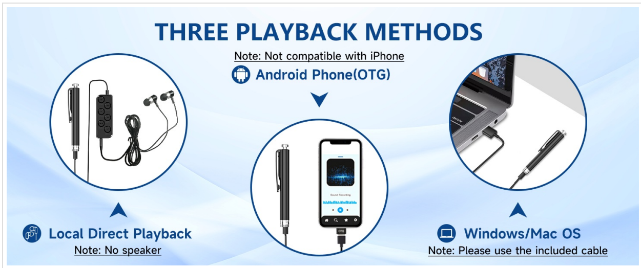
Image: Three methods for playing back recorded audio files.