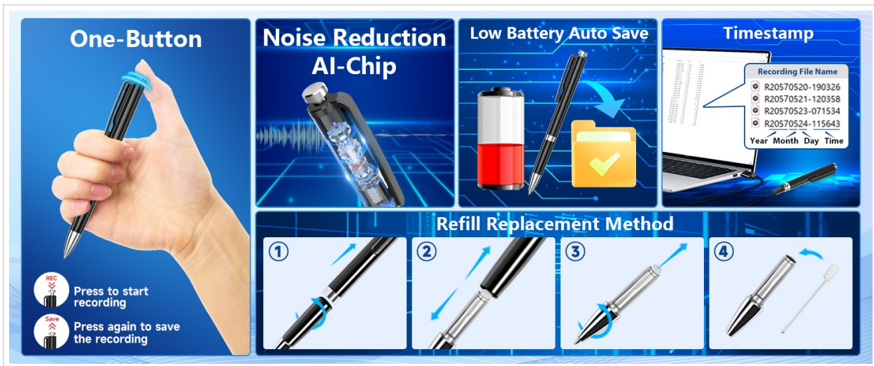
Image: Illustration of the refill replacement method.