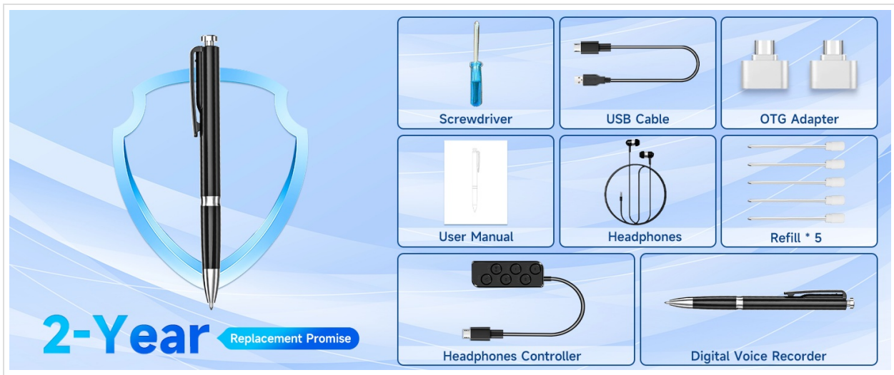
Image: Contents of the XIXITPY Digital Voice Recorder package.