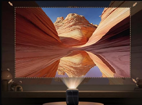
Auto Screen Fit