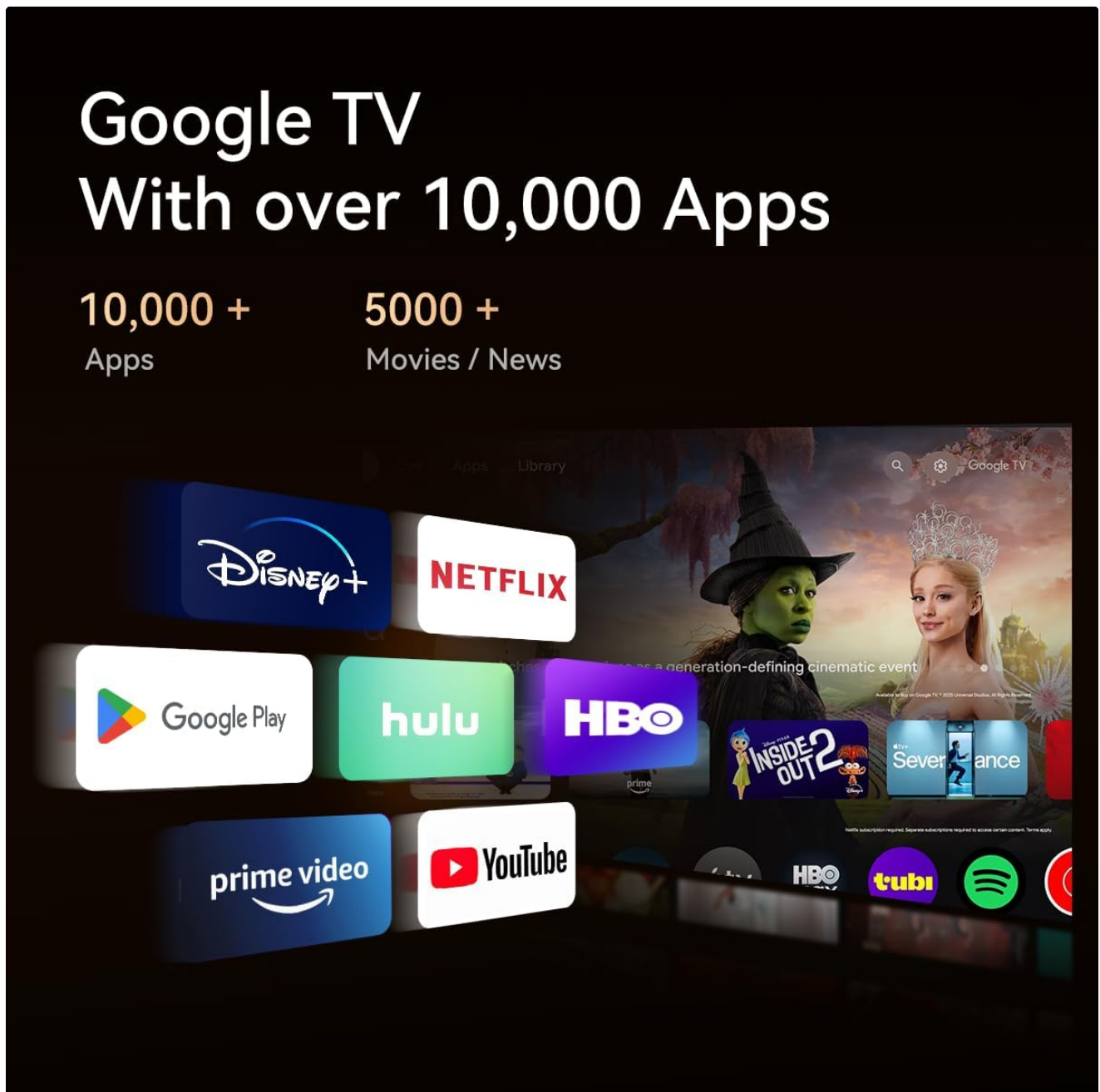
Figure 5.1: The Google TV interface displaying various streaming applications such as Disney+, Netflix, Hulu, HBO, Prime Video, and YouTube, indicating access to a wide range of content.