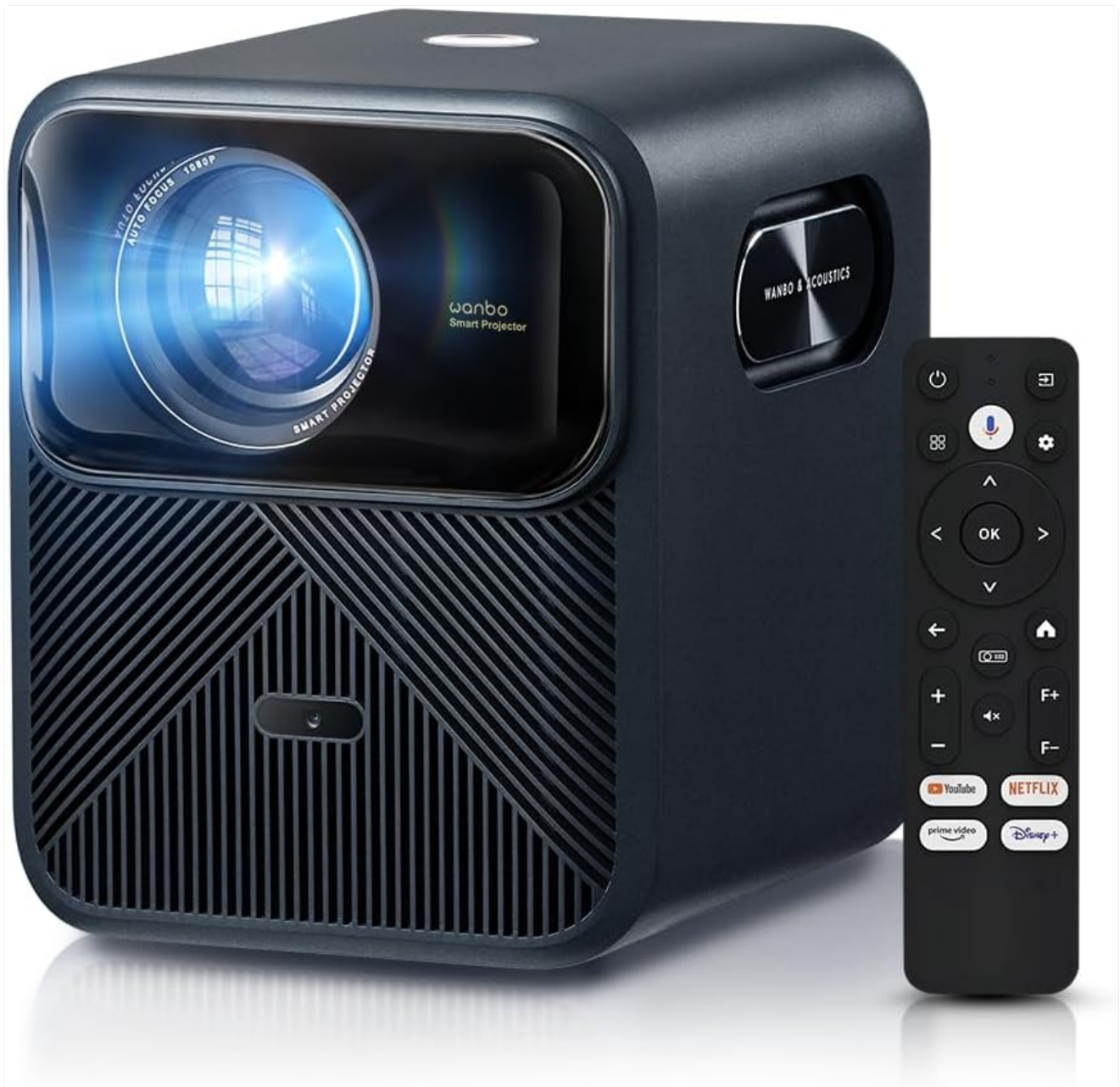
Figure 4.1: Front view of the WANBO Mozart 1 Pro projector with its remote control. The projector features a large lens, front grille, and a sensor. The remote control has navigation buttons, volume controls, and dedicated app buttons.

Familiarize yourself with the components of your projector.