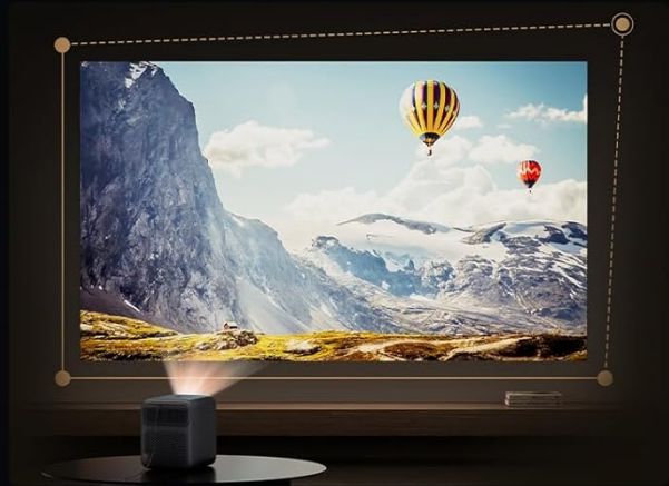
Auto Keystone Correction