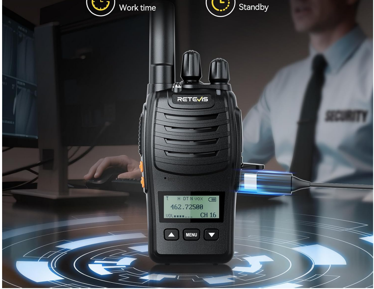
Image: Close-up of the Retevis H777D walkie-talkie's LCD screen, showing signal strength, volume, channel, and battery level indicators.