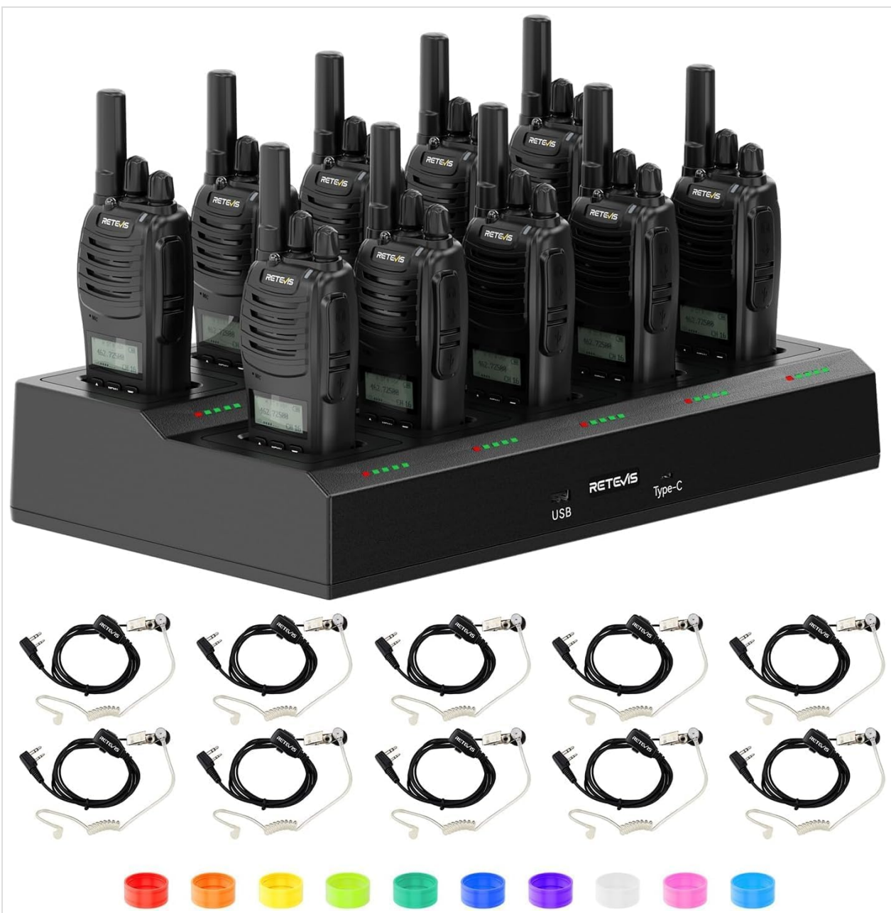
Image: The Retevis H777D 10-way multi-unit charger with multiple walkie-talkies docked, showing the centralized charging setup.

Your browser does not support the video tag.