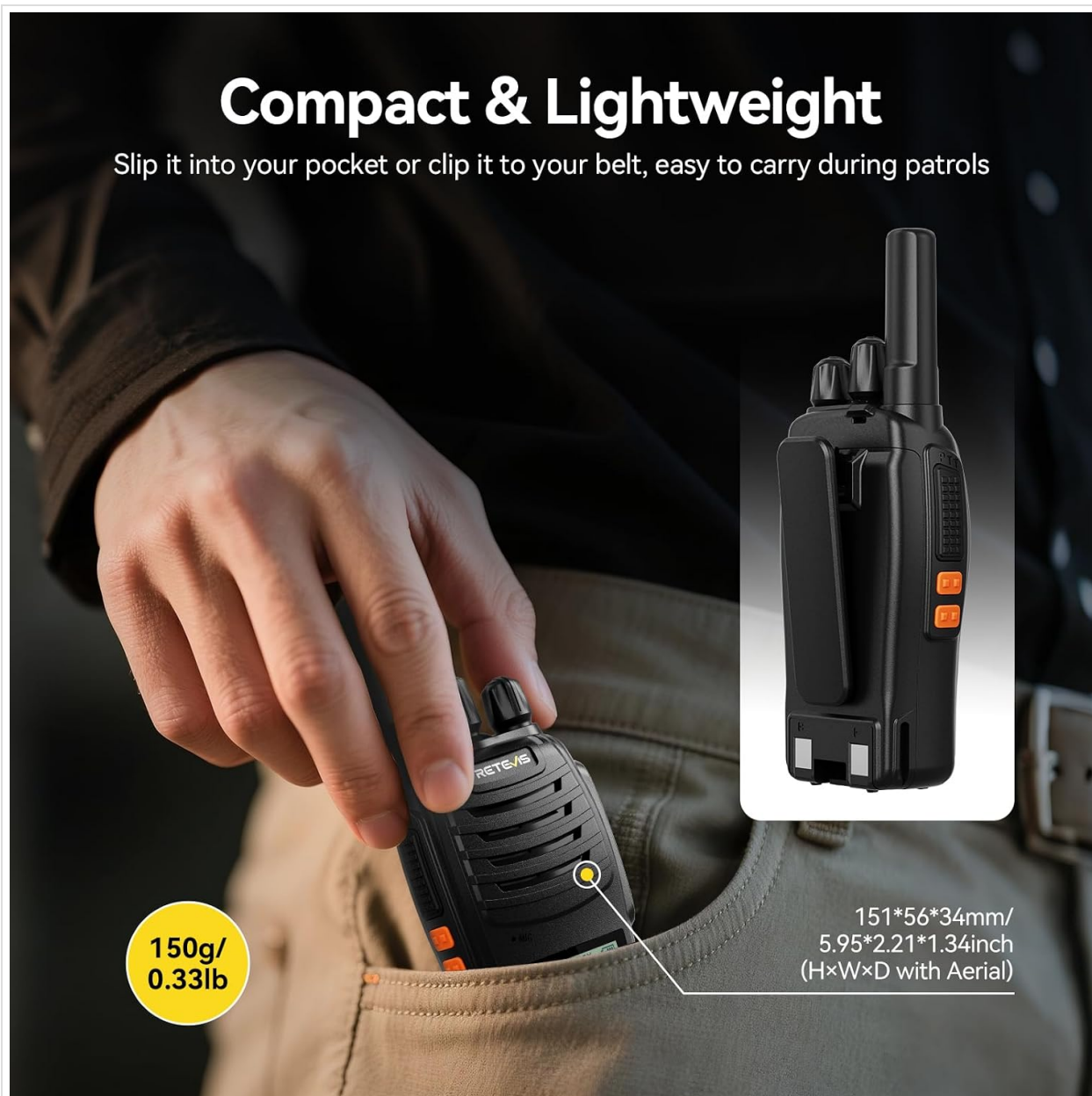
Image: A hand holding the compact and lightweight Retevis H777D walkie-talkie, illustrating its portability.

Slip it into your pocket or clip it to your belt, easy to carry during patrols