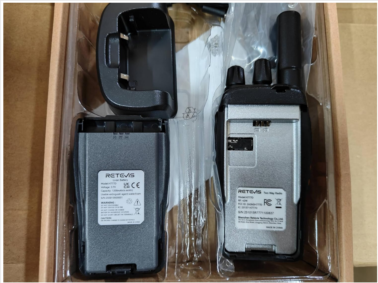
Image: A view of the Retevis H777D walkie-talkie with its battery compartment open, showing how to install the battery pack.