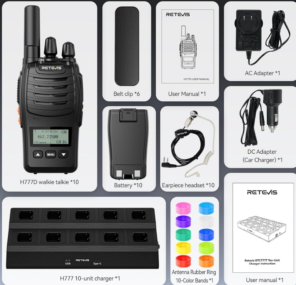
Image: Overview of the Retevis H777D two-way radio package contents, including ten walkie-talkies, a multi-unit charger, batteries, earpieces, and other accessories.