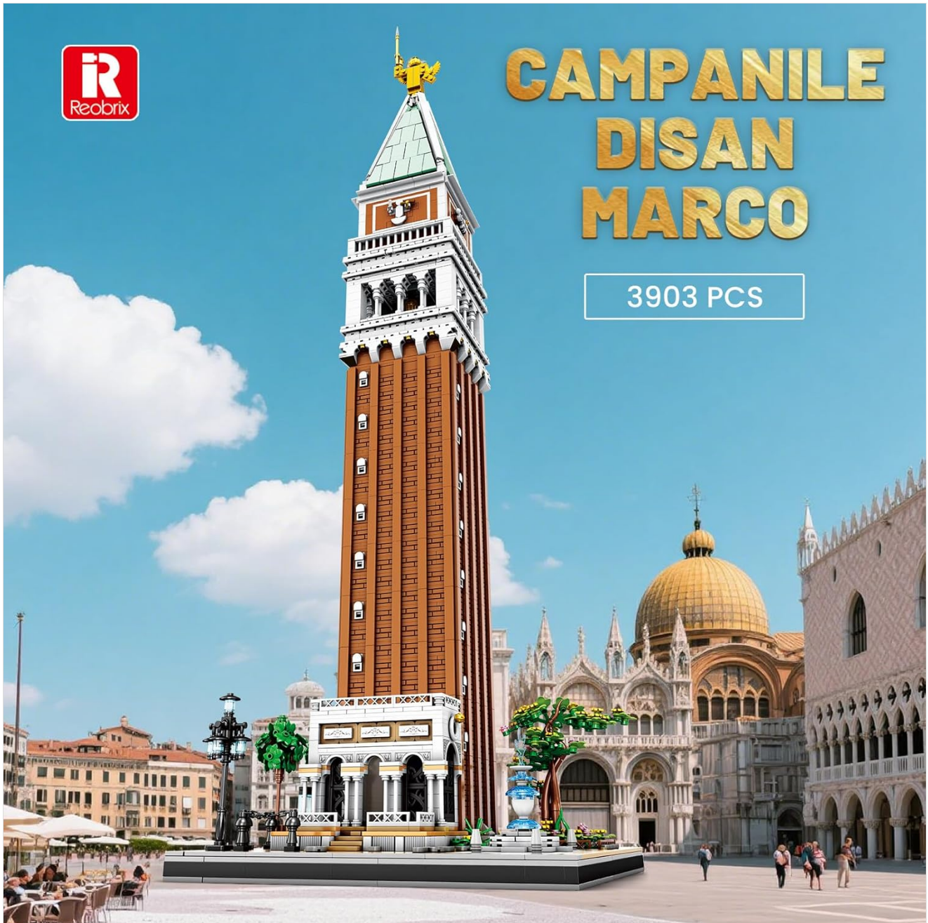
Image: The completed Reobrix St. Mark's Campanile model.

Once all sections are assembled, your Reobrix St. Mark's Campanile model will stand as a testament to architectural beauty.