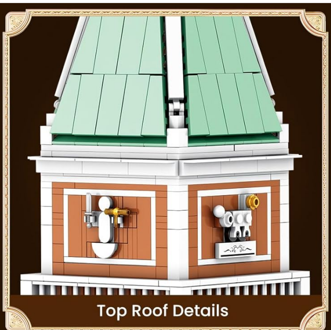
Top Roof Details