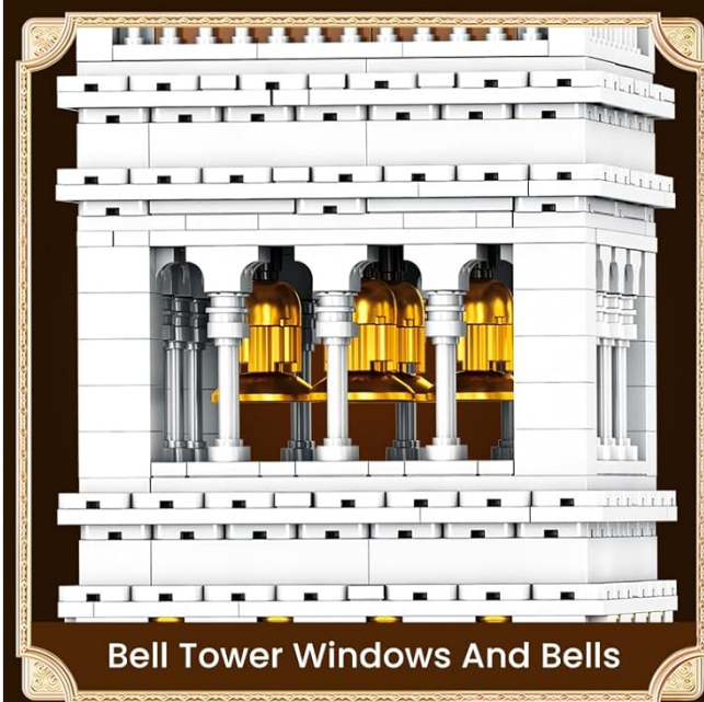
Bell Tower Windows And Bells