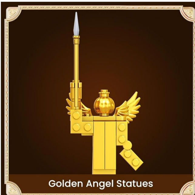
Golden Angel Statues