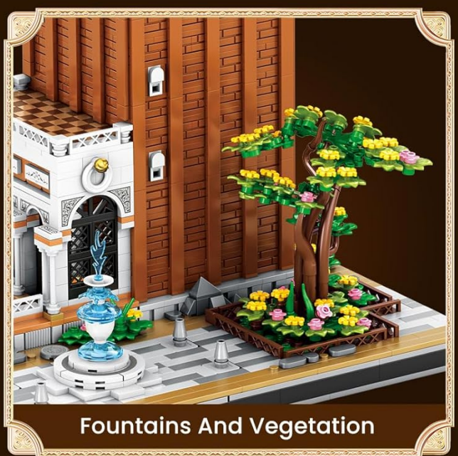
Fountains And Vegetation