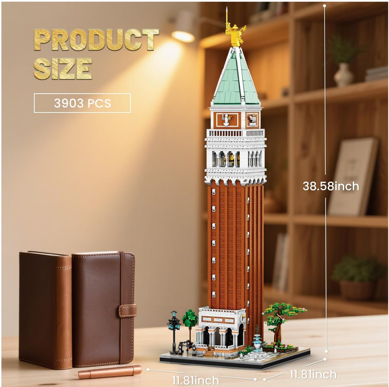
Image: Product size comparison, showing the model's height.