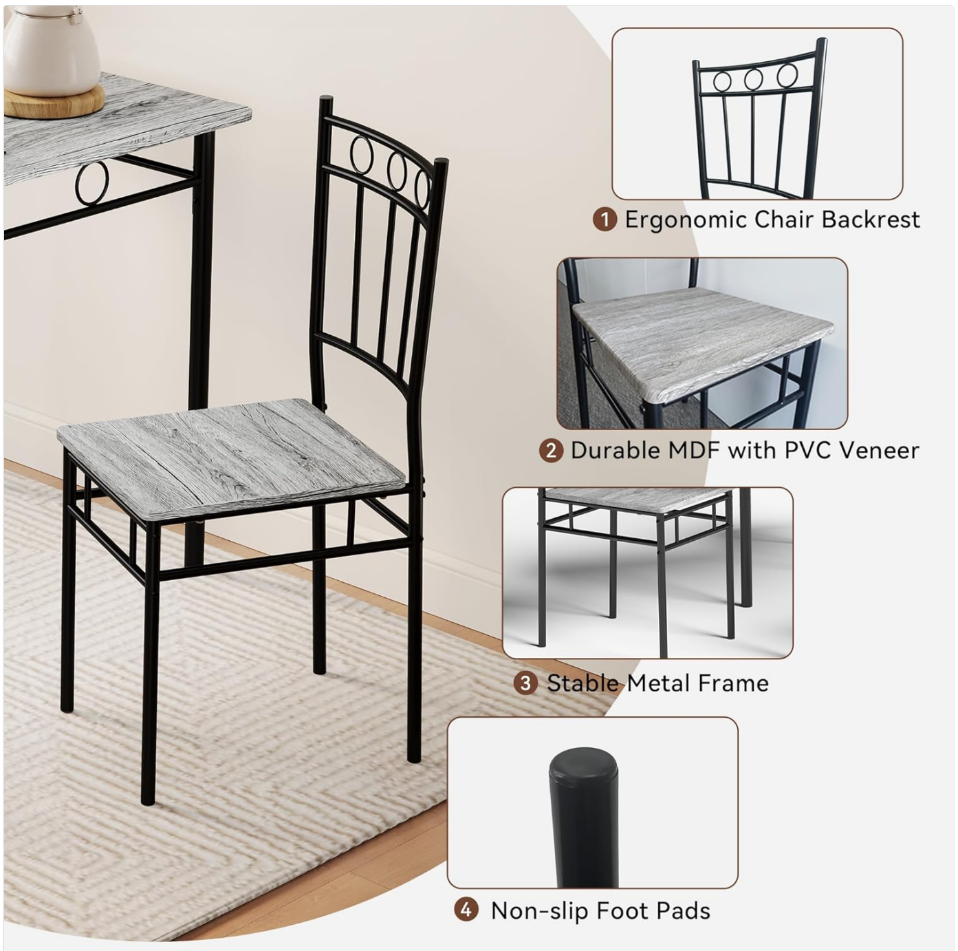
Image: Chair features including ergonomic backrest and non-slip foot pads.