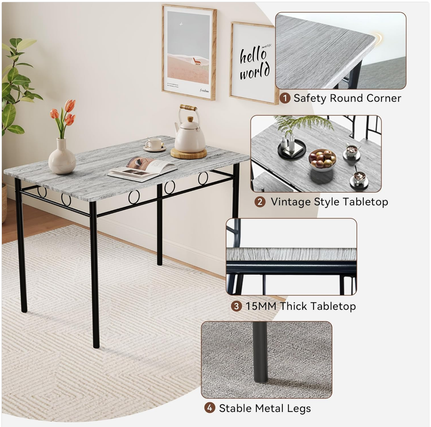
Image: Table features including safety rounded corners and stable metal legs.