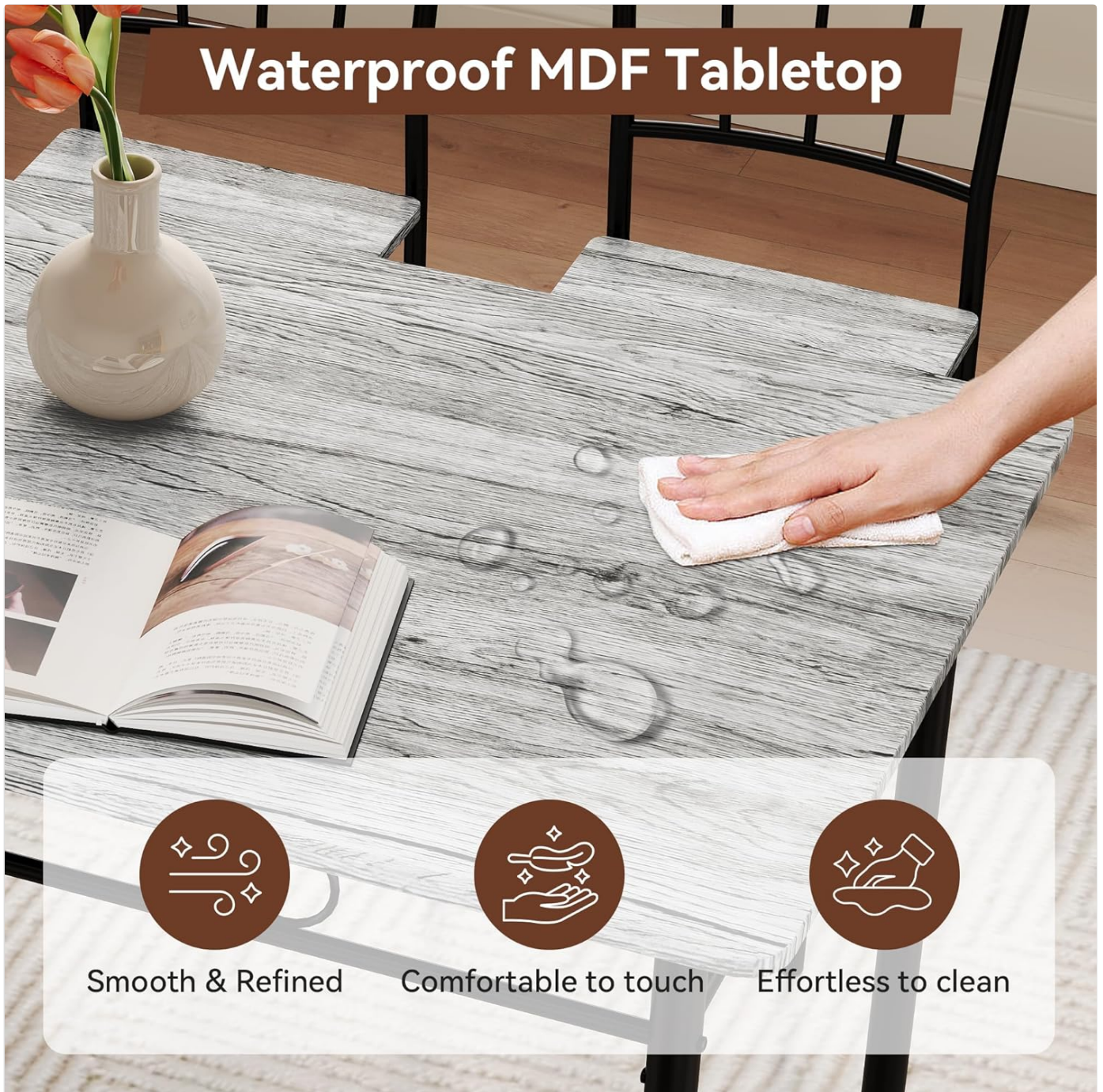
Image: The waterproof MDF tabletop, demonstrating ease of cleaning.