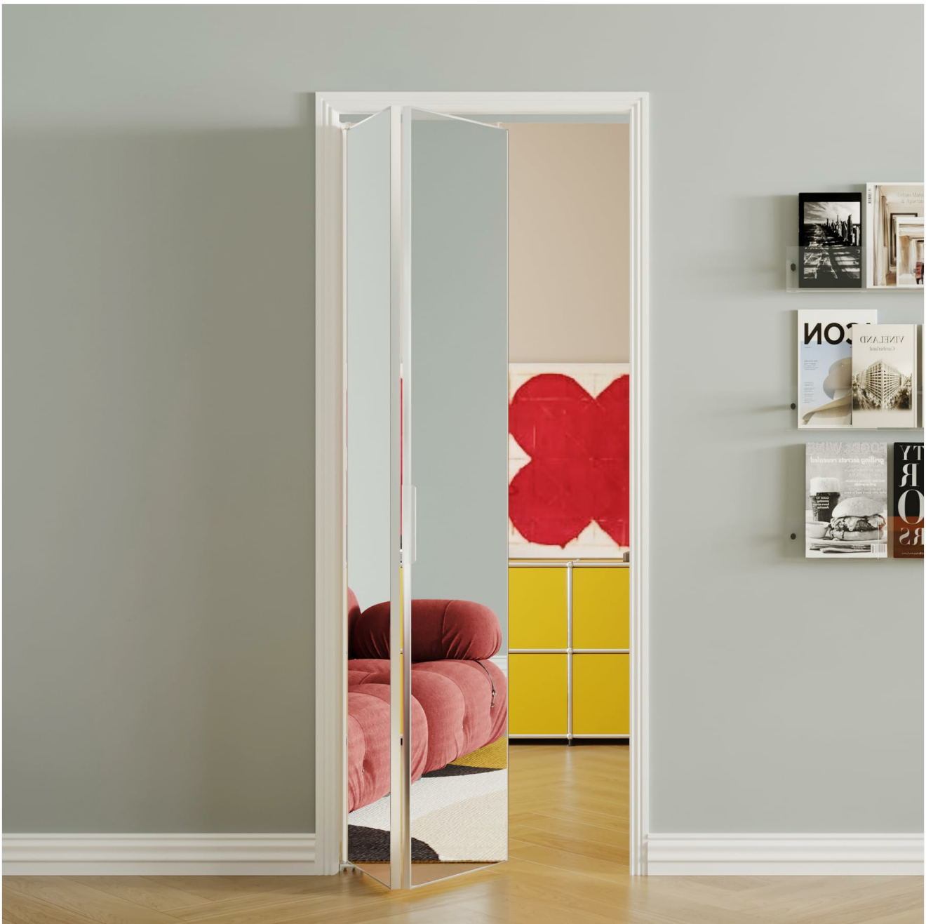
Image 1.1: The SOLRIG Bifold Mirror Closet Door, showcasing its reflective surface and sleek design.