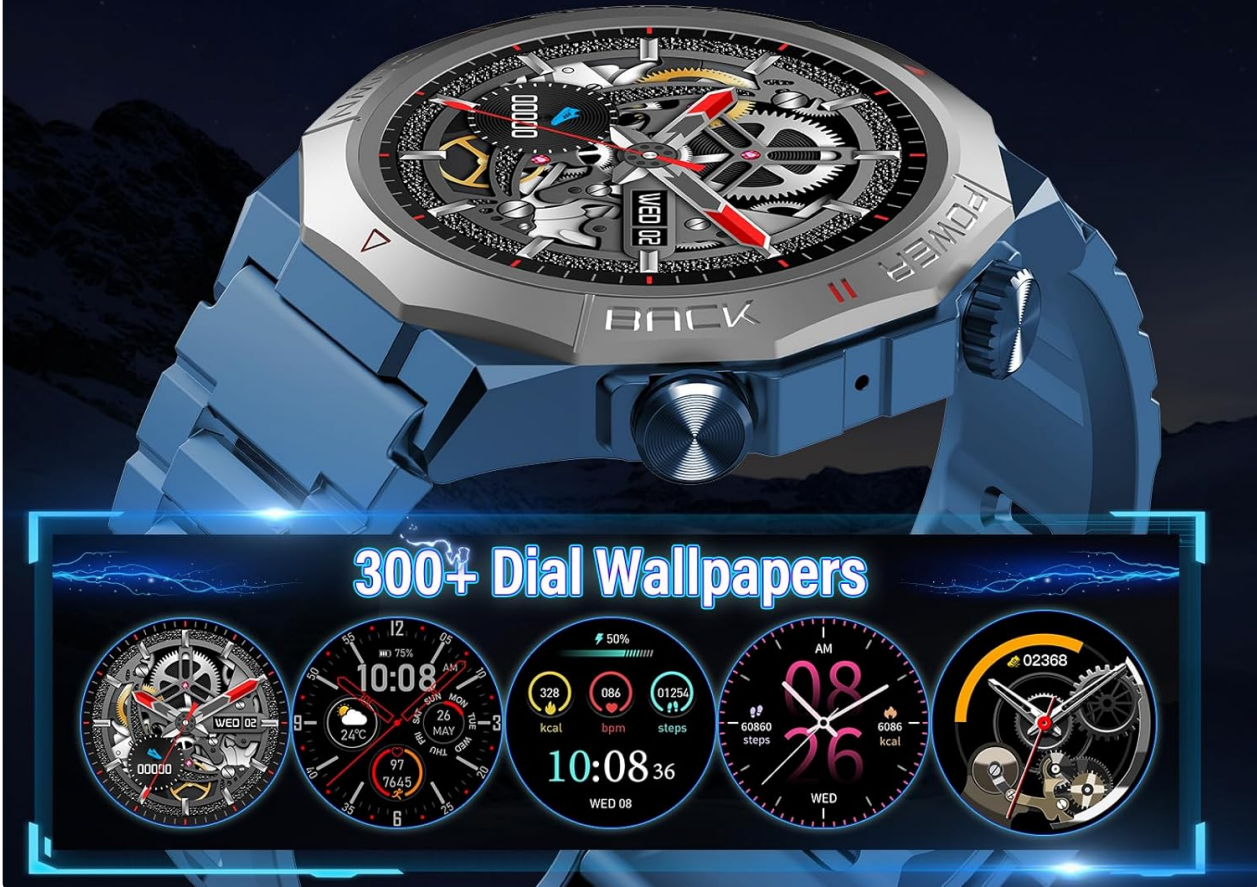
Image: Smartwatch display and various watch face options.