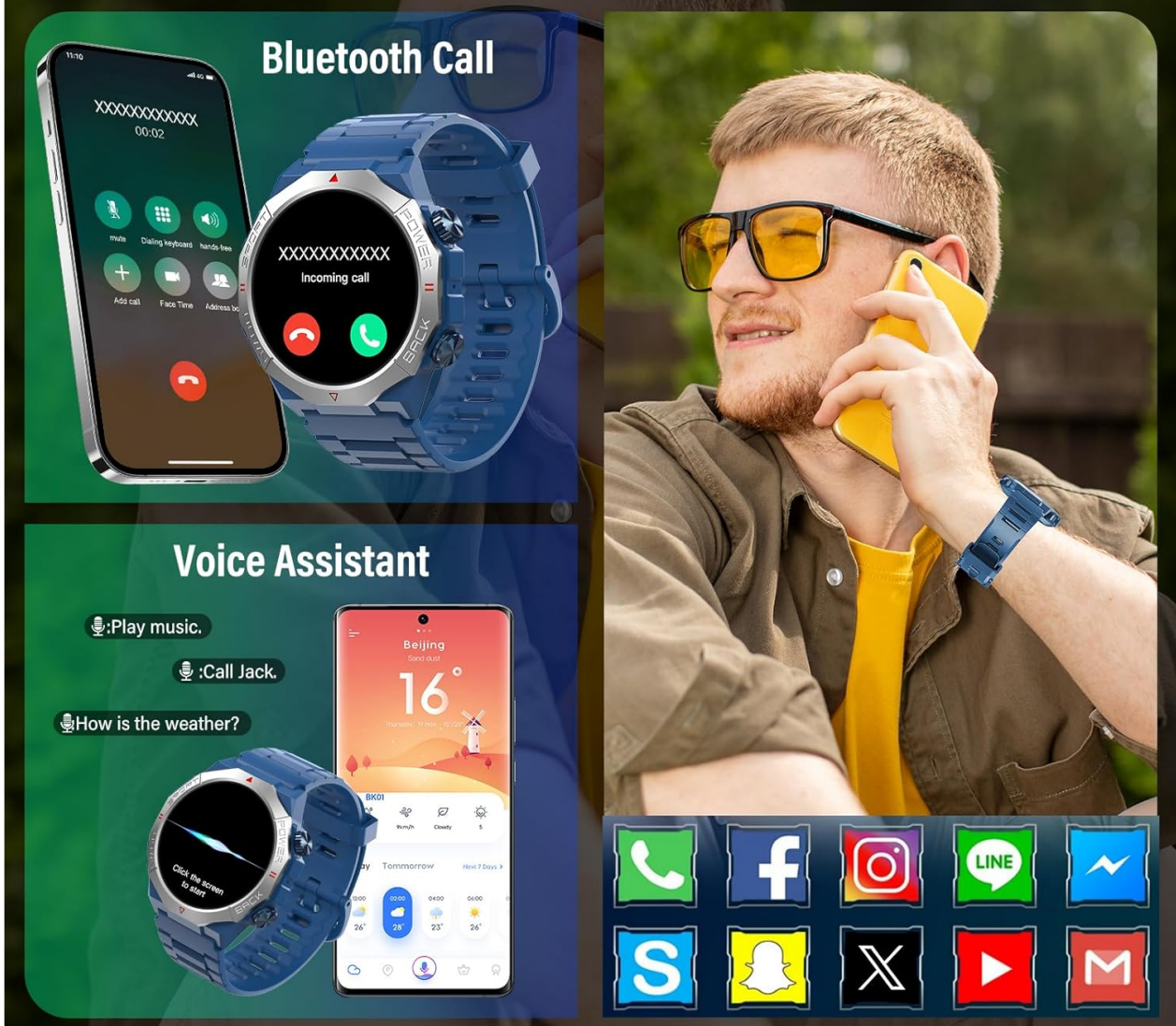
Image: Bluetooth call, notification, and voice assistant features.