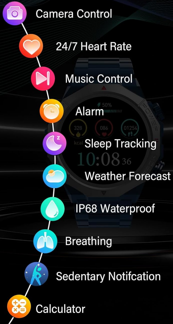
Image: Overview of additional practical functions available on the smartwatch.