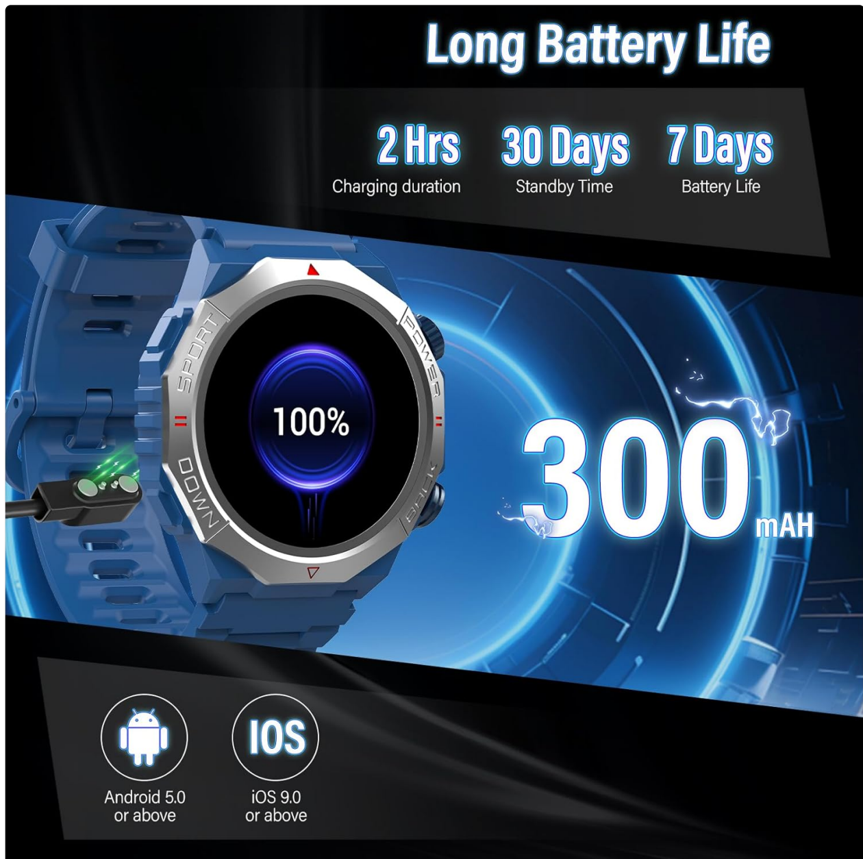
Image: Smartwatch charging via magnetic cable, displaying battery status.