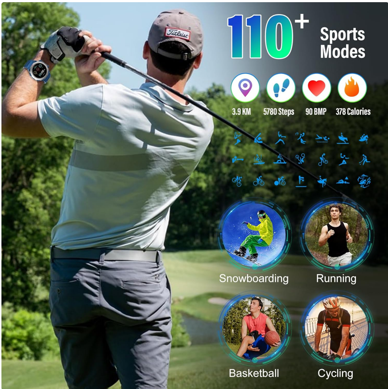
Image: Smartwatch displaying various sports modes and activity tracking metrics.