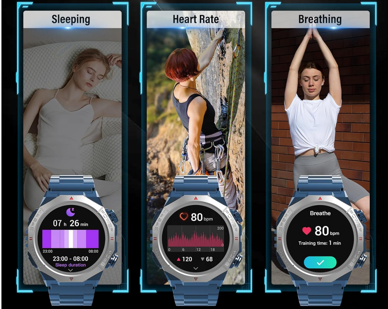
Image: Health monitoring features including sleep, heart rate, and breathing.

24-hour non-stop data detection, focusing on and understanding your health status.