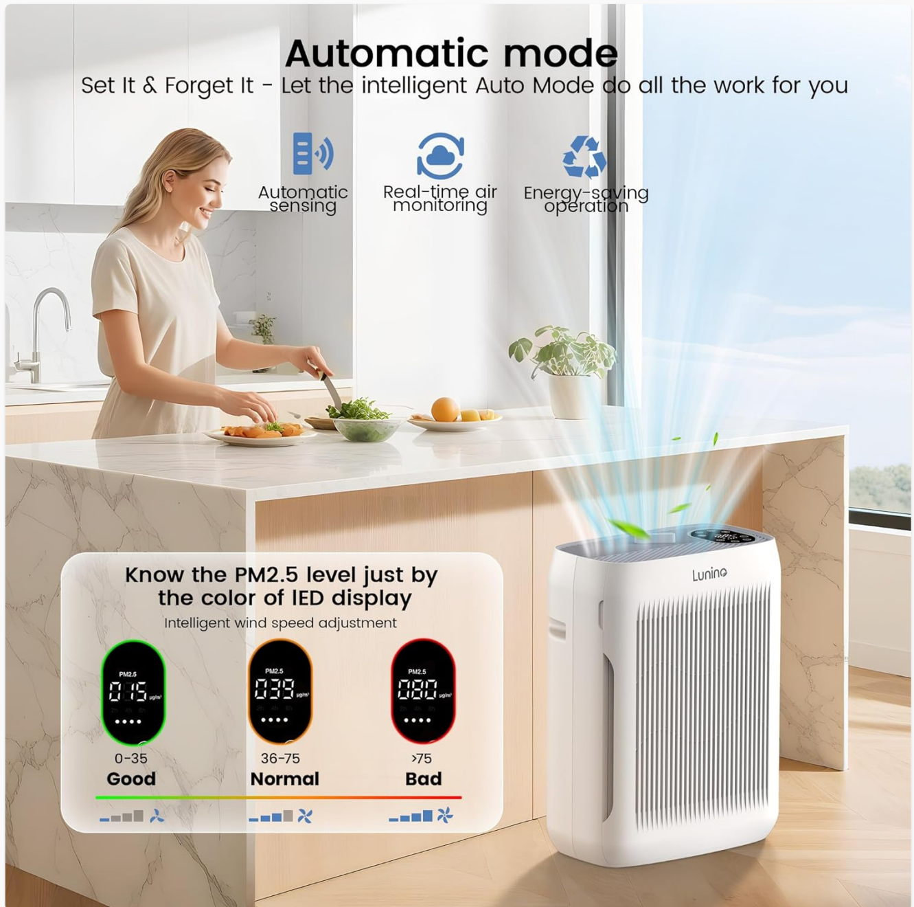
Image 4.1: Auto Mode intelligently adjusts fan speed based on real-time PM2.5 readings.