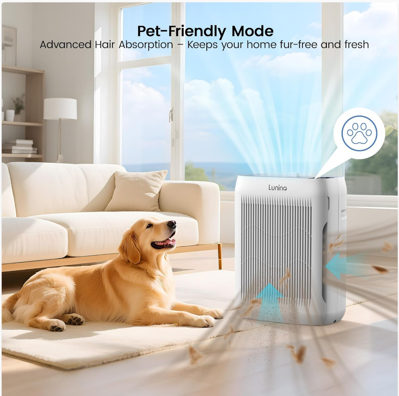
Image 4.3: Pet-Friendly Mode for effective pet hair and odor removal.