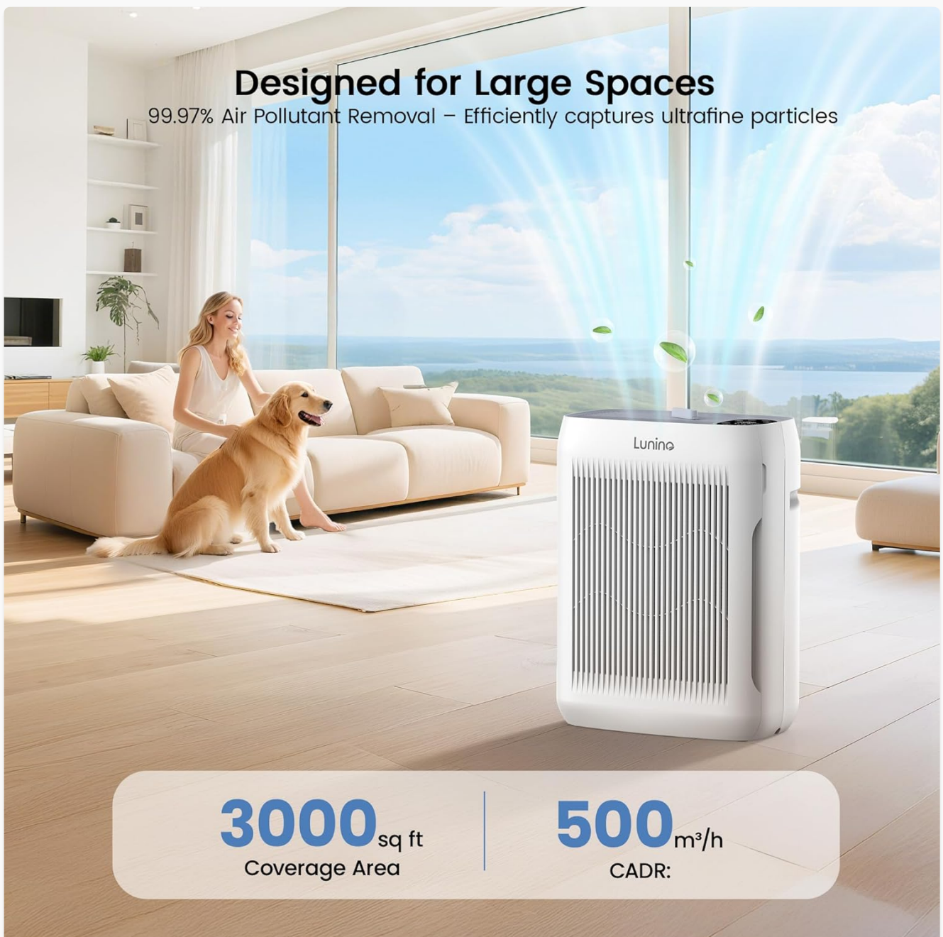
Image 2.1: The LUNINO K3 Air Purifier is designed for large spaces, covering up to 3000 sq ft.