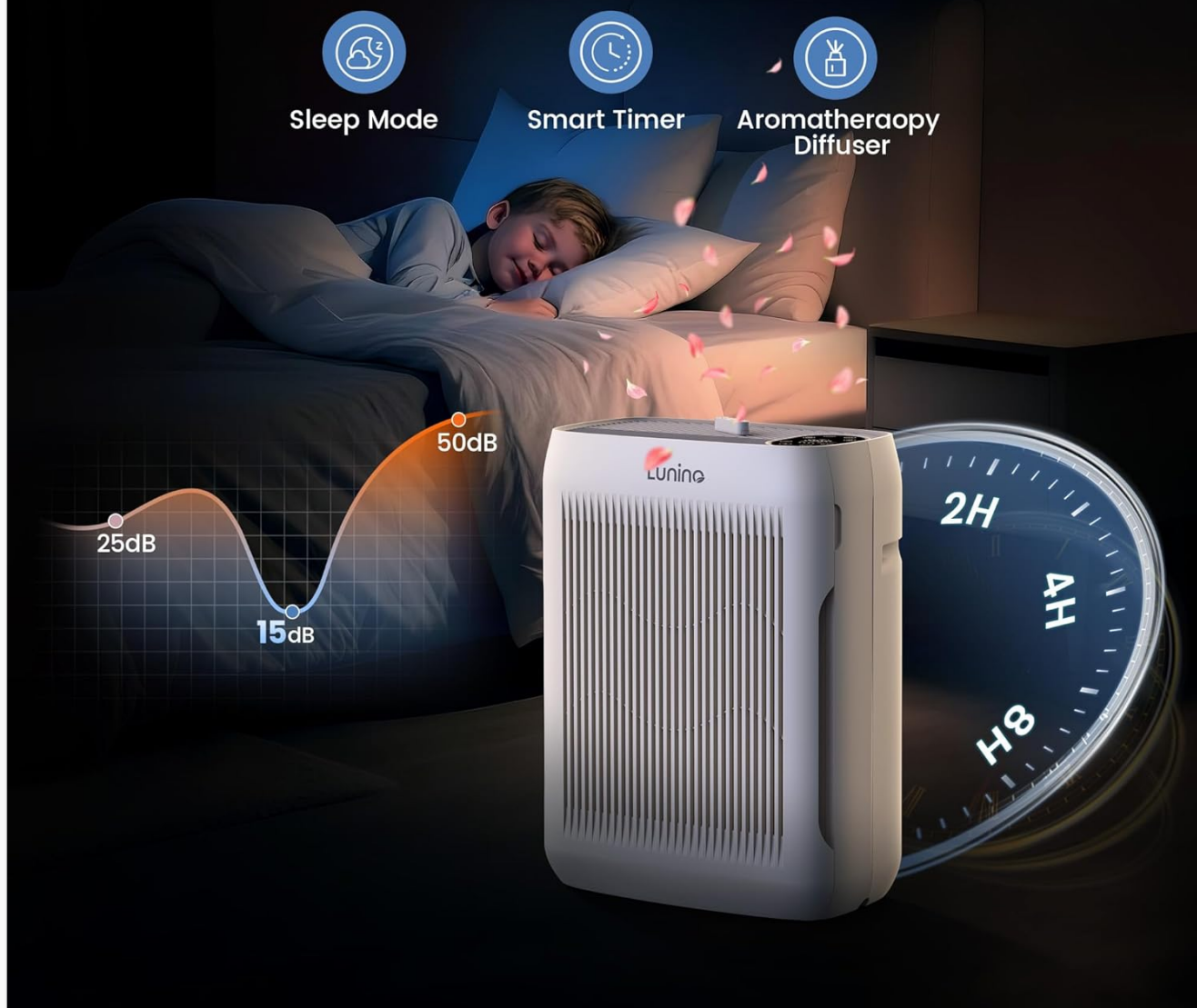
Image 4.4: Sleep Mode provides quiet operation and dimmed lights for a peaceful night.

3-in-1 Air Purifier – Upgrade your sleep experience