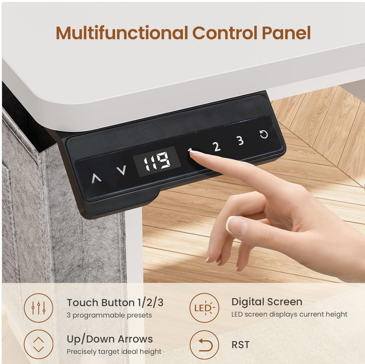
Figure 2: Multifunctional Control Panel. This image displays the control panel for the electric standing desk, featuring an LED screen that shows the current height, up/down arrows for precise adjustments, and three programmable preset buttons (1, 2, 3) for saving preferred heights. An RST button is also visible for resetting.

The desk features an electric height adjustment system controlled by a sleek LED display and keypad. Use the up (▲) and down (▼) arrows to precisely adjust the desk height. You can also save up to three preferred height settings using the '1', '2', and '3' buttons for quick access. The adjustable height range is from 30 inches to 47 inches.