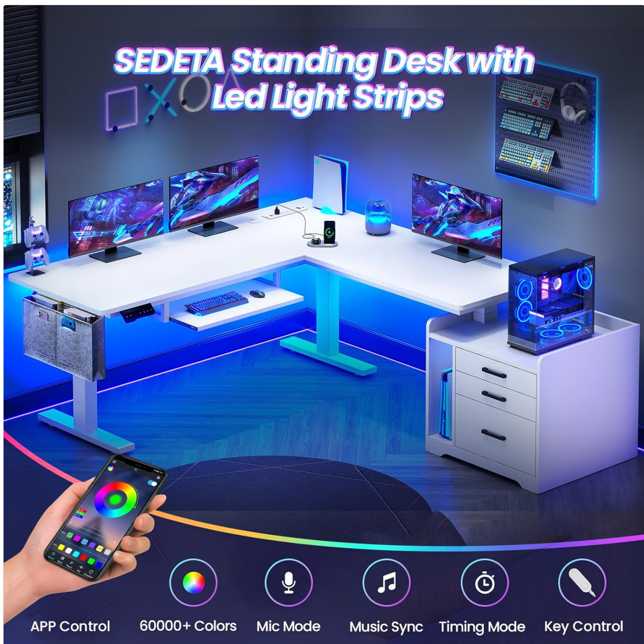
Figure 4: LED Light Strips. This image displays the L-shaped desk with its integrated RGB LED light strips creating an ambient glow. A smartphone screen showing the control app is visible, indicating features like 60,000+ colors, mic mode, music sync, and timing mode.