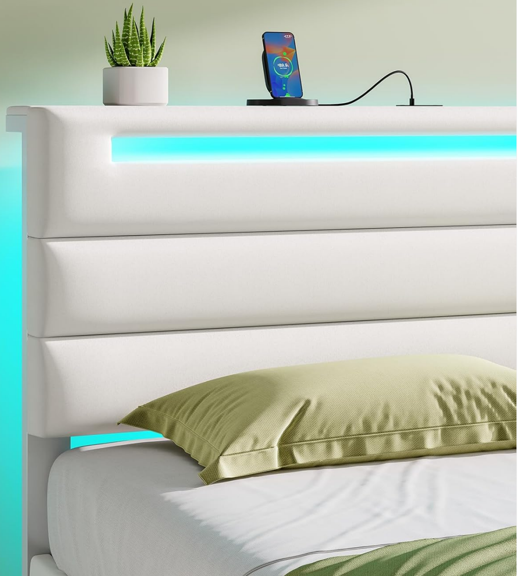
Image 6.1: The soft, breathable white velvet fabric of the upholstered headboard, designed for comfort and ease of maintenance.