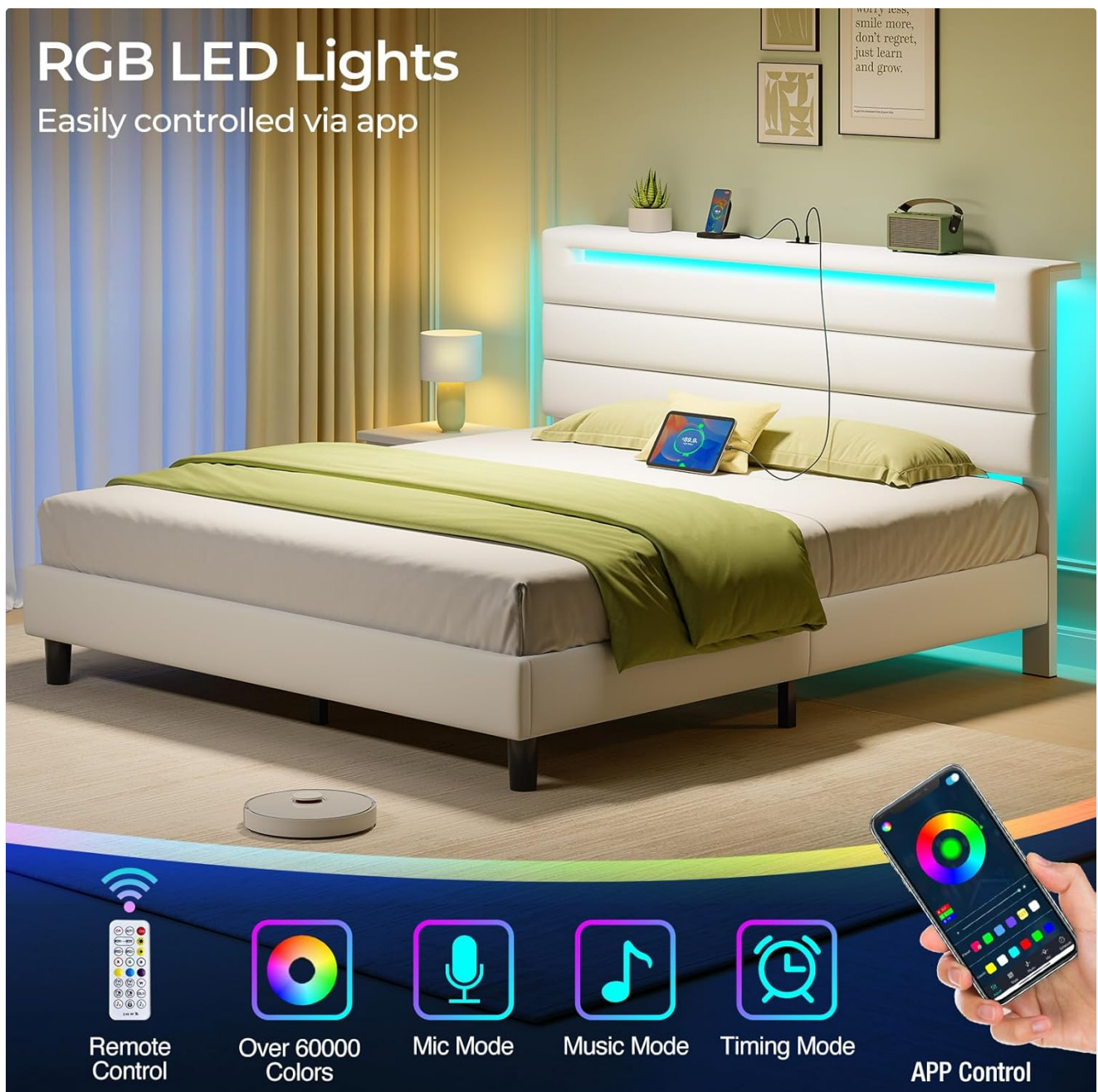
Image 5.2.1: The bed frame's RGB LED lights in operation, demonstrating control via remote and smartphone app with various modes.