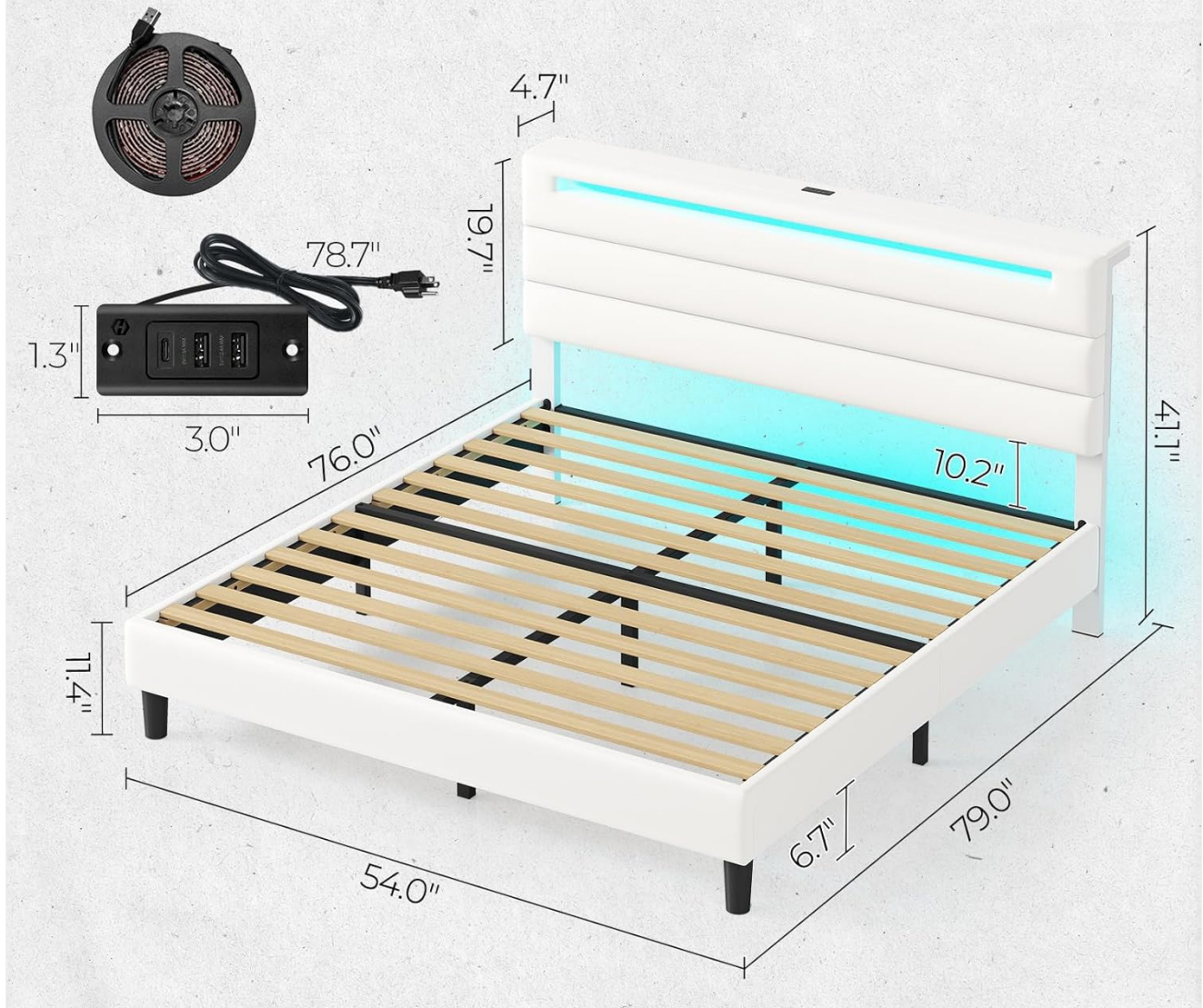
Image 3.1: Exploded view of the bed frame with dimensions and main components highlighted, including the power strip and LED light reel.