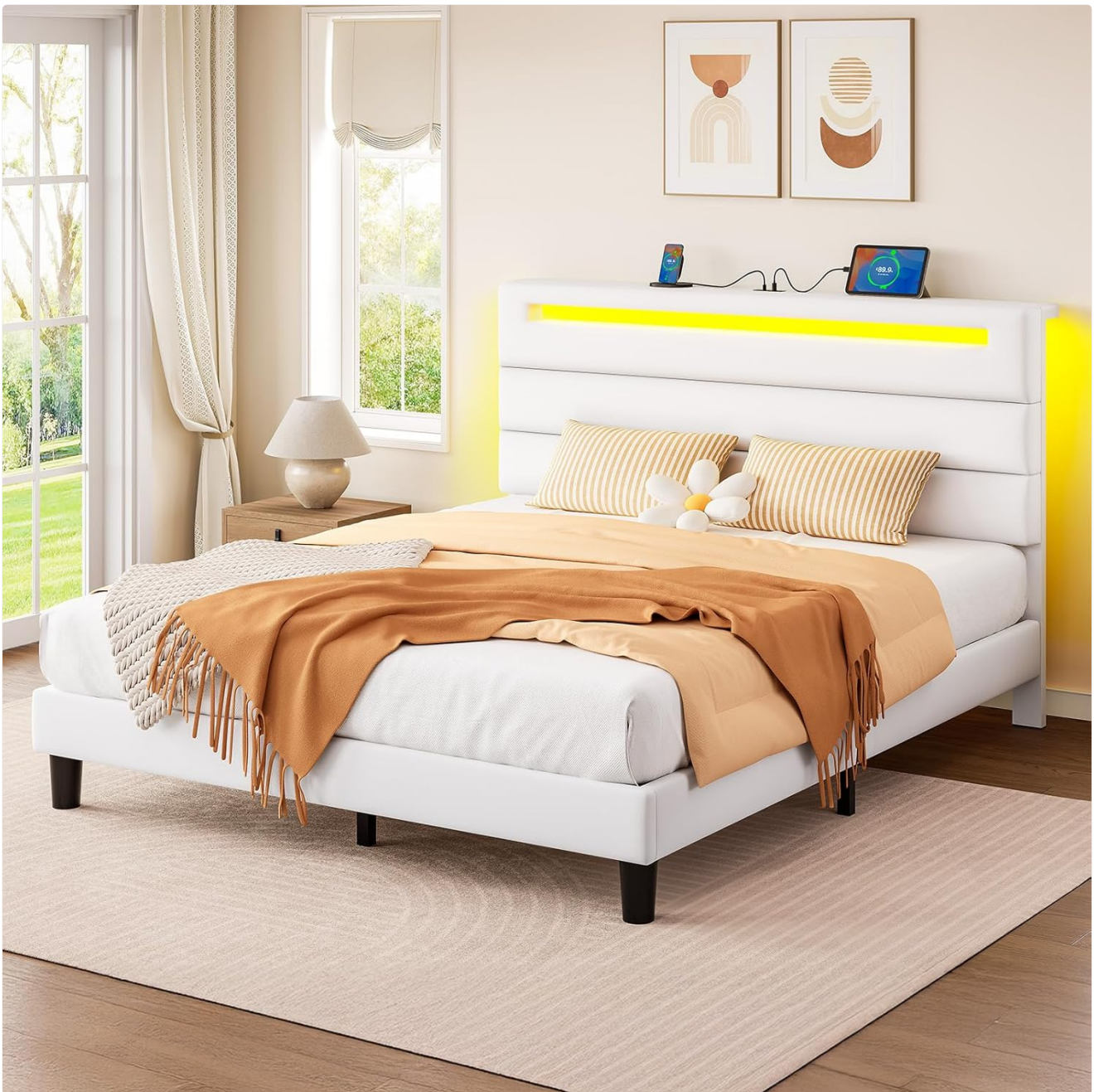
Image 1.1: The Rolanstar Full Size Bed Frame, showcasing its integrated LED lighting and upholstered headboard in a typical bedroom environment.