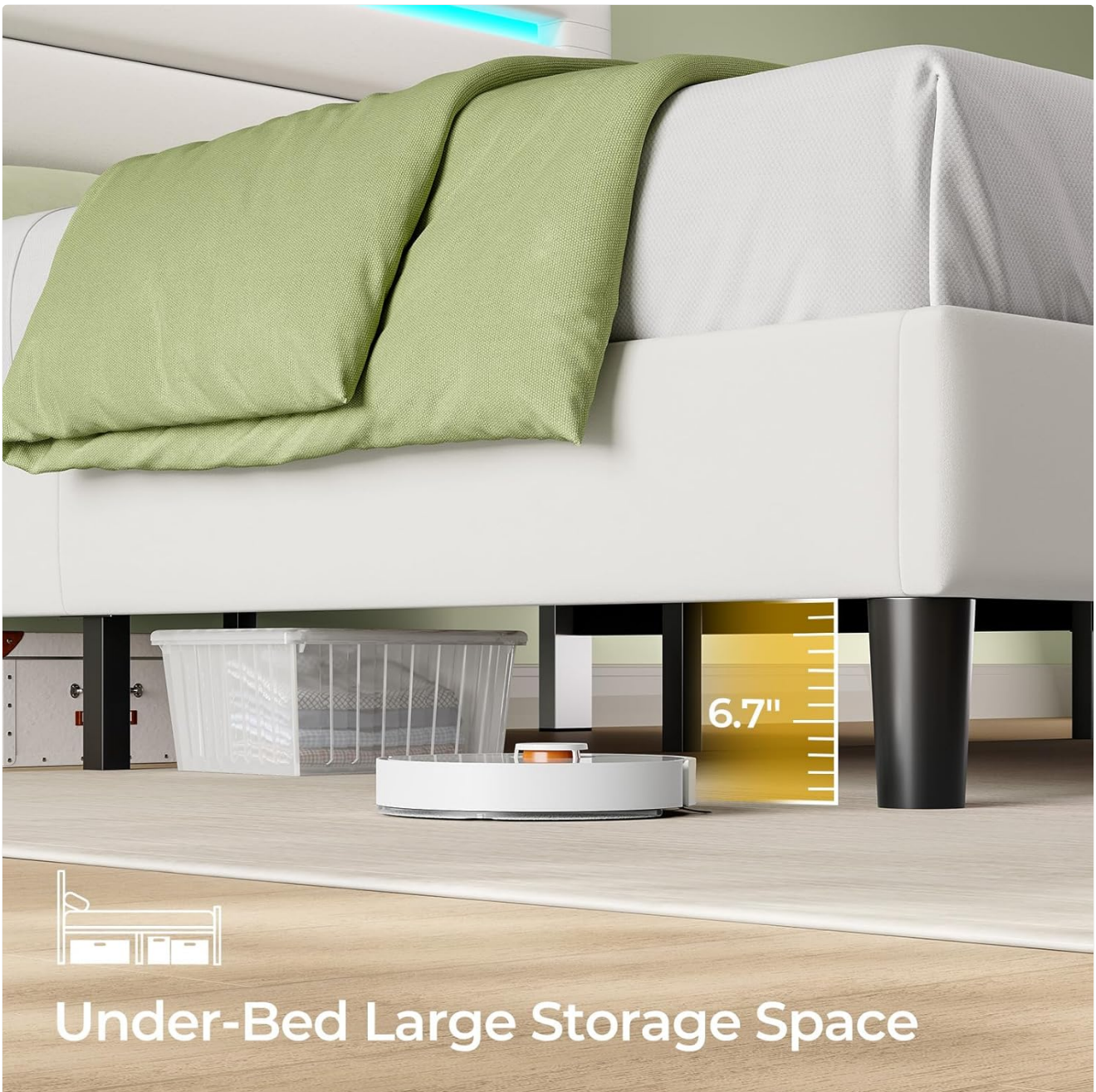
Image 6.2: The generous 6.7-inch under-bed clearance, facilitating easy cleaning and providing space for storage solutions.