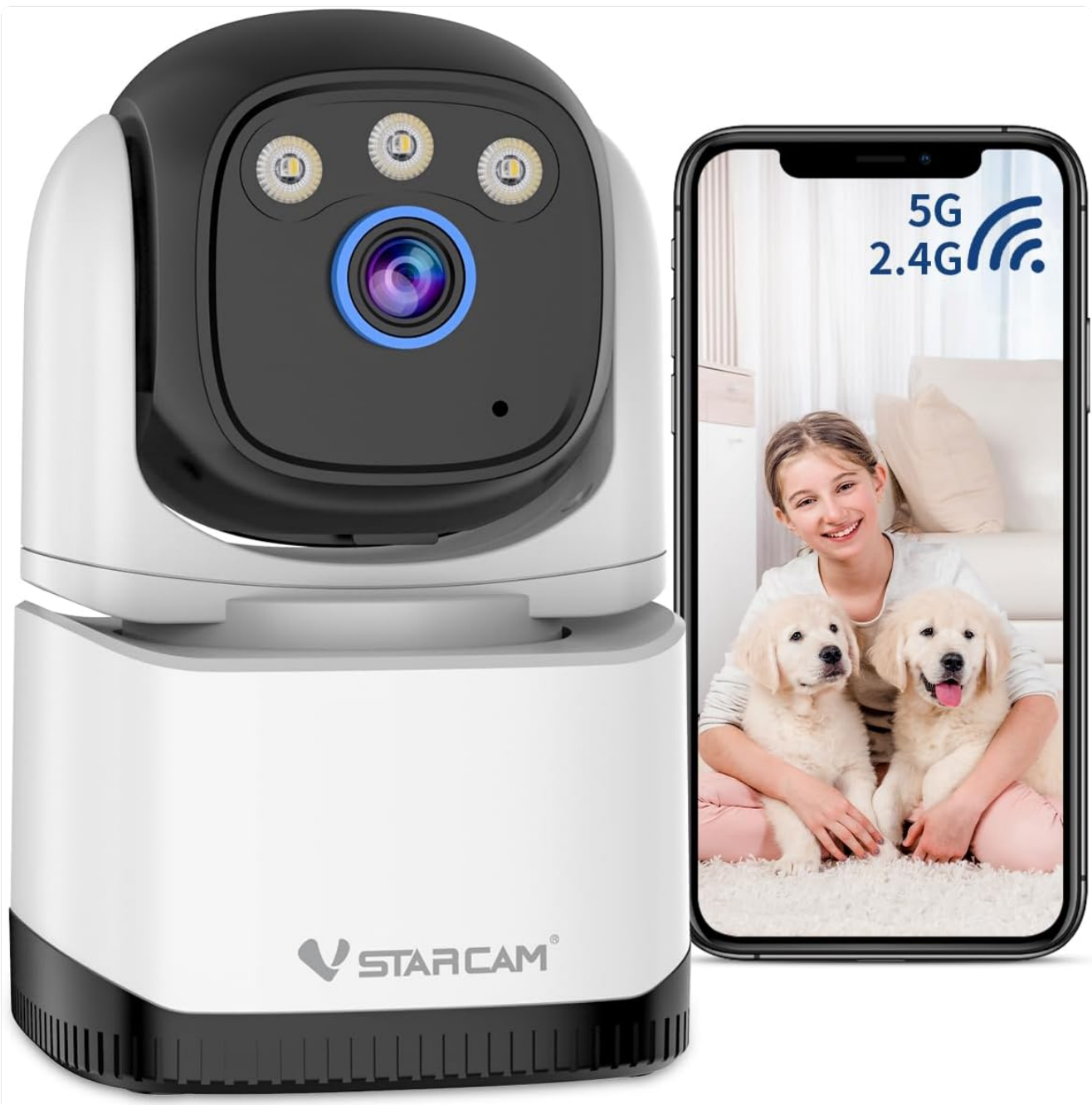
Figure 2.1: VSTARCAM 4MP Indoor Security Camera and its mobile app interface.