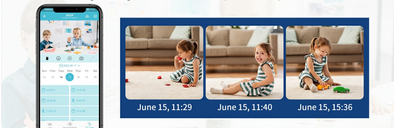
Figure 5.4: The camera's AI detects and tracks human figures, sending instant alerts.

Navigate through the timeline and access specific video clips with ease