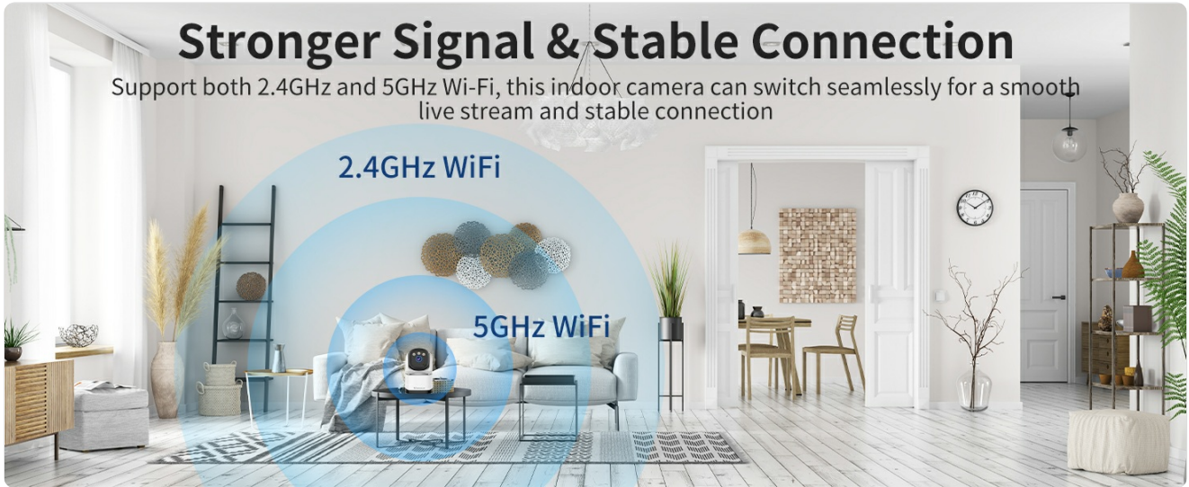
Figure 4.1: The camera supports both 2.4GHz and 5GHz WiFi bands for a stronger and more stable connection.

Open the "O-KAM Pro" app and follow the on-screen instructions to add your new camera. The camera supports dual-band WiFi (2.4GHz and 5GHz) for optimal connection stability and speed. Ensure your smartphone is connected to the same Wi-Fi network you intend to connect the camera to during the setup process.