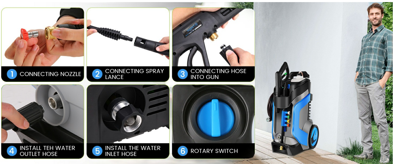
Figure 2.1: Assembly steps for the Commowner Electric Pressure Washer.