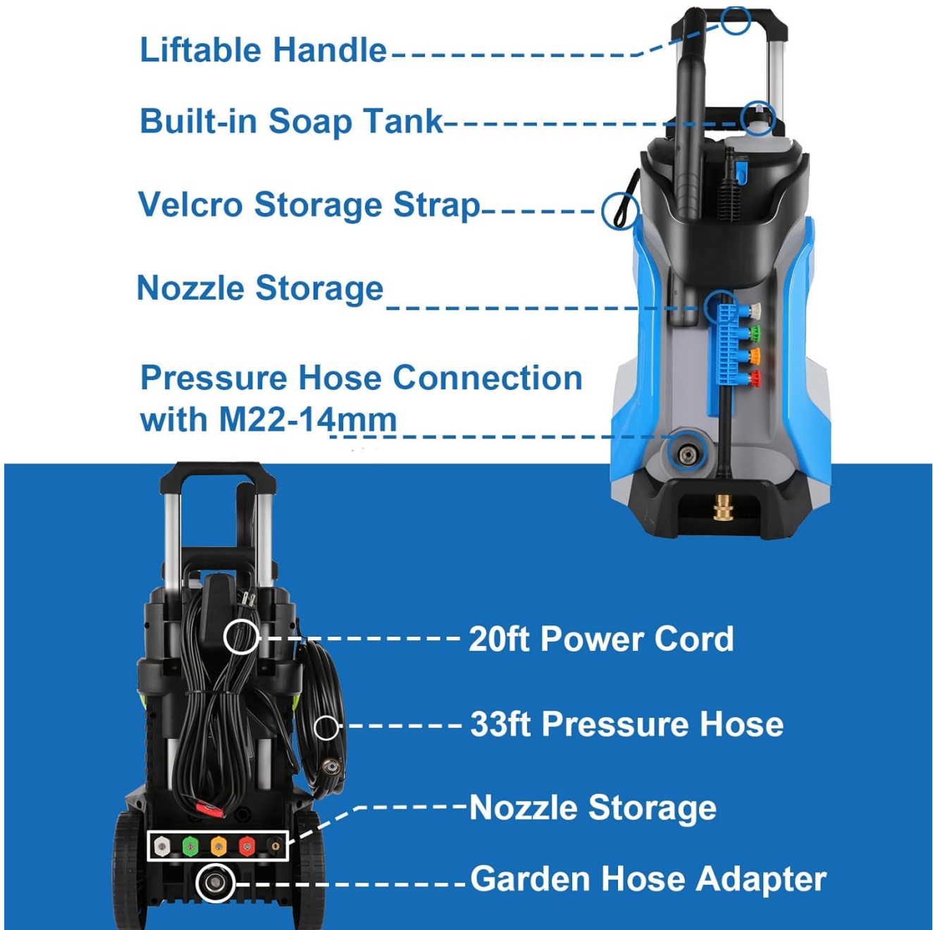
Figure 2.2: Overview of pressure washer components and connections.