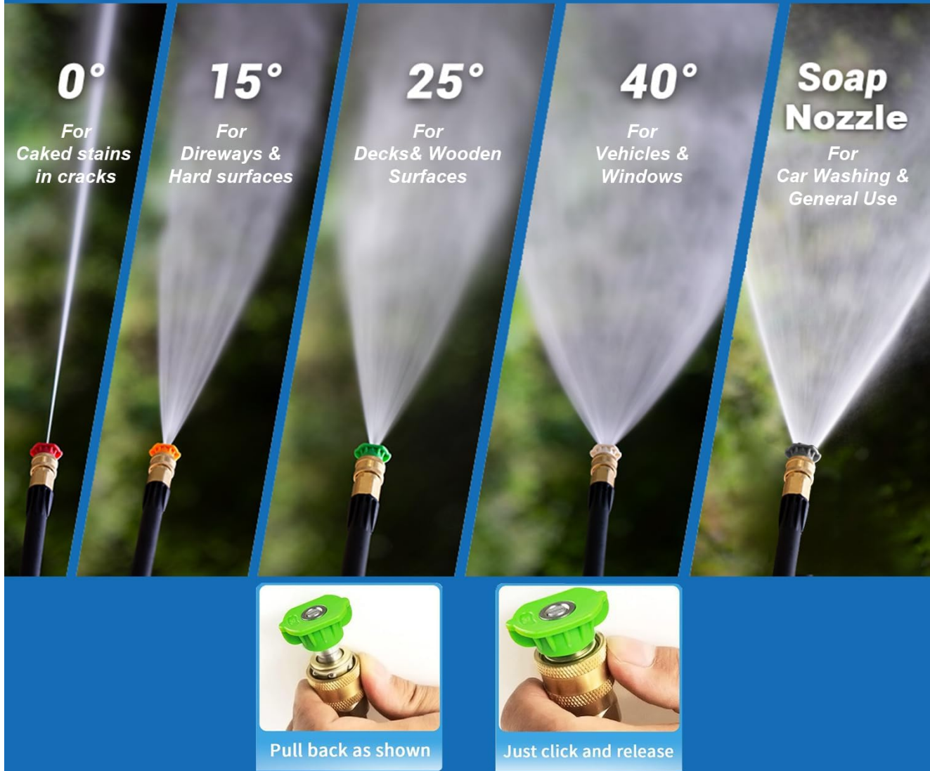
Figure 3.1: Quick Connect Nozzle types and their applications.