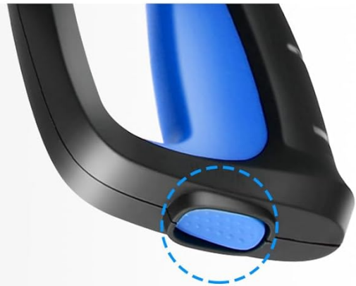
Figure 3.4: Professional and upgraded safety design features.