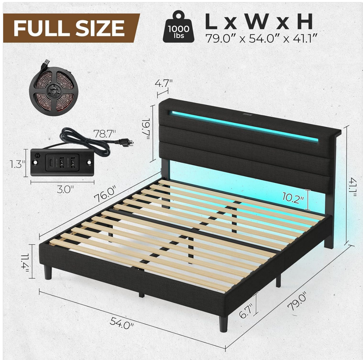
Image: Overview of the Rolanstar Full Size Bed Frame, showing its dimensions, weight capacity (1000 lbs), and key components including the power strip and LED light strip.