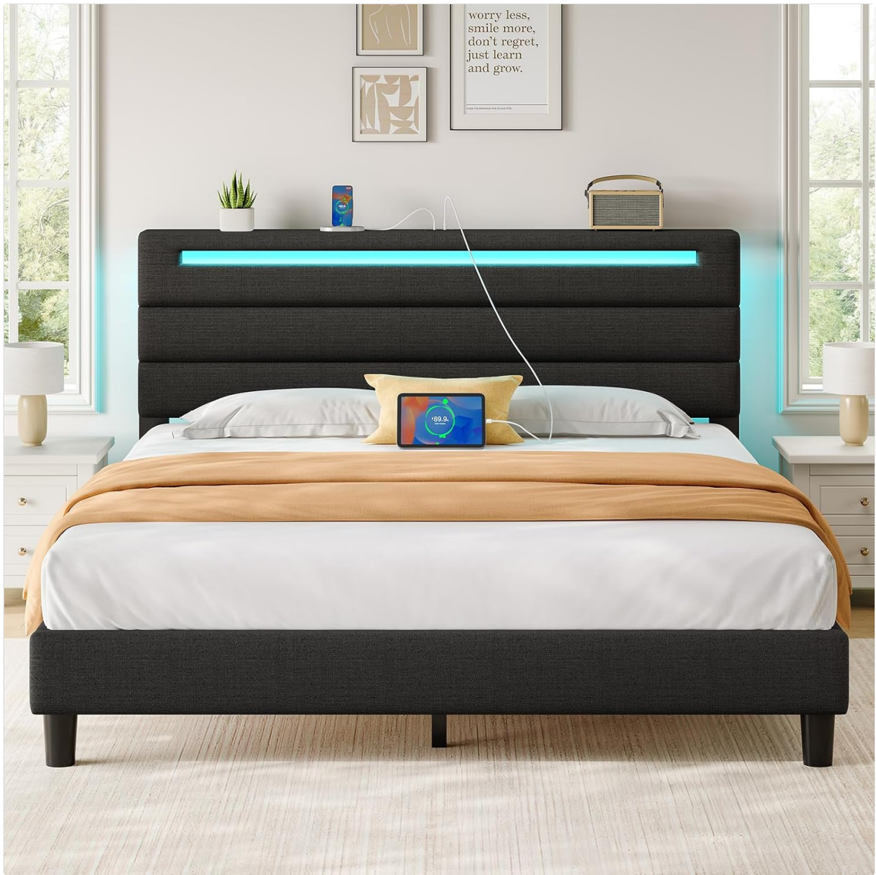
Image: The fully assembled Rolanstar Full Size Bed Frame, showcasing the headboard with its integrated charging station and illuminated LED lights, ready for use.