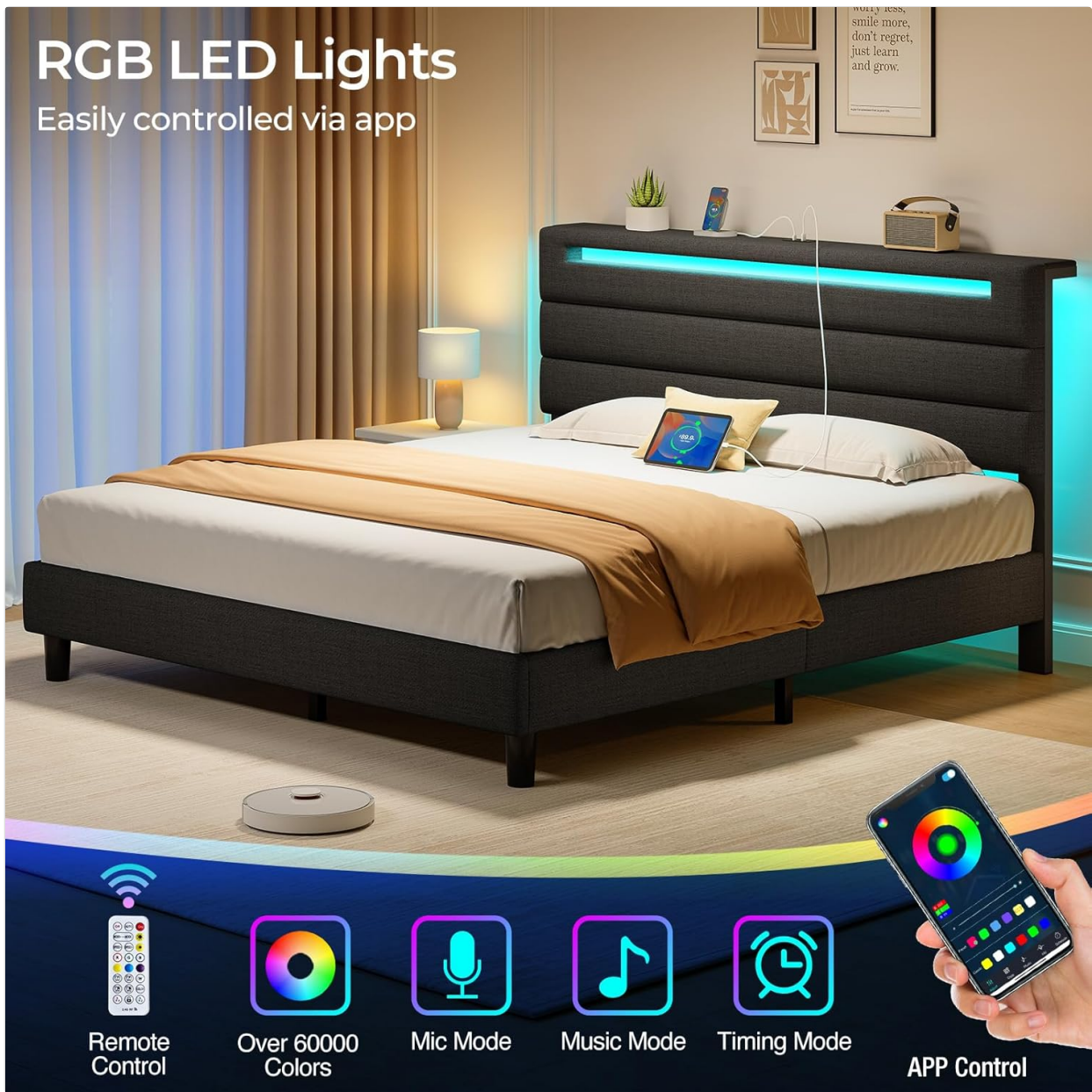
Image: The bed frame illuminated by RGB LED lights, demonstrating various color options and indicating control via remote or smartphone application.