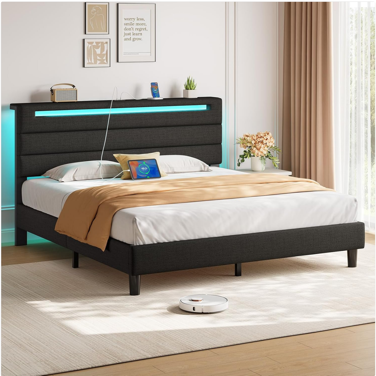
Image: The Rolanstar Full Size Bed Frame with its upholstered headboard, integrated LED lighting, and charging station, positioned in a modern bedroom environment.