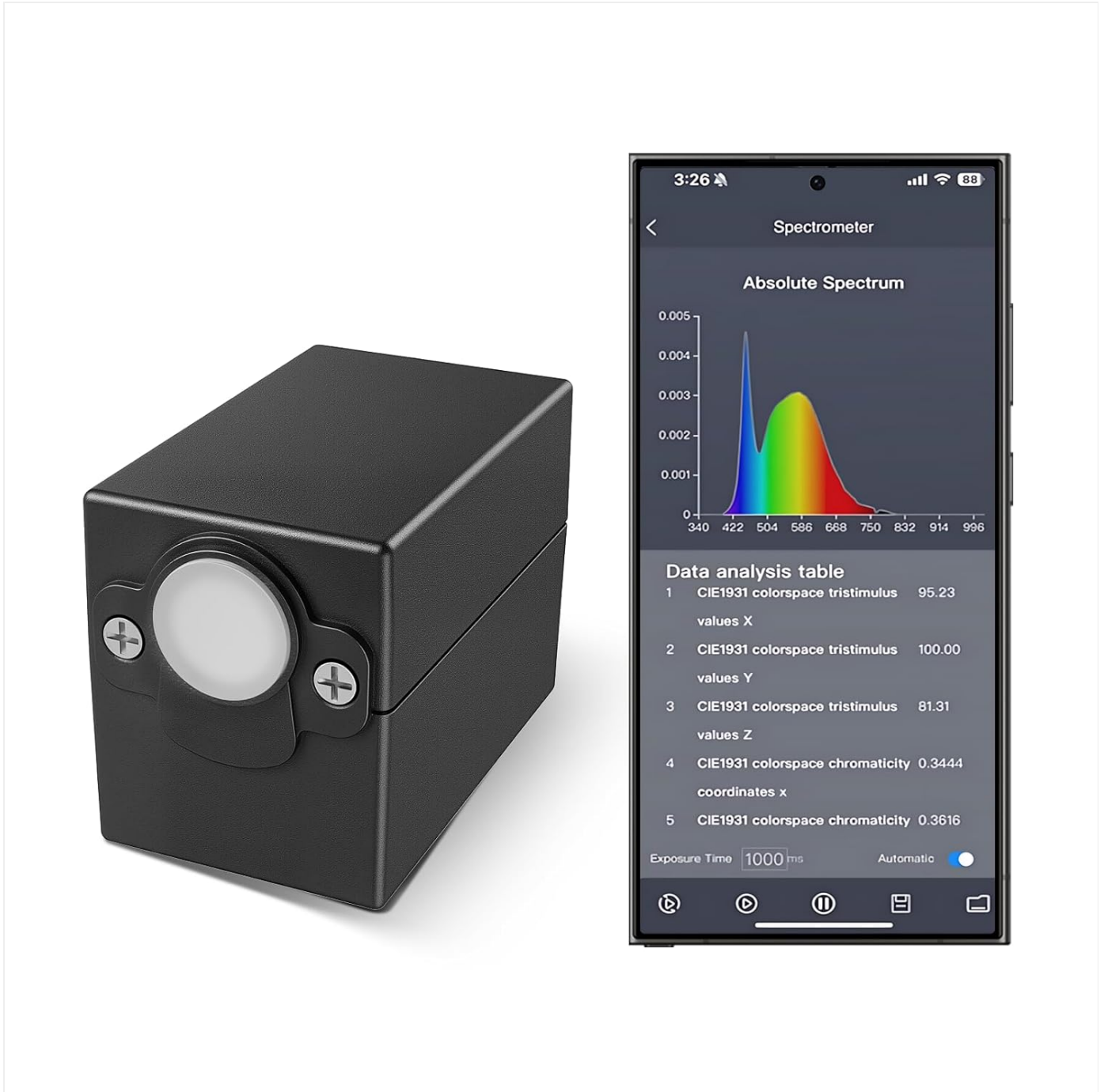
Figure 4.1: The Vodeson Handheld Spectrometer connected to a smartphone, showing real-time spectral data and analysis. The device is black with a white optical sensor on the front.

wavelength range and is designed for portability and ease of use with compatible devices.