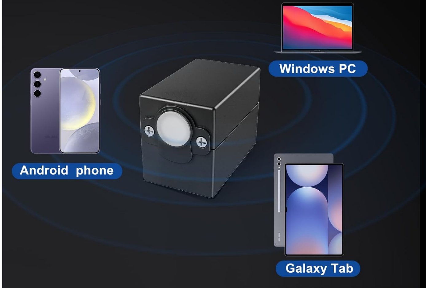
Figure 4.3: The spectrometer offers wide compatibility with various operating systems, including Windows 8/10/11 and Android devices such as smartphones and tablets.