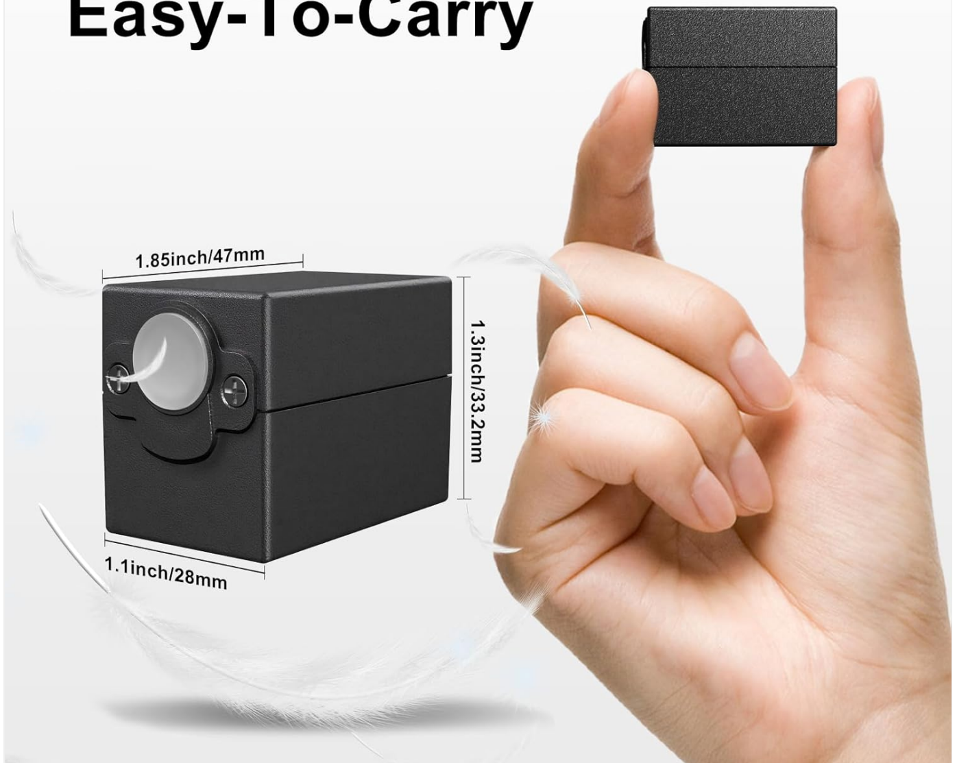
Figure 4.2: Illustrates the compact and lightweight design of the spectrometer, fitting easily in the palm of a hand. Dimensions are approximately 1.85 inches (47mm) by 1.3 inches (33.2mm) by 1.1 inches (28mm).