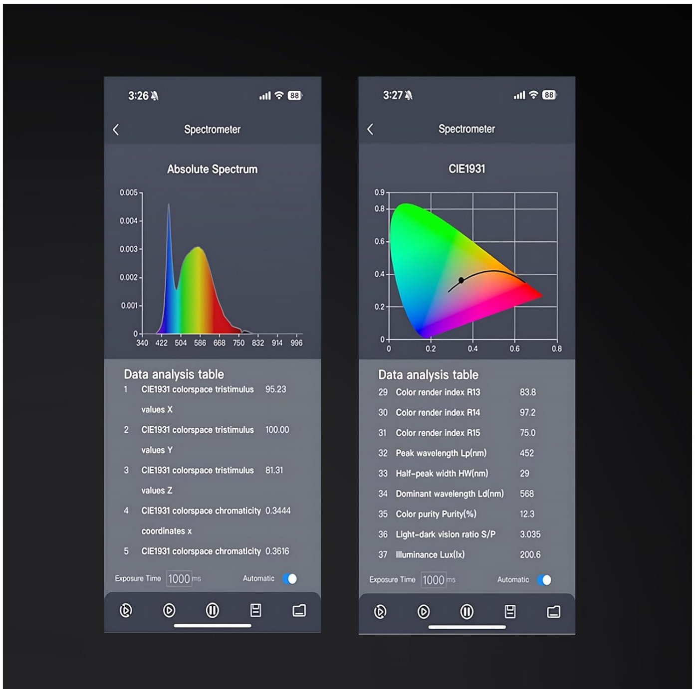
Figure 6.3: A comprehensive list of measurable parameters supported by the spectrometer, categorized into Basic Parameters, Blue Light Hazard, and Plant Light Parameters, including metrics like CCT, CRI, PAR, and PPFD.