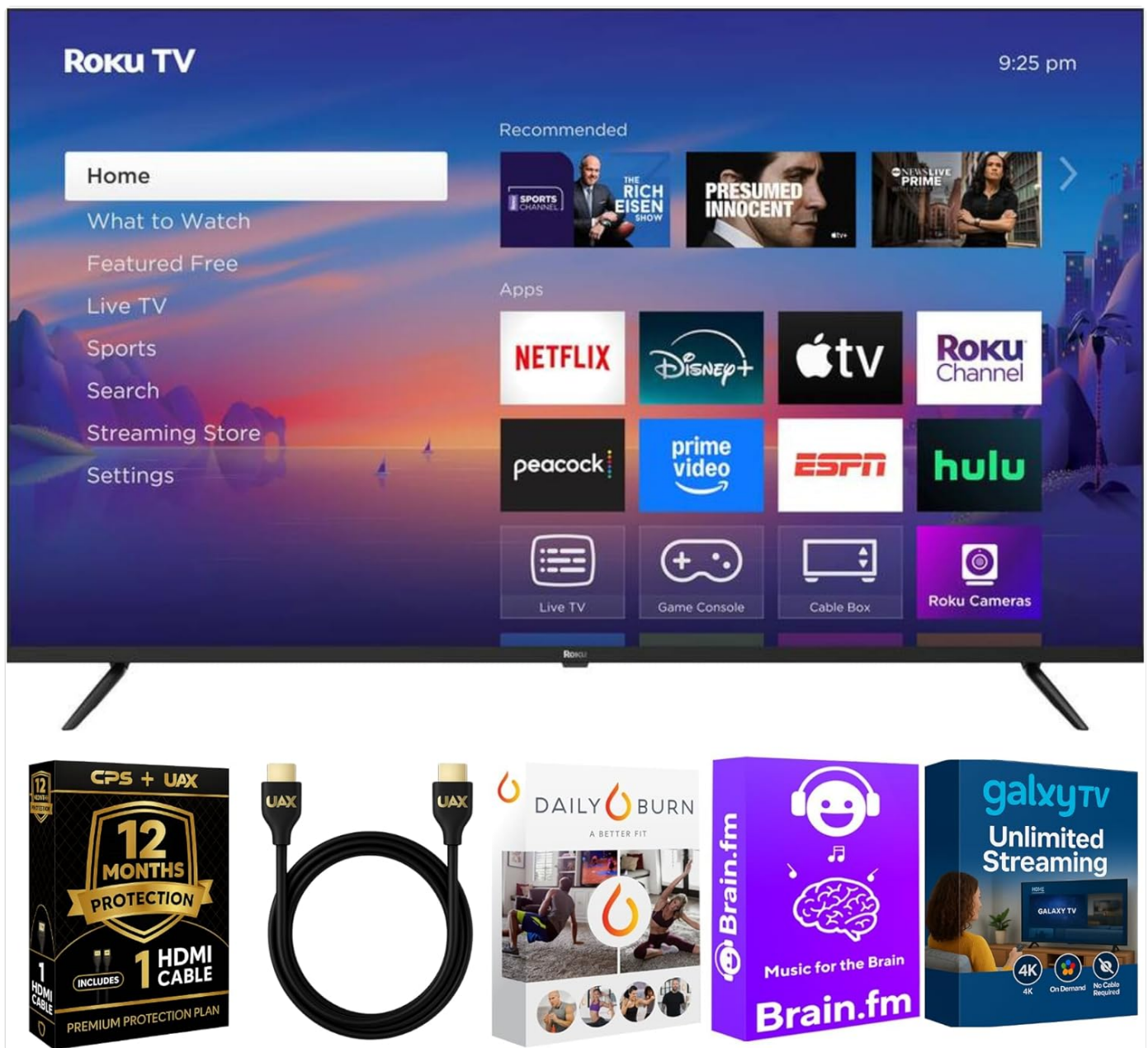
Image: The Roku TV home screen, showing recommended content and a selection of popular streaming applications like Netflix, Disney+, and Prime Video.