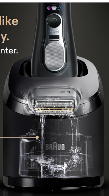
Image: The Braun Series 9 PRO+ electric shaver docked in its 6-in-1 SmartCare Center, showing the cleaning process.

Cleans hygienically, removes skin and hair particles.