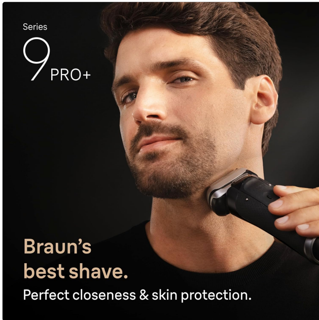
Image: Man using the Braun Series 9 PRO+ electric shaver for a close shave.