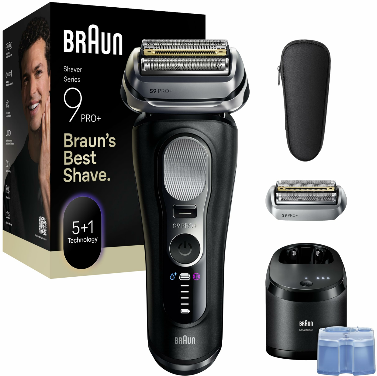
Image: Braun Series 9 PRO+ Electric Shaver with its SmartCare Center.