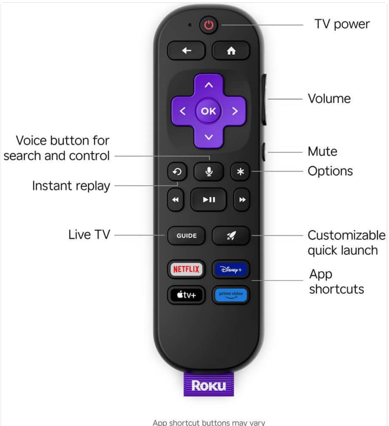
Figure 3: Roku TV Voice Remote layout.